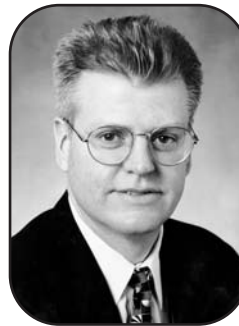
FRANCIS X. GRIBBON Public Information