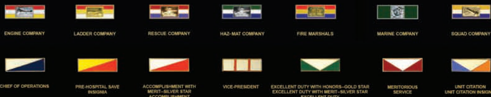
ENGINE COMPANY LADDER COMPANY RESCUE COMPANY HAZ-MAT COMPANY FIRE MARSHALS MARINE COMPANY SQUAD COMPANY CHIEF OF OPERATIONS PRE-HOSPITAL SAVE INSIGNIA ACCOMPLISHMENT WITH MERIT-SILVER STAR ACCOMPLISHMENT VICE-PRESIDENT EXCELLENT DUTY WITH HONORS-GOLD STAR EXCELLENT DUTY WITH MERIT-SILVER STAR EXCELLENT DUTY MERITORIOUS SERVICE UNIT CITATION UNIT CITATION INSIGNIA