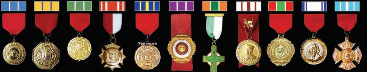
THIRD ALARM ASSOCIATION 1950