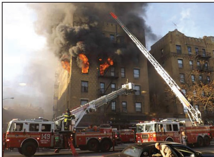
Ladder 149 members in action at Brooklyn Box 1199, 100th Street/4th Avenue, Bay Ridge, November 23, 2012.