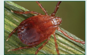
Asian longhorned ticks have not been shown to spread human diseases in the United States. Image 4. Asian longhorned tick, adult female

For more information on the clinical signs and treatment for each disease, visit nyc.gov/health/ticks .