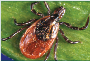
Blacklegged ticks can spread Lyme disease, anaplasmosis, babesiosis and Powassan virus disease. Image 1. Blacklegged tick, adult female