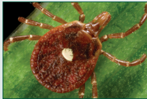
Lone star ticks can spread ehrlichiosis. Image 2. Lone star tick, adult female