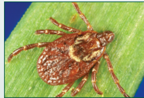
American dog ticks can spread Rocky Mountain spotted fever (RMSF). Image 3. American dog tick, adult female