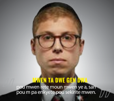
MWEN TA DWE GEN DWA pou mwen rete moun mwen ye a, san pou m pa enkyete pou sekirite mwen.