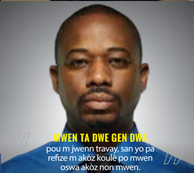
MWEN TA DWE GEN DWA pou m jwenn travay, san yo pa refize m akòz koulè po mwen oswa akòz non mwen.