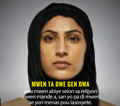
MWEN TA DWE GEN DWA pou mwen abiye selon sa relijyon mwen mande a, san yo pa di mwen se yon menas pou lasosyete.