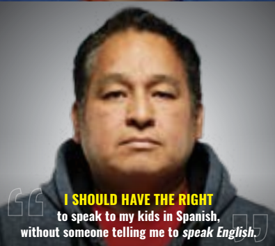
I SHOULD HAVE THE RIGHT to speak to my kids in Spanish, without someone telling me to speak English.