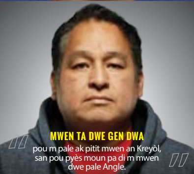
MWEN TA DWE GEN DWA pou m pale ak pitit mwen an Kreyòl, san pou pyès moun pa di m mwen dwe pale Angle.