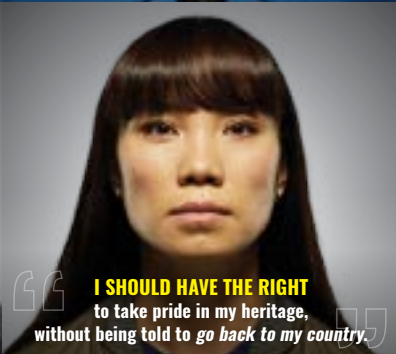
I SHOULD HAVE THE RIGHT to take pride in my heritage, without being told to go back to my country.