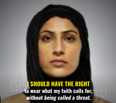
I SHOULD HAVE THE RIGHT to wear what my faith calls for, without being called a threat.