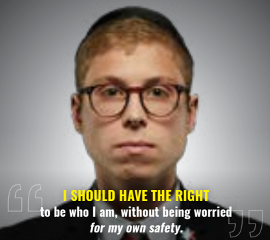
I SHOULD HAVE THE RIGHT to be who I am, without being worried for my own safety.