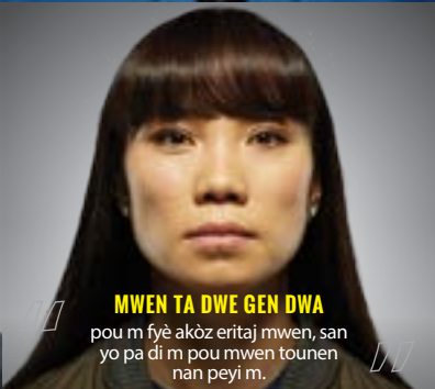
MWEN TA DWE GEN DWA pou m fyè akòz eritaj mwen, san yo pa di m pou mwen tounen nan peyi m.