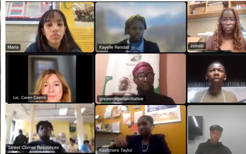
5 th Annual Speak Up, Speak Out Youth Summit An International Youth About Police Misconduct