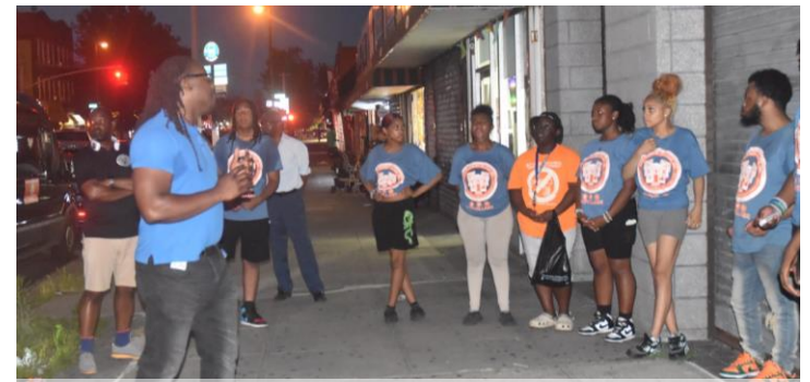
CCRB Block by Block