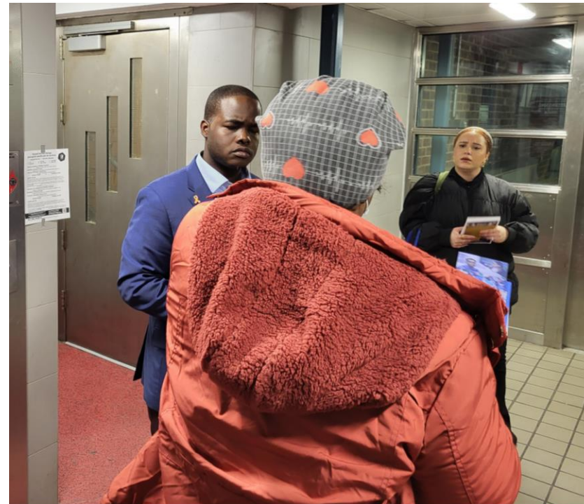
5 th Annual Week of Awareness