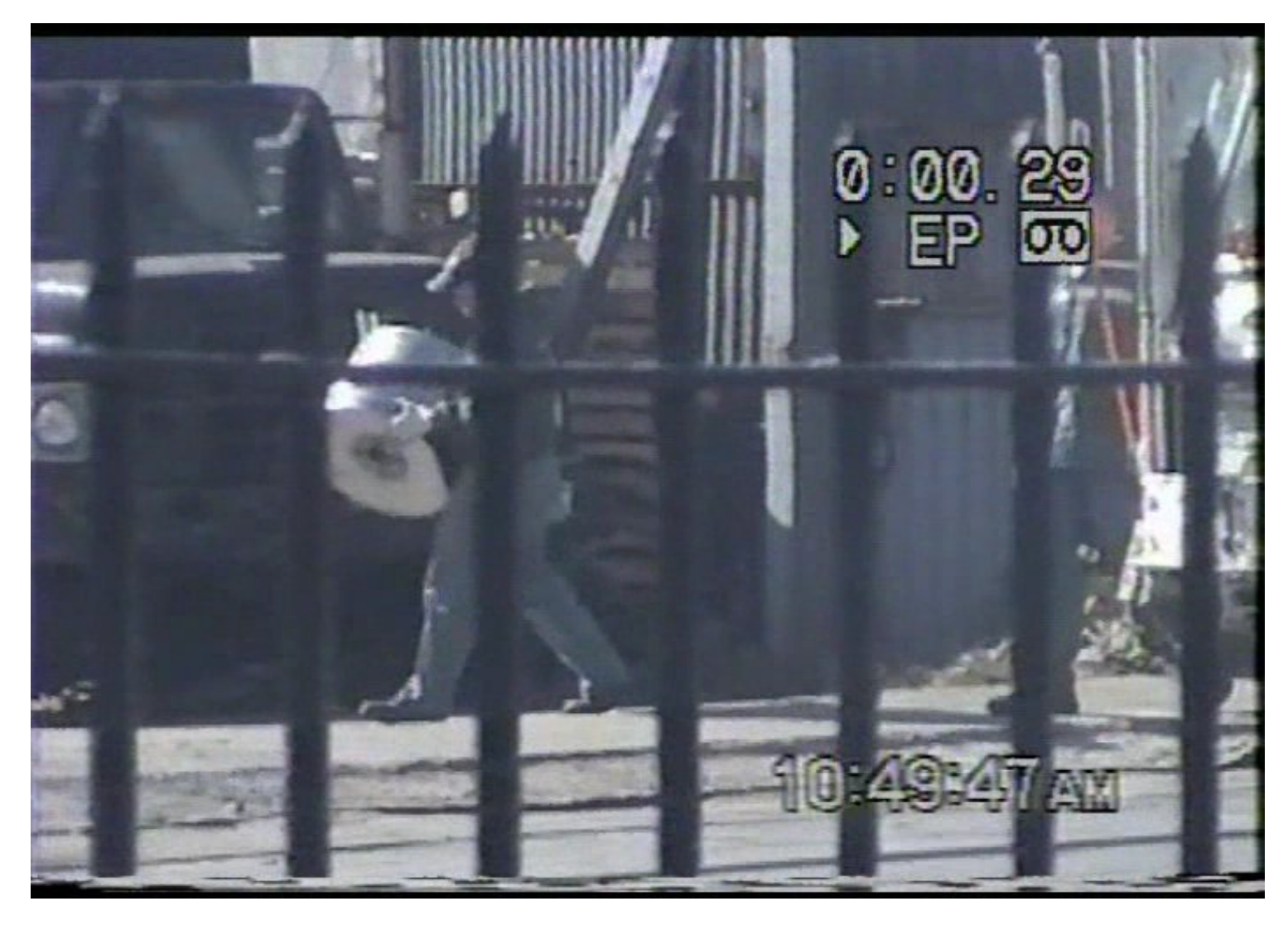
Sanitation Worker enters Pine Scrap Metal carrying recyclable material unloaded from DSNY collection truck.