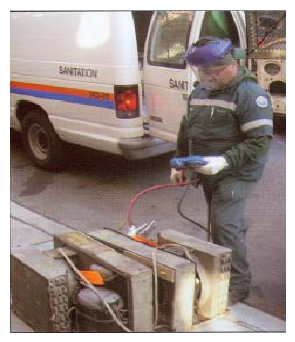
Bright, orange tags are placed on air conditioners in which CFC has been removed, indicating that they are safe for recycling collection.