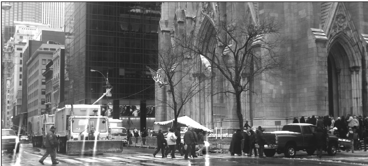
Snow plows along a cleared Fifth Avenue, as the faithful file into St. Patrick's Cathedral

Once again, the city and the world were able to see why when it comes to Sanitation, the Department reigns supreme. I thank all of you for your hard work and dedication to our great city.