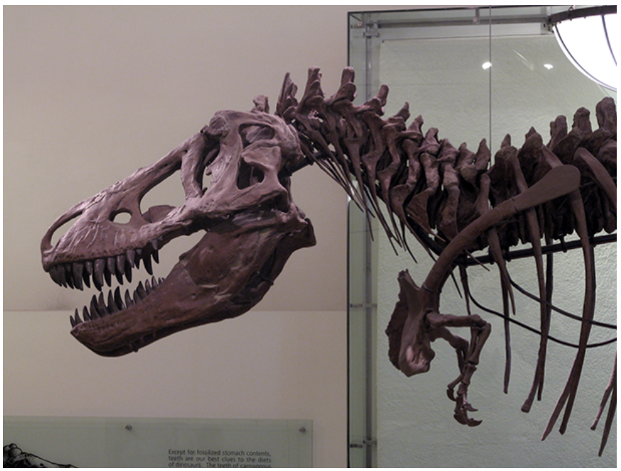
A dinosaur in the Natural History Museum, NYC

The Metropolitan Museum of Art Staten Island Children's Museum New-York Historical Society Whitney Museum of American Art Brooklyn Children's Museum Queens Museum of Art Guggenheim Museum