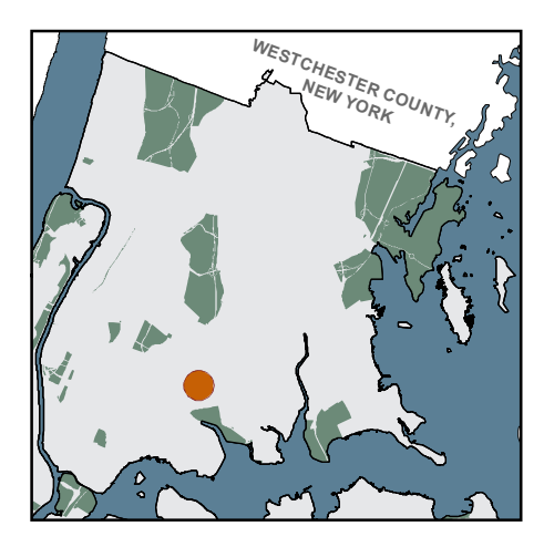
Prepared by: NYCHA Performance Tracking & Analytics Department