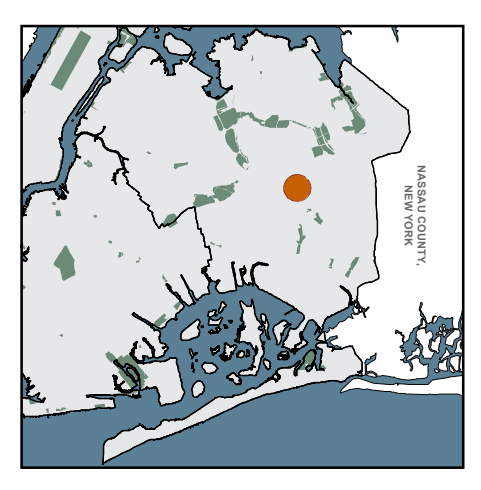
Prepared by: NYCHA Performance Tracking & Analytics Department