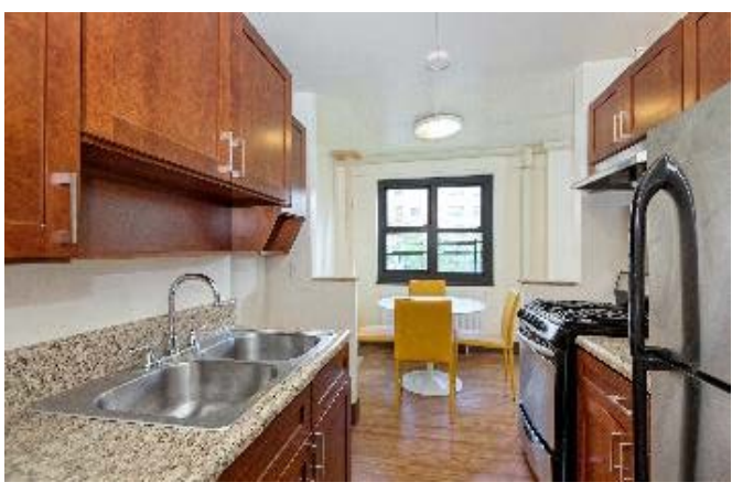
Ocean Bay (Bayside)