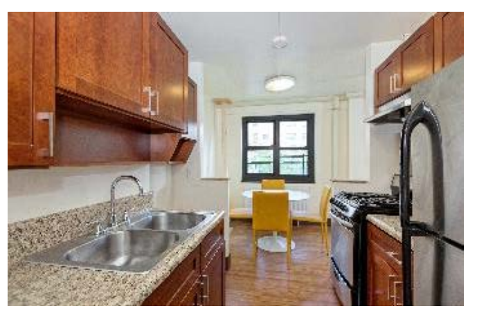
Ocean Bay (Bayside)