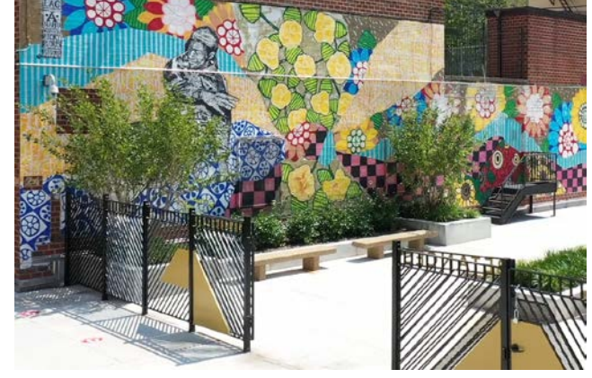
Site improvements at Baychester and Betances