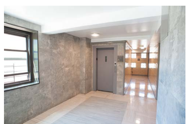
Building improvements at Ocean Bay (Bayside)