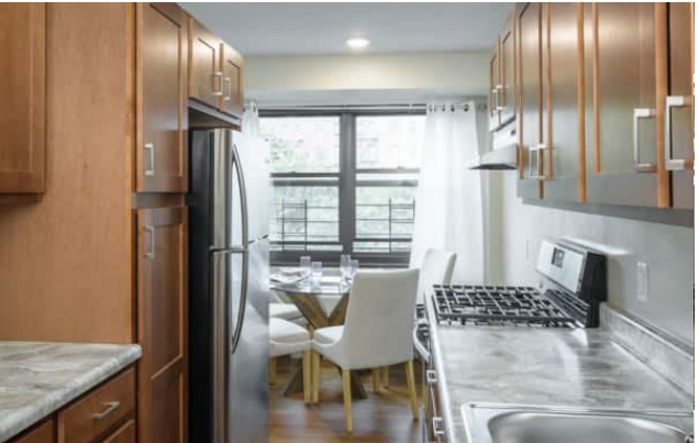
Newly renovated apartments at Twin Parks West