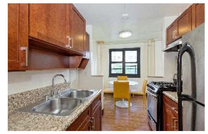
Ocean Bay (Bayside)