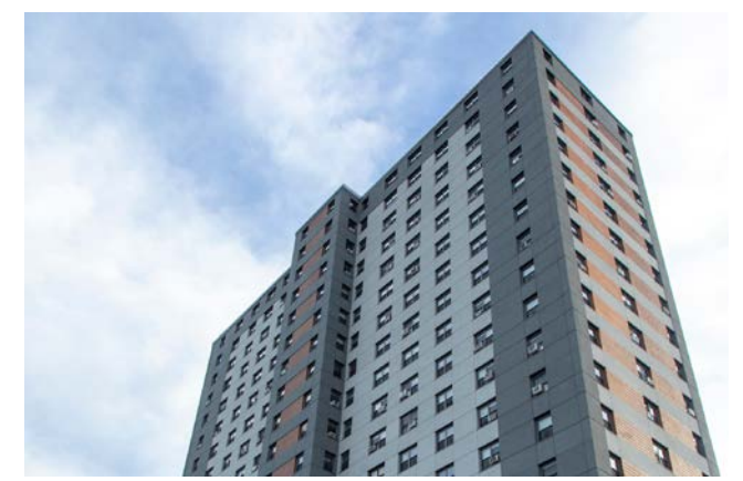
New and improved building systems and facades at Ocean Bay (Bayside) and Murphy