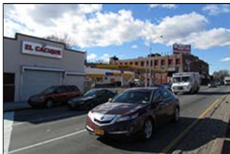
Atlantic Avenue is dominated by low-density auto-related uses such as gas stations.

The side streets between these corridors are generally comprised of low-scale row-houses, semi-detached homes and small apartment buildings interspersed with semi-industrial and open industrial uses.