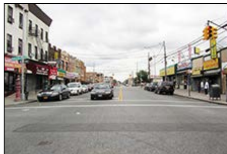
Low-density commercial and residential uses are found on Pitkin Avenue, where the A/C line runs below ground.