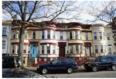
Residential blocks are characterized by two- to three-story rowhouses.