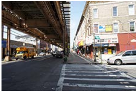
Fulton Street is a local retail corridor with the elevated J/Z train running above ground.