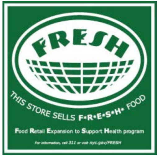
FRESH Sign - Download the proposed FRESH Food Store symbol: in b pdf format

The proposal requires that all stores utilizing the zoning incentives of the program must be certified as a FRESH food store by the Chairperson of the City Planning Commission (CPC). The applicant for the zoning certification must submit site plans demonstrating that the store meets the floor area requirements established in the proposed zoning definition of a FRESH food store. In addition, the applicant must provide a signed lease by a participating grocer, or some other form of a written commitment acceptable by the Chairperson of the CPC, to occupy space developed for the FRESH food store. Additionally, the proposed text would require all certified FRESH food stores to display the FRESH sign at the entrance to the store that indicates that the store is a participant in the FRESH program and that fresh foods are sold inside.