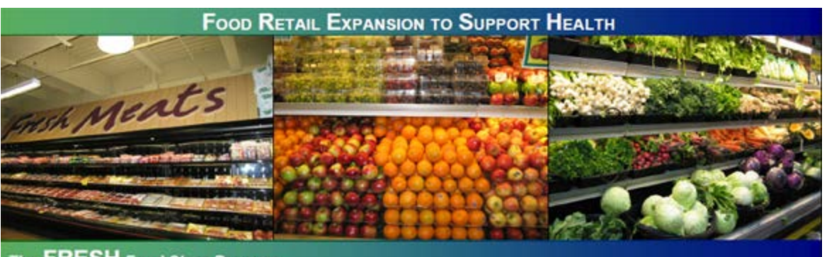
The FRESH Food Store Program

Download the FRESH Food Store symbol: in pdf format.