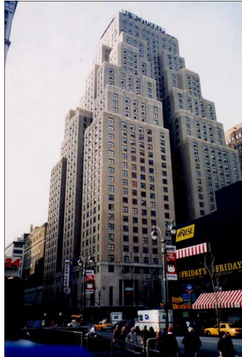
New Yorker Hotel, 481-497 Eighth Avenue. View west on 34th Street 108