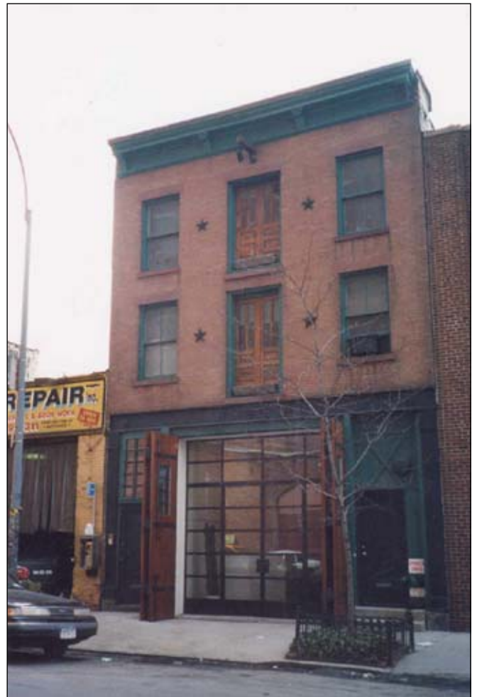
550 West 29th Street. View south 100