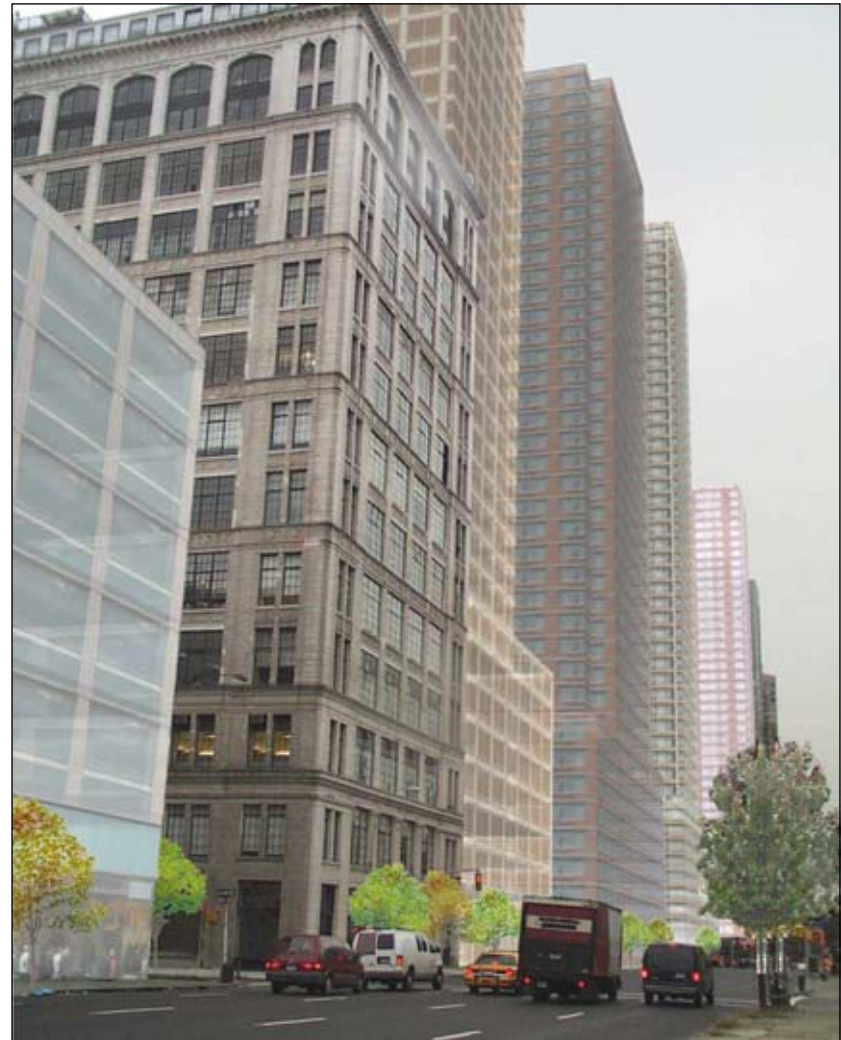
Hill Building (56). Proposed view northwest on Tenth Avenue 114