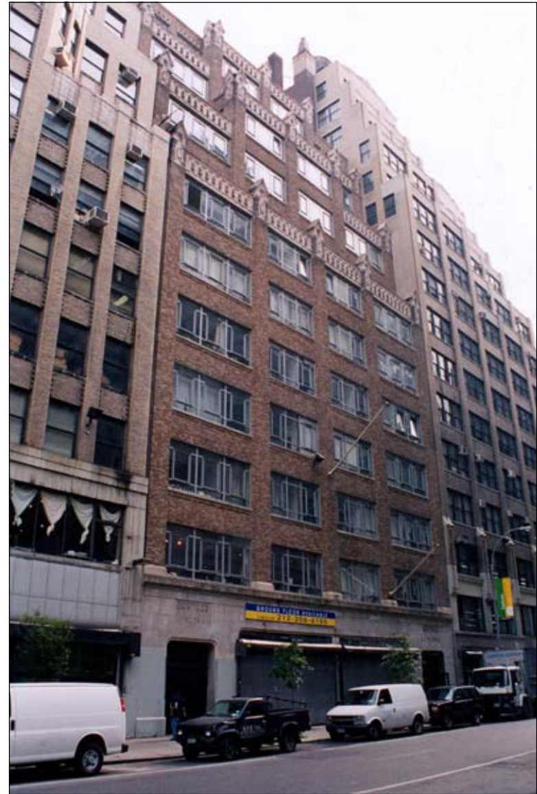
323-327 West 39th Street. View north 41