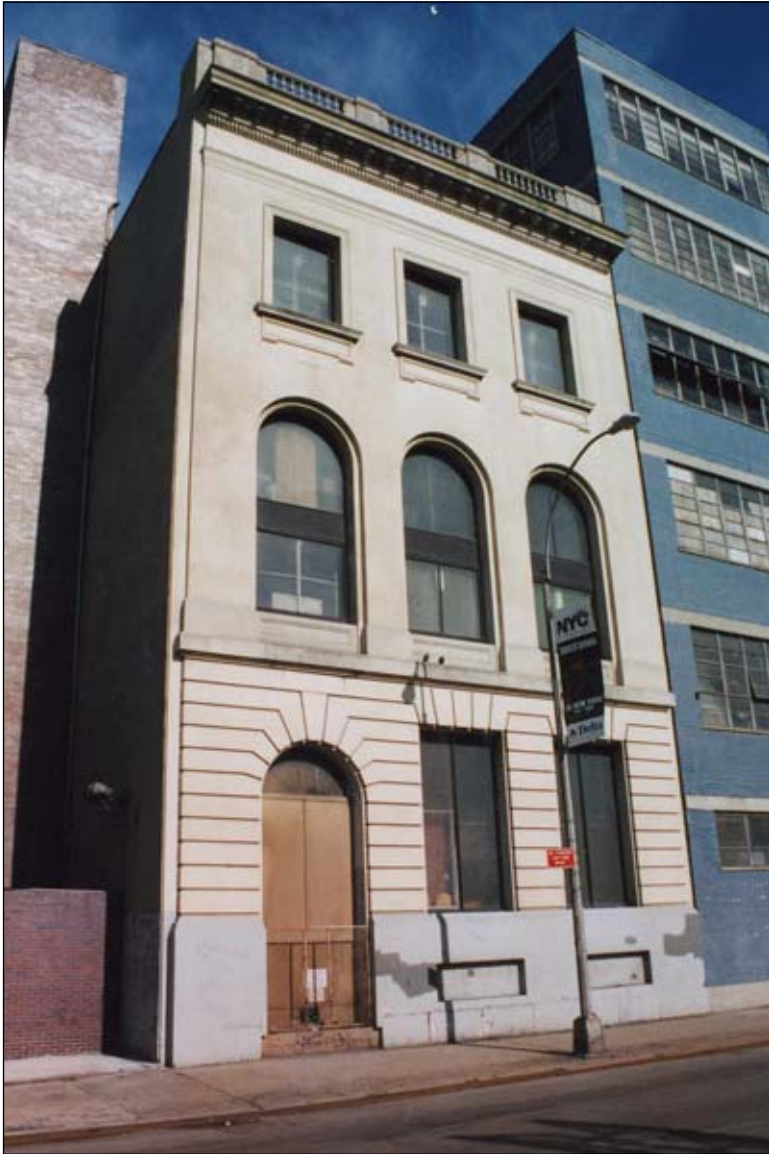
Former New York Public Library West 40th Street Branch, 457 West 40th Street. View north 87