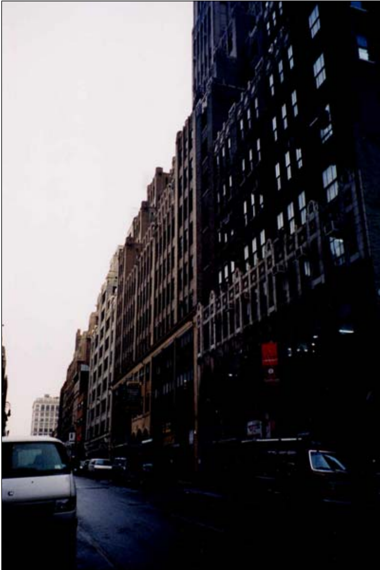
315-325 West 36th Street. View northwest 44