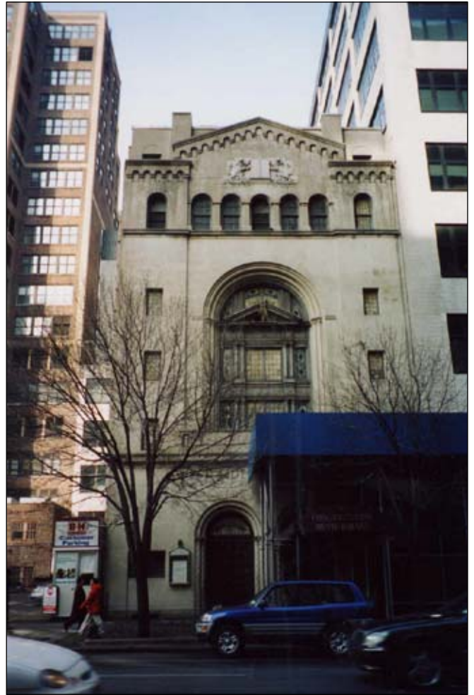
West Side Jewish Center, 347 West 34th Street. View north 84