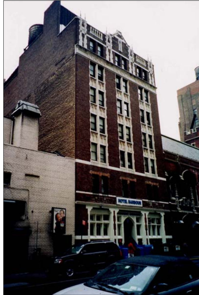
Former Barbour Dormitory, 330 West 36th Street 75