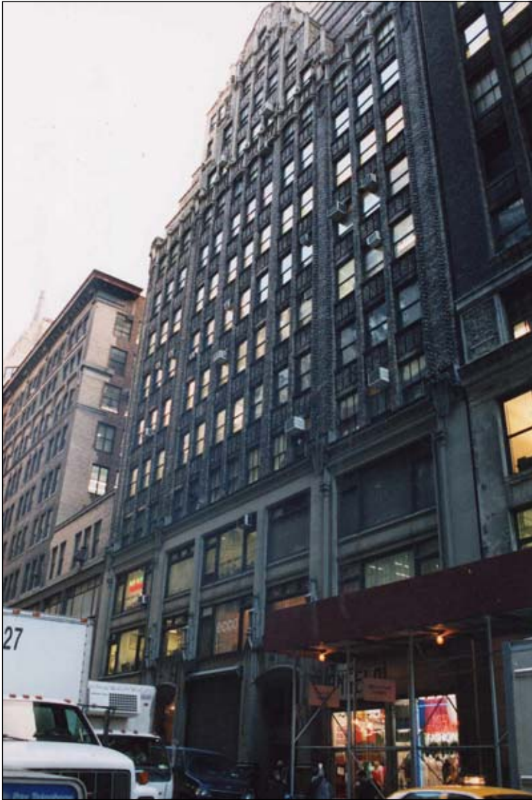
Shampan Building, 252-258 West 37th Street. View southeast 42