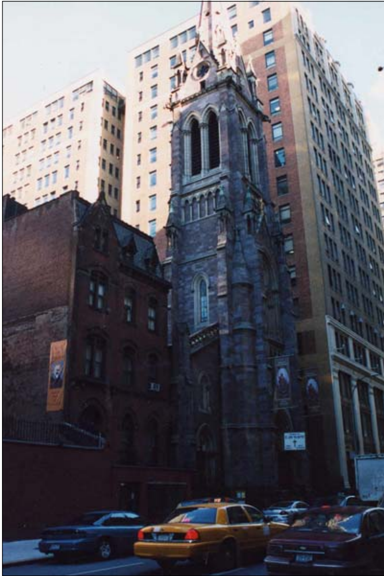
St. John the Baptist Roman Catholic Church, 207-215 West 30th Street. View northeast 6a