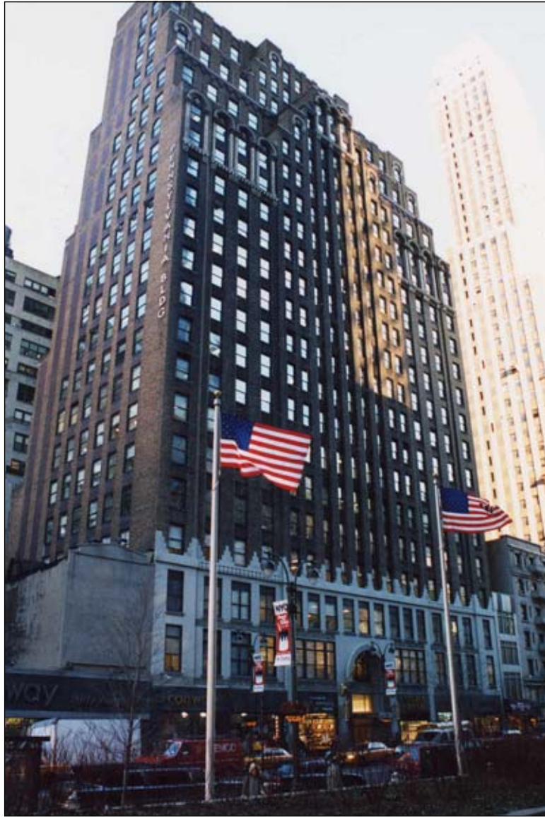
Pennsylvania Building, 225 West 34th Street. View northeast 109