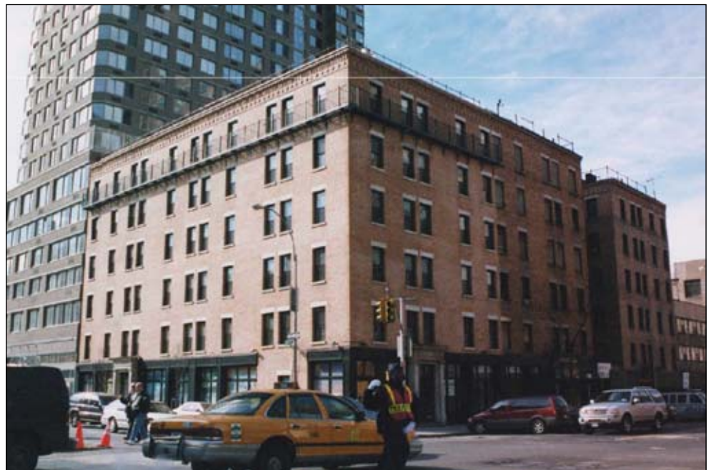
Model Tenements, 500, 502, and 506 West 42nd Street. View southwest 72