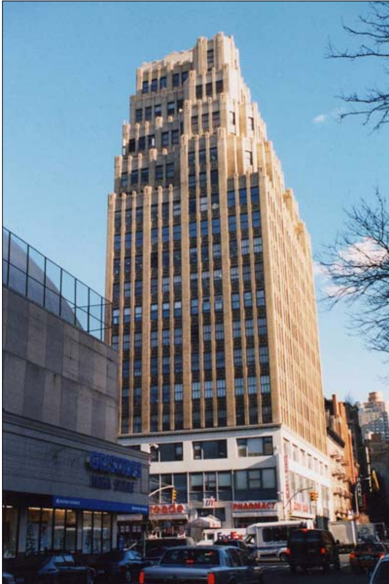
322-326 Eighth Avenue. View east 36