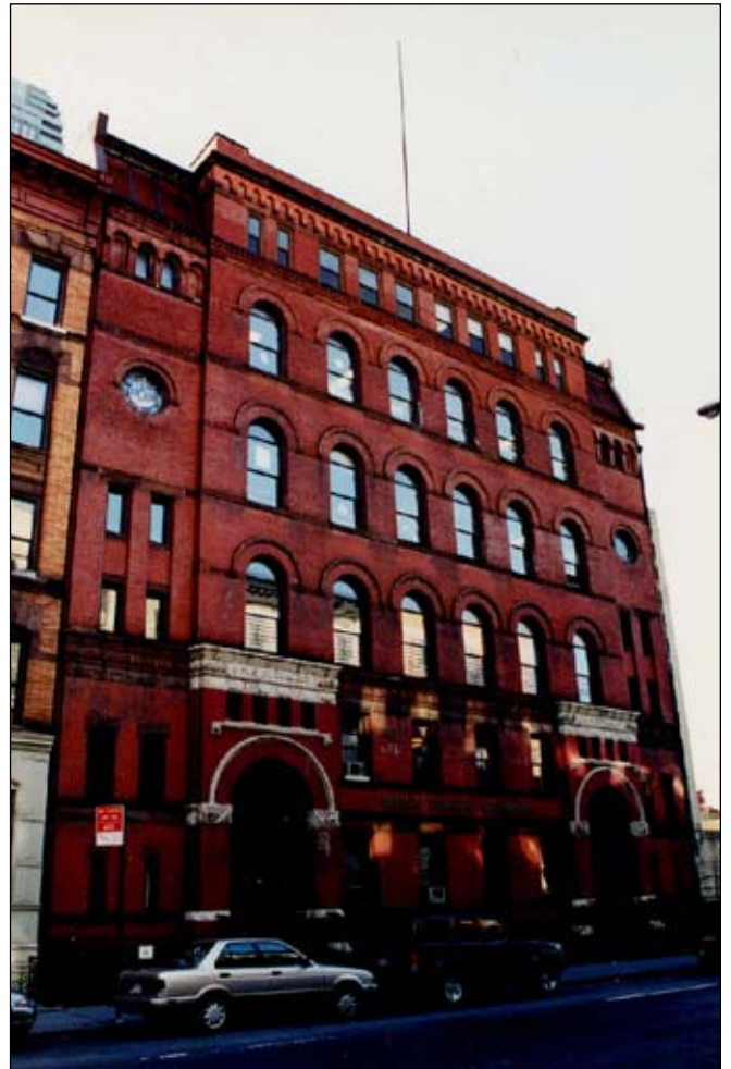
Holy Cross Roman Catholic Church School, 334 West 43rd Street 9b