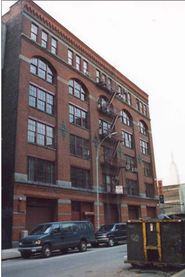
Former Berlin & Jones Envelope Company, 547-553 West 27th Street. View northeast 101