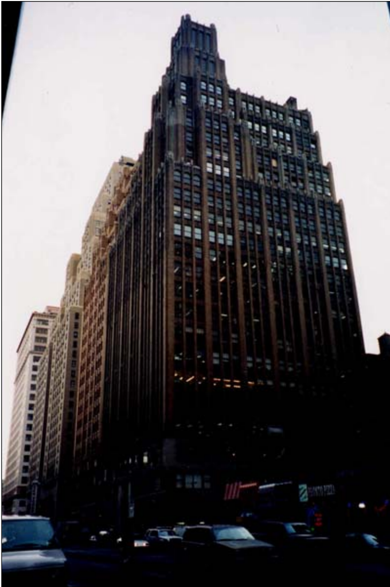
509-519 Eighth Avenue. View southwest 34