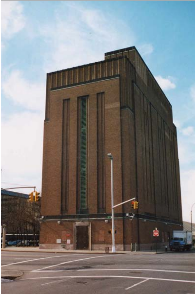
Lincoln Tunnel Ventilation Building (19B), 491 Eleventh Avenue. View west. 19c