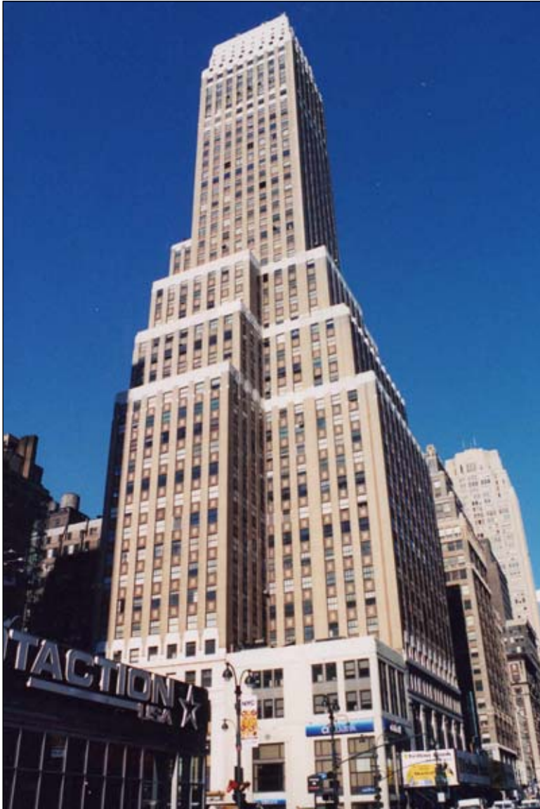
Nelson Tower, 446-456 Seventh Avenue. View north 54