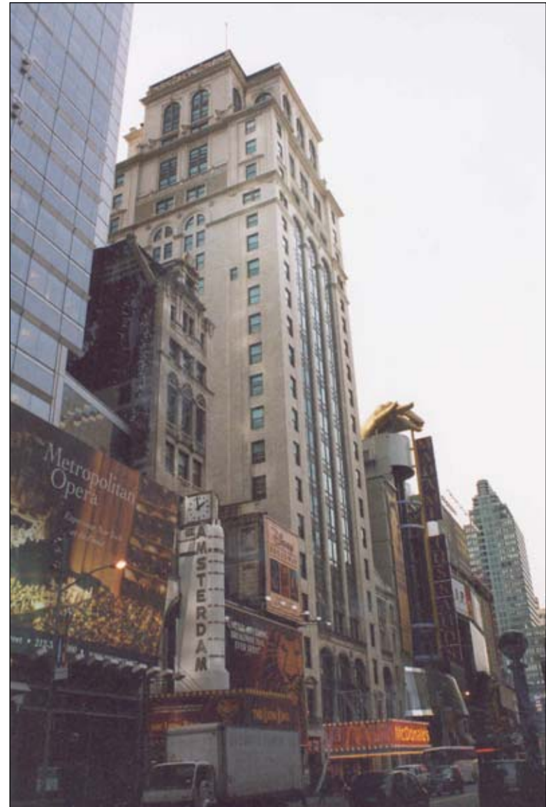
Candler Building, 220 West 42nd Street. 5 View west on West 42nd Street