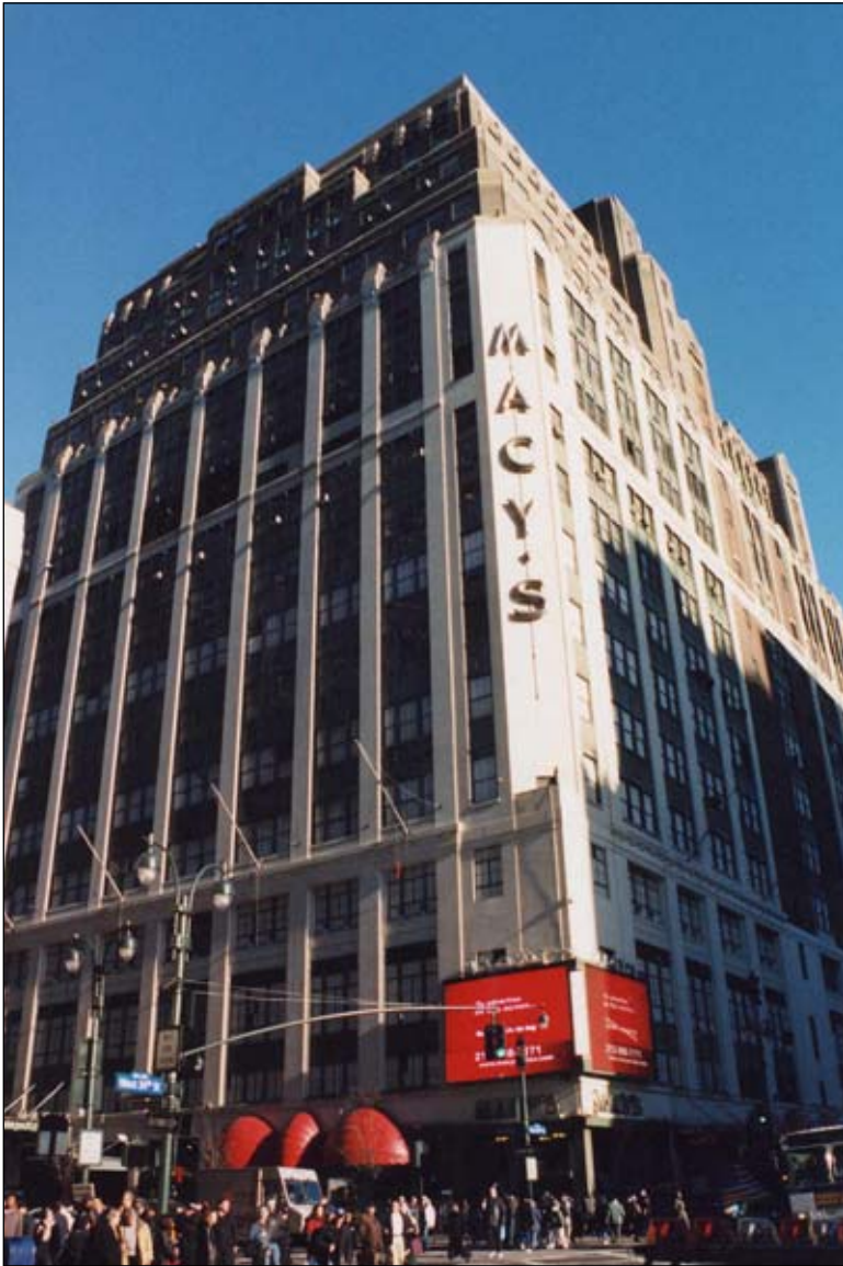
Macy's Seventh Avenue facade, view northeast 2a