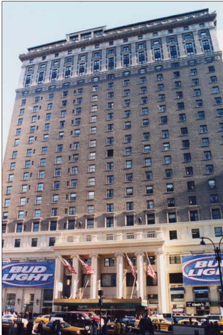
Hotel Pennsylvania, 401 Seventh Avenue. View east 105