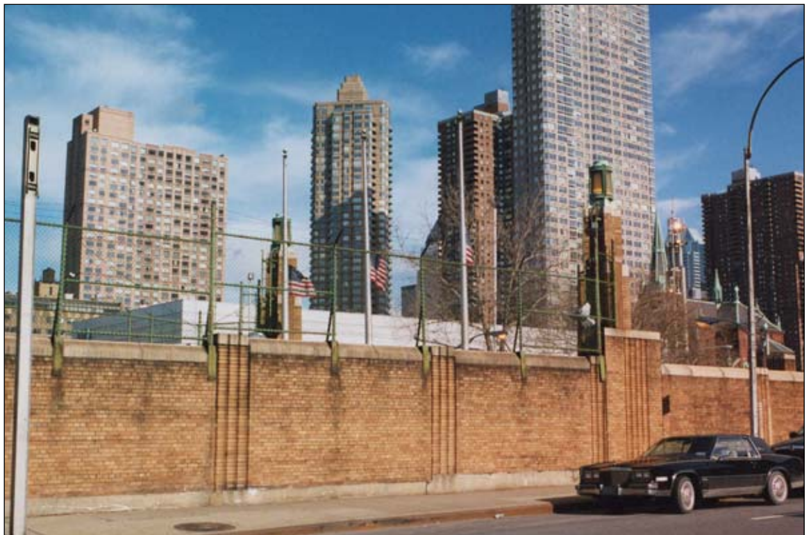
Lincoln Tunnel entrance (19A). View north of wall along West 39th Street 19b