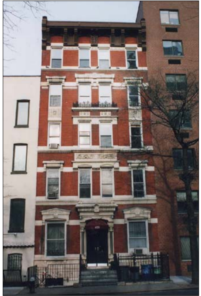
435 West 43rd Street. View north 71