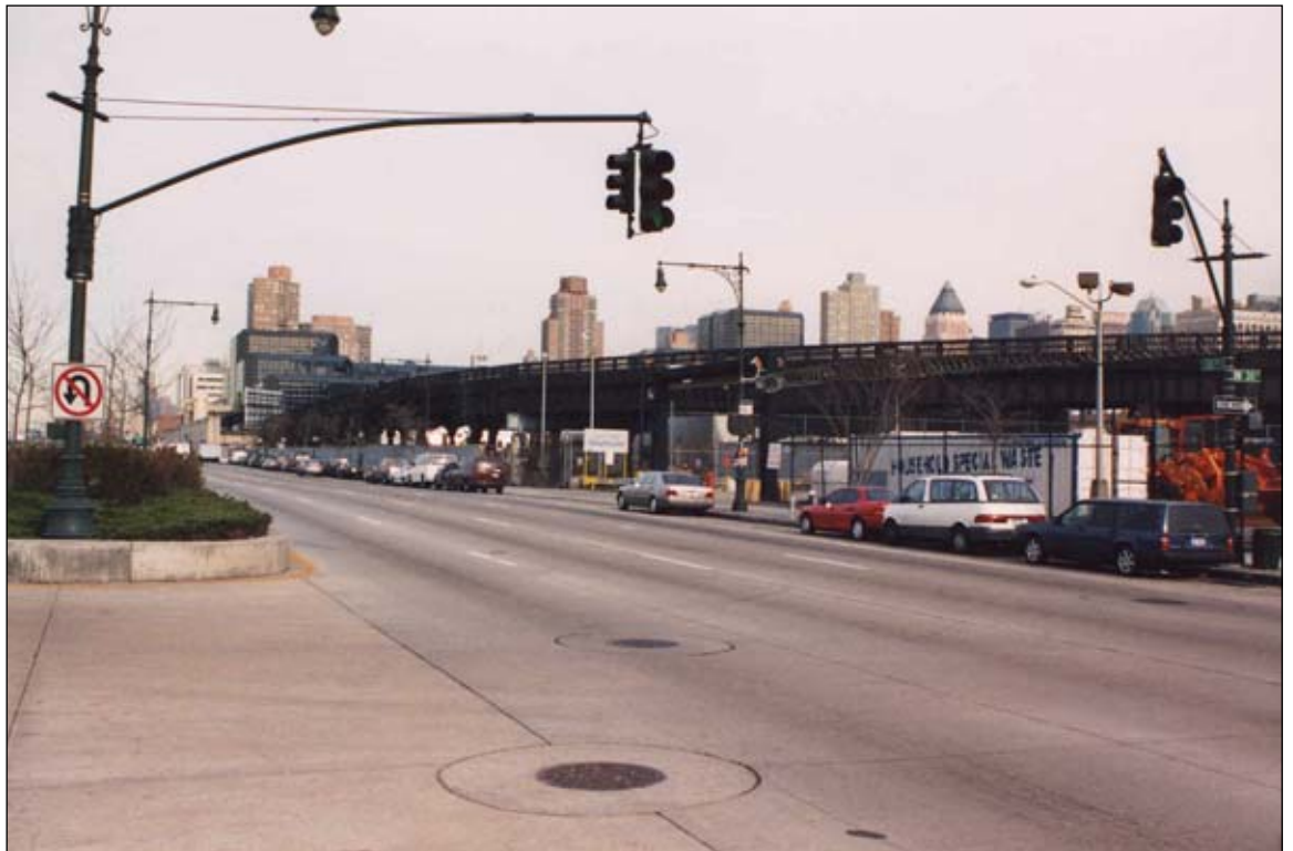
Viaduct along Twelfth Avenue. View north on Twelfth Avenue from West 30th Street 27h