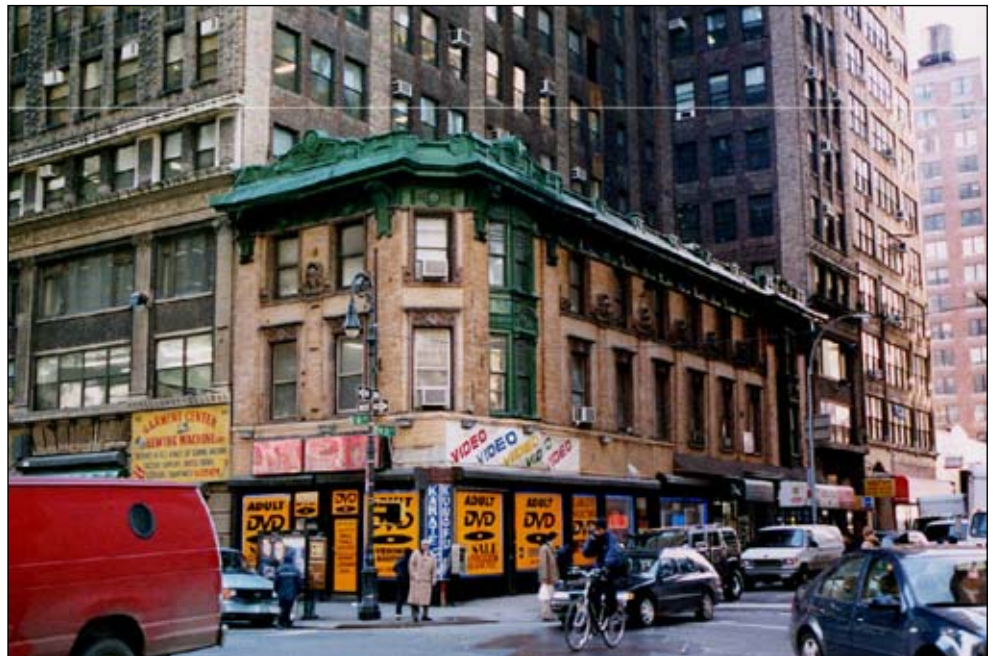
Commercial building, 300 West 38th Street. View southwest 11