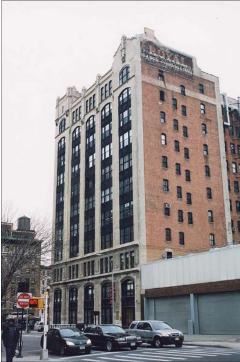
Zinn Building, 210 Eleventh Avenue. View northeast 58