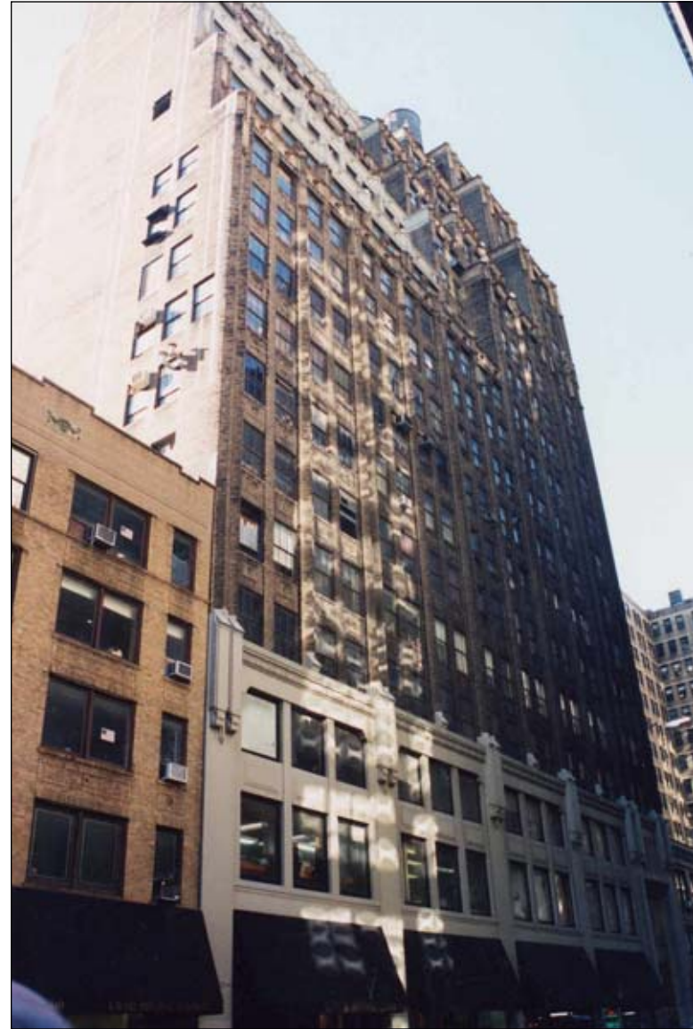
144-154 West 30th Street. View southwest 45