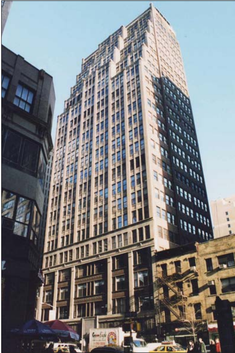
345-353 Seventh Avenue. View northeast 28