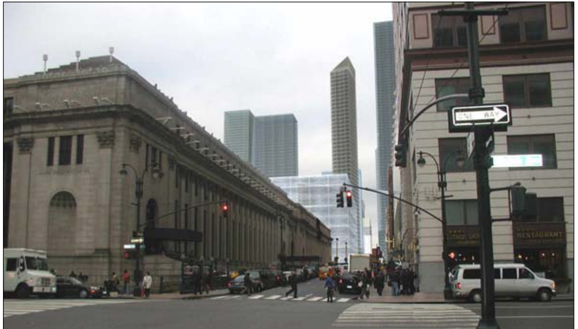
Farley Building (12). Proposed view west on 33rd Street 112