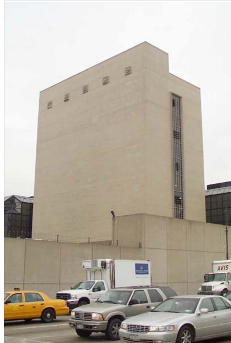
1950's Lincoln Tunnel Ventilation Building (19C). View southeast 19d