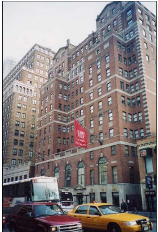
William F. Sloan Memorial YMCA, 360 West 34th Street. View south 79