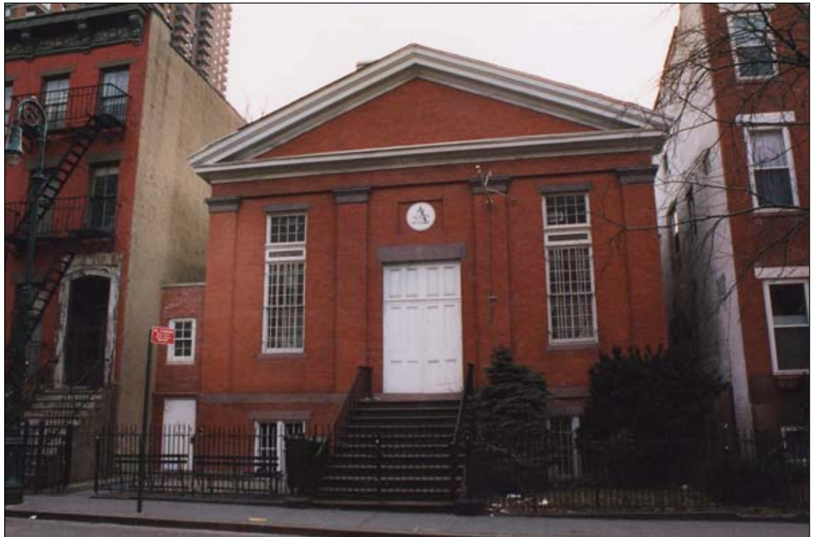
Actor's Studio, 432 West 44th Street 16