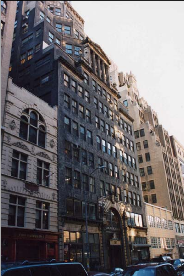
Fur Craft Building, 242-246 West 30th Street. View southwest 46