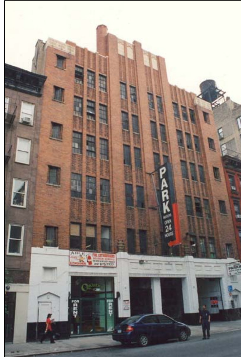
241-245 West 26th Street. View north 102