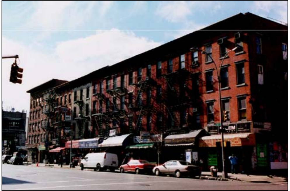
523-539 Ninth Avenue. View southwest 65