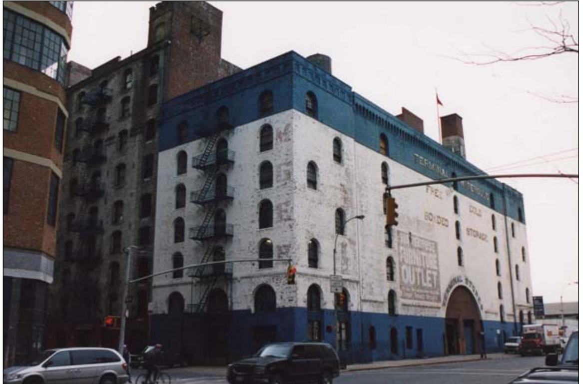
New York Terminal Warehouse Company. Eleventh Avenue facade, view north 23a