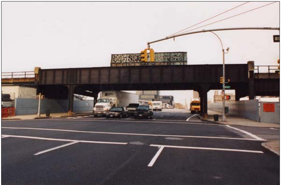
Trestle over Eleventh Avenue. View north 27f