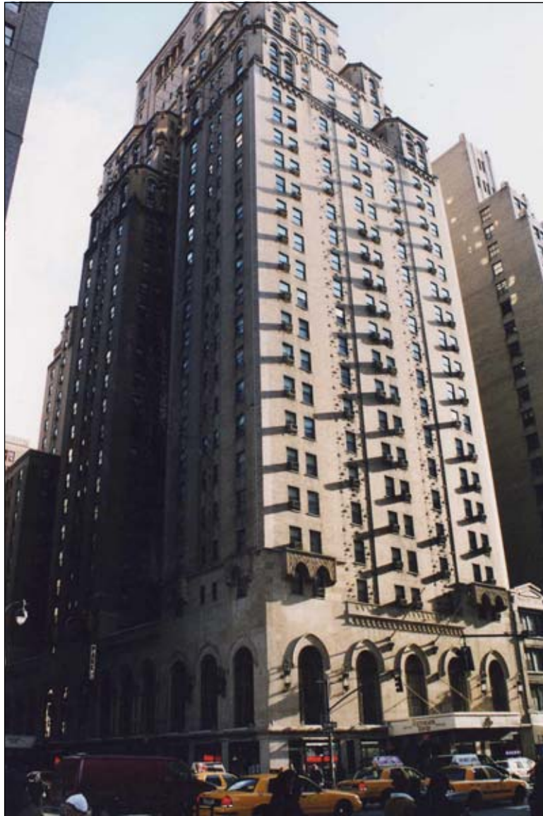
Former Governor Clinton Hotel, 371-377 Seventh Avenue. 107 View southeast