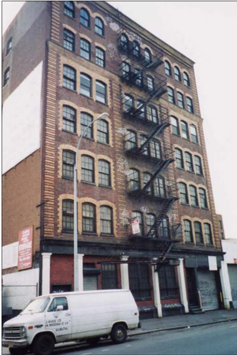
Former Hess Brothers Confectionery Factory, 502-504 97 West 30th Street. View southwest