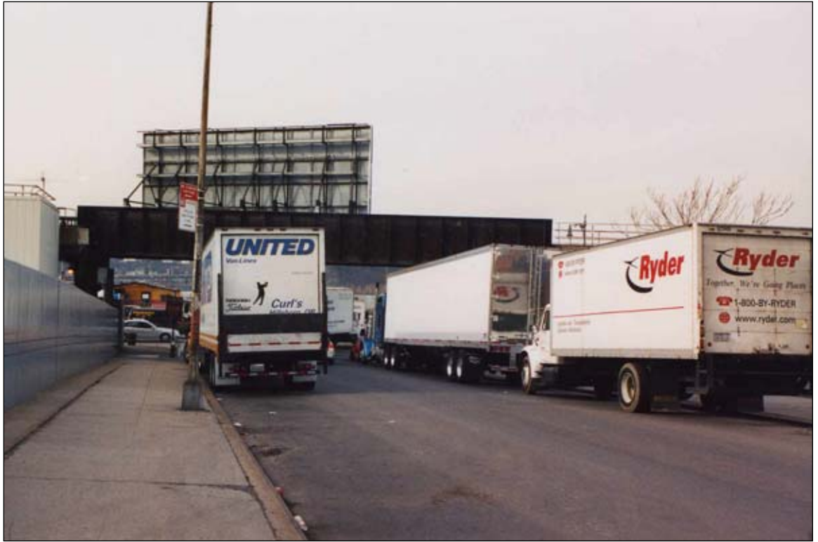
West 33rd Street trestle. View west 27i