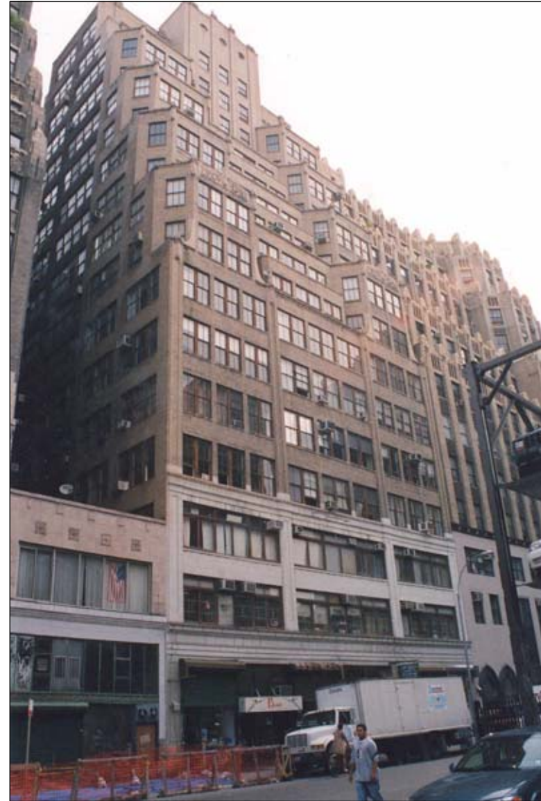
241-245 West 29th Street. View northeast 49