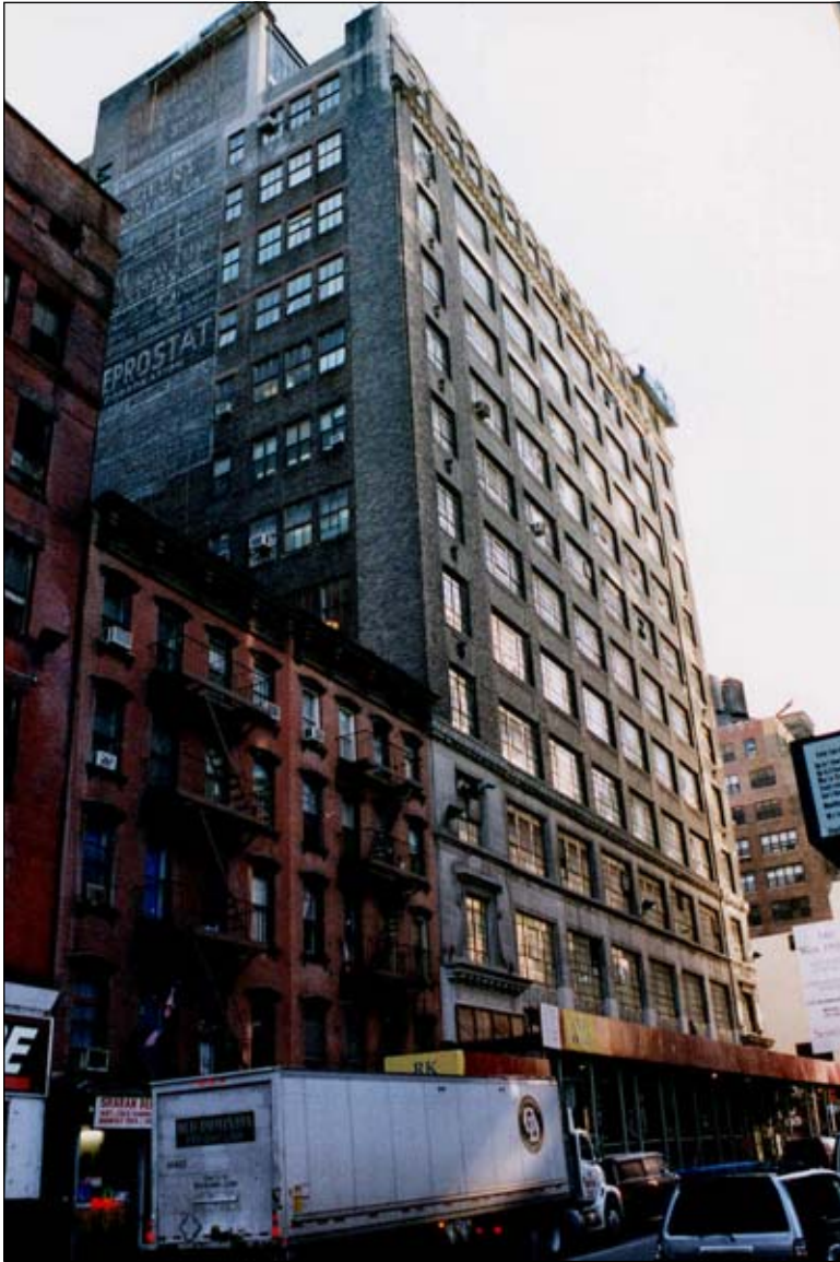
Finck Building, 316-326 West 39th Street. View southwest 60