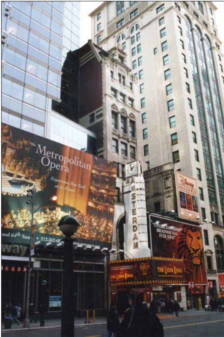
New Amsterdam Theater, 214 West 42nd Street. 4 View southwest on West 42nd Street