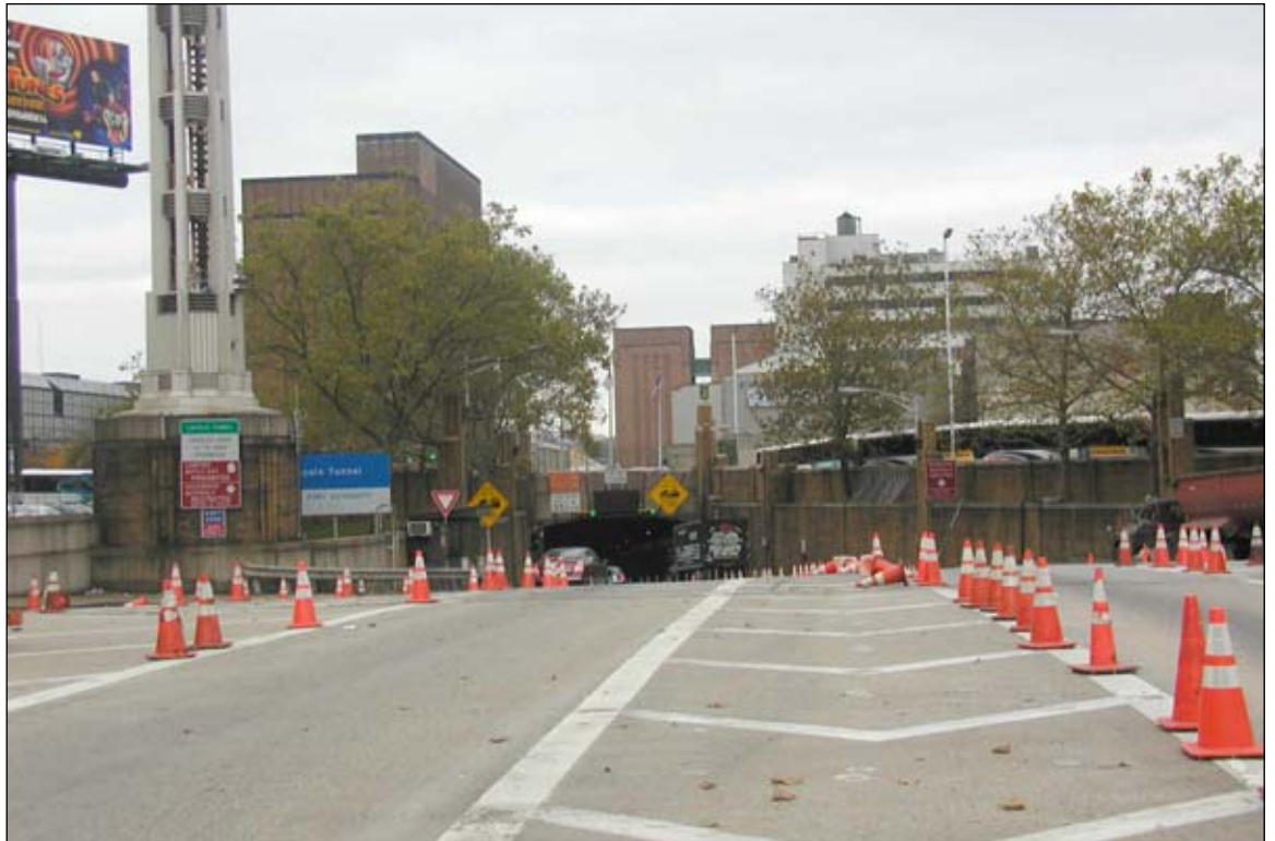
Lincoln Tunnel Entrance (19A). View west 19a