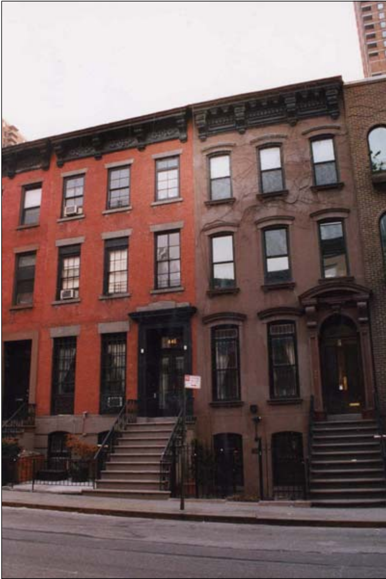
446-448 West 44th Street. View south 67