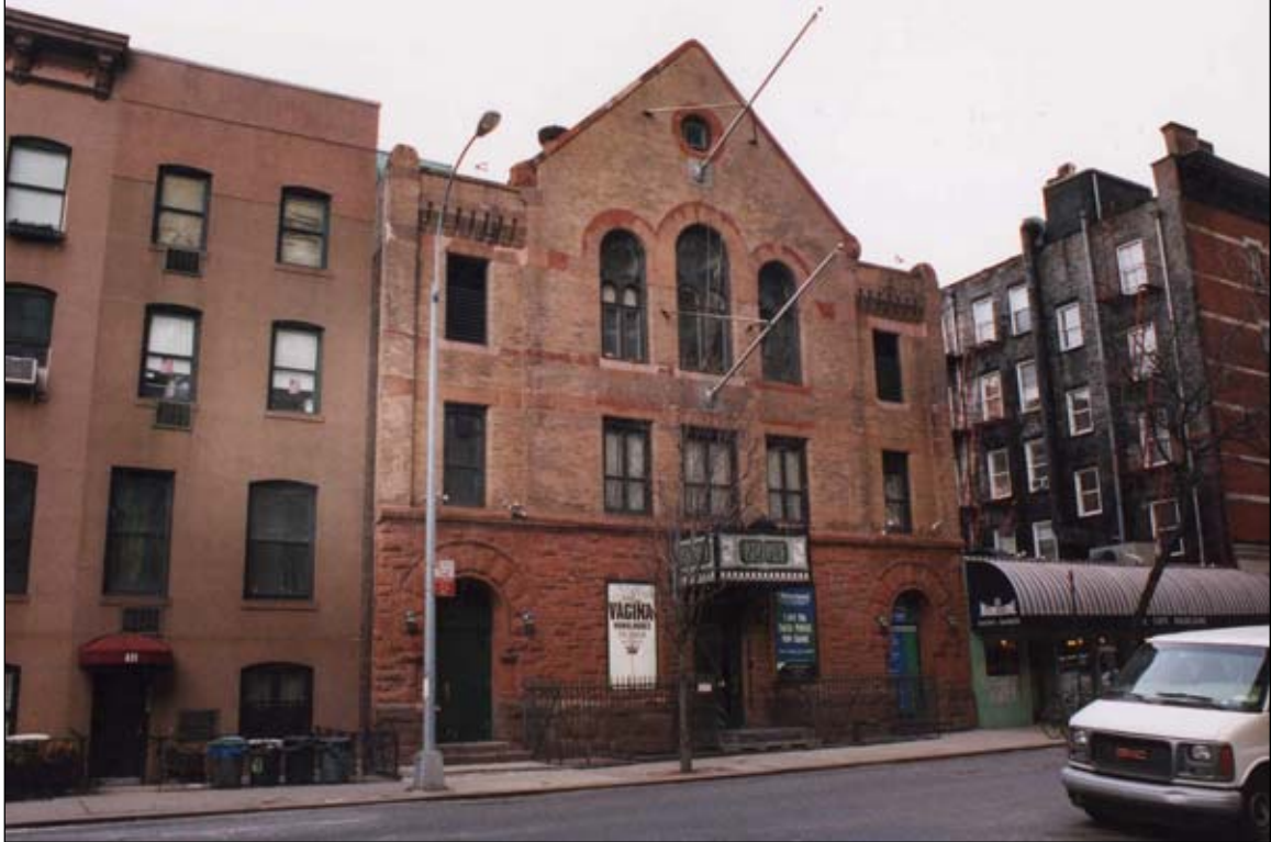
Former Second German Baptist Church, 407 West 43rd Street. View north 81