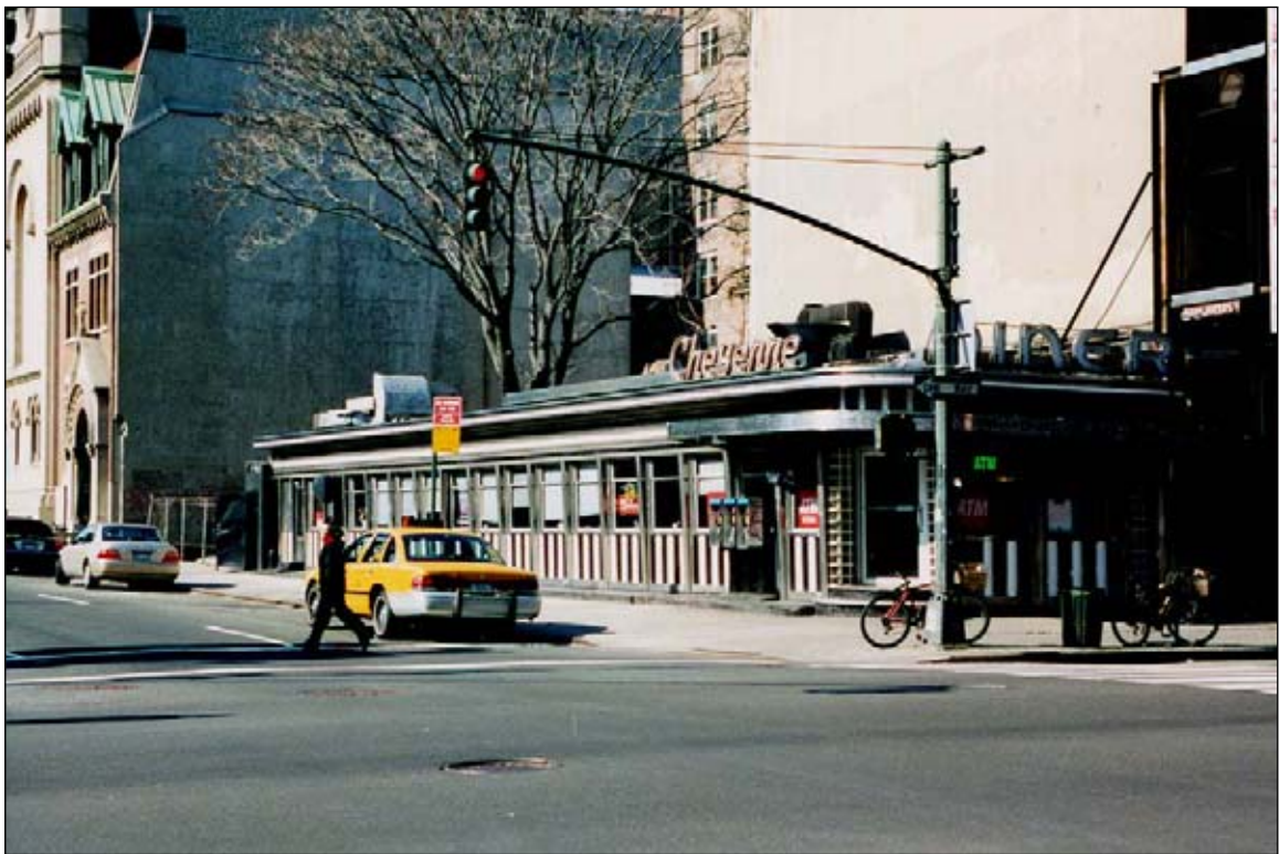
Cheyenne Diner, 411 Ninth Avenue. View west 96