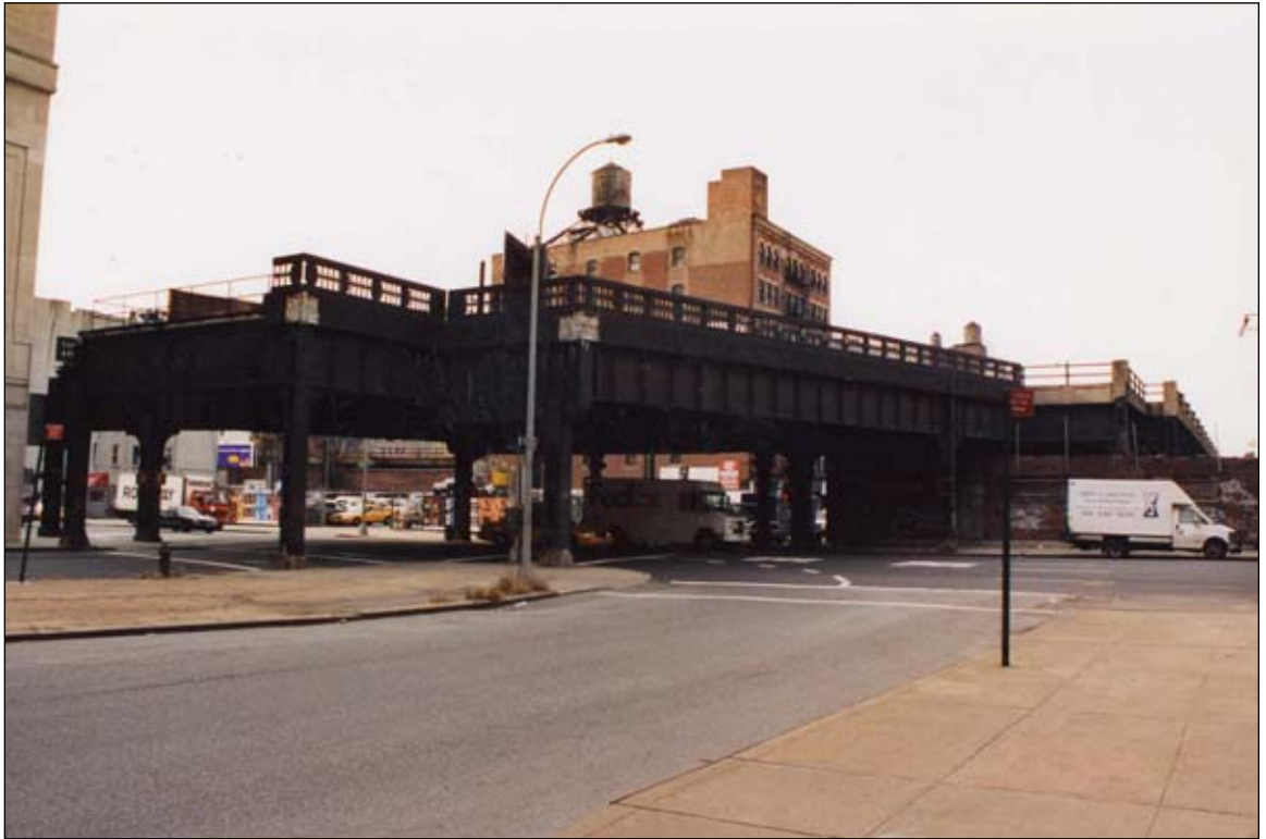
Rail spur platform over Tenth Avenue at West 30th Street. View southwest on West 30th Street 27c