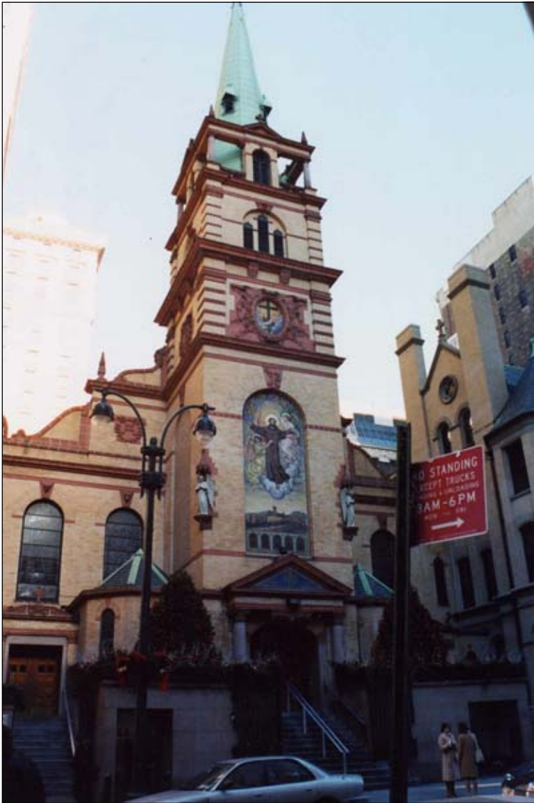
St. Francis Roman Catholic Church Complex, 129-143 West 31st Street. View north 3a