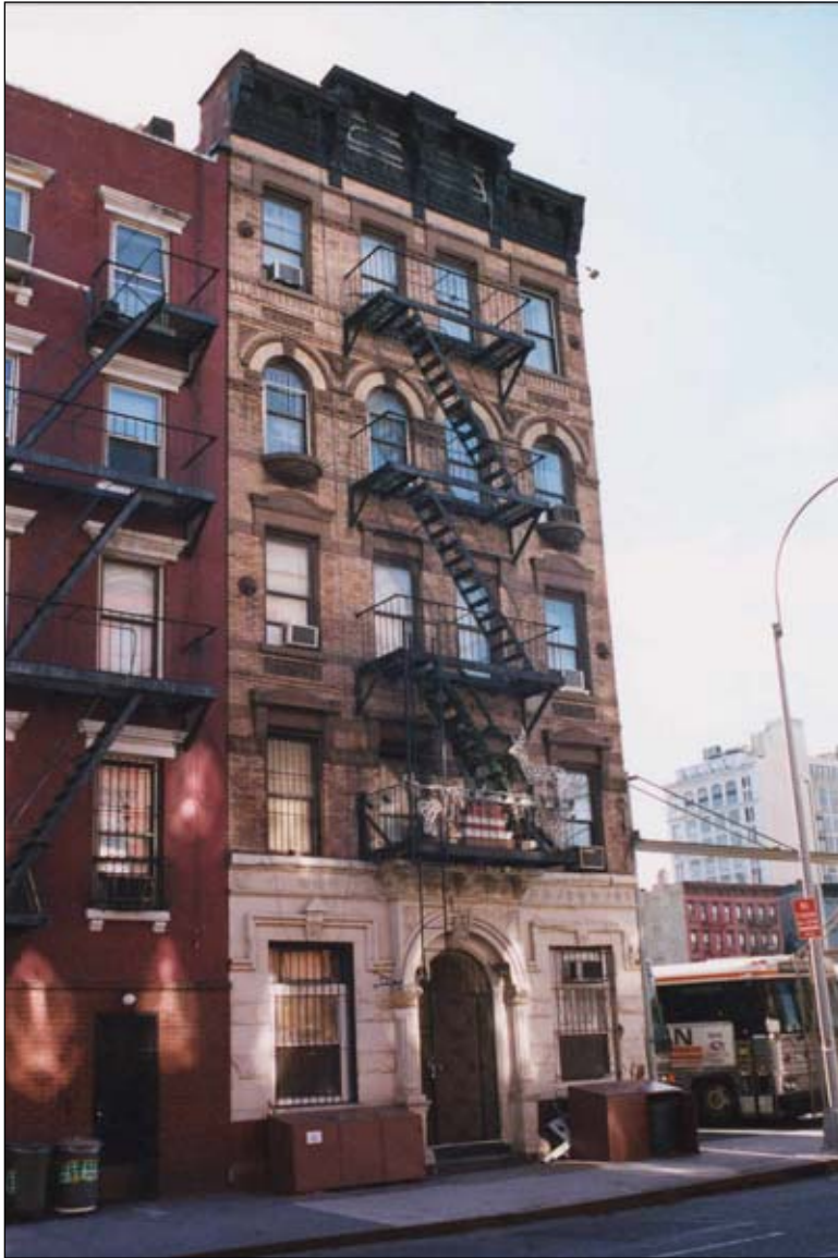
408 West 39th Street. View south 74