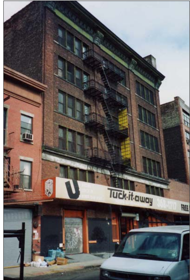
Former Charles P. Rodgers and Co. Building, 517-523 98 West 29th Street. View north