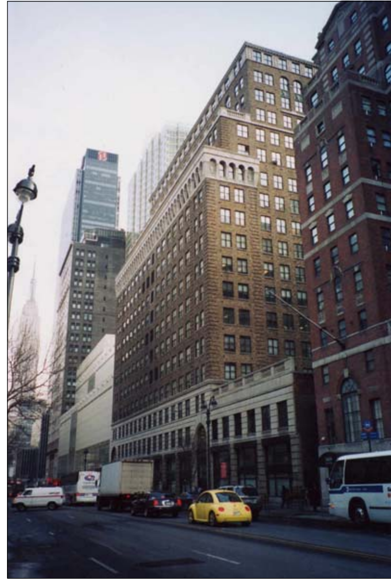
Former J.C. Penney Building, 330 West 34th Street, View southeast 110