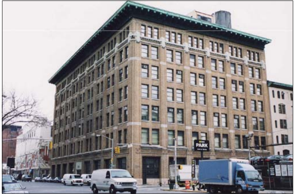
Former Otis Elevator Company, 246-260 Eleventh Avenue. View north 89