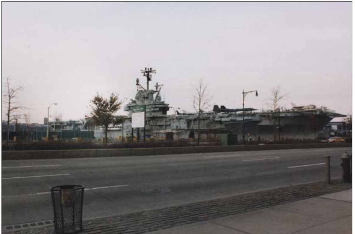
U.S.S. Intrepid. View northwest on Twelfth Avenue 20