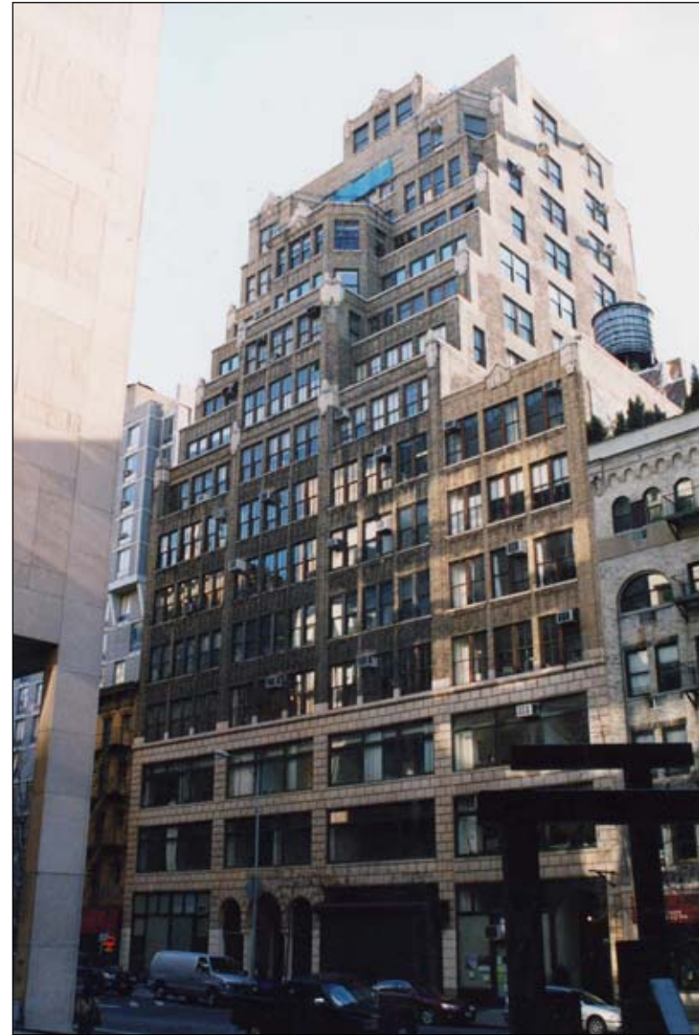
Fur Art Building, 236-240 West 27th Street. View southeast 53