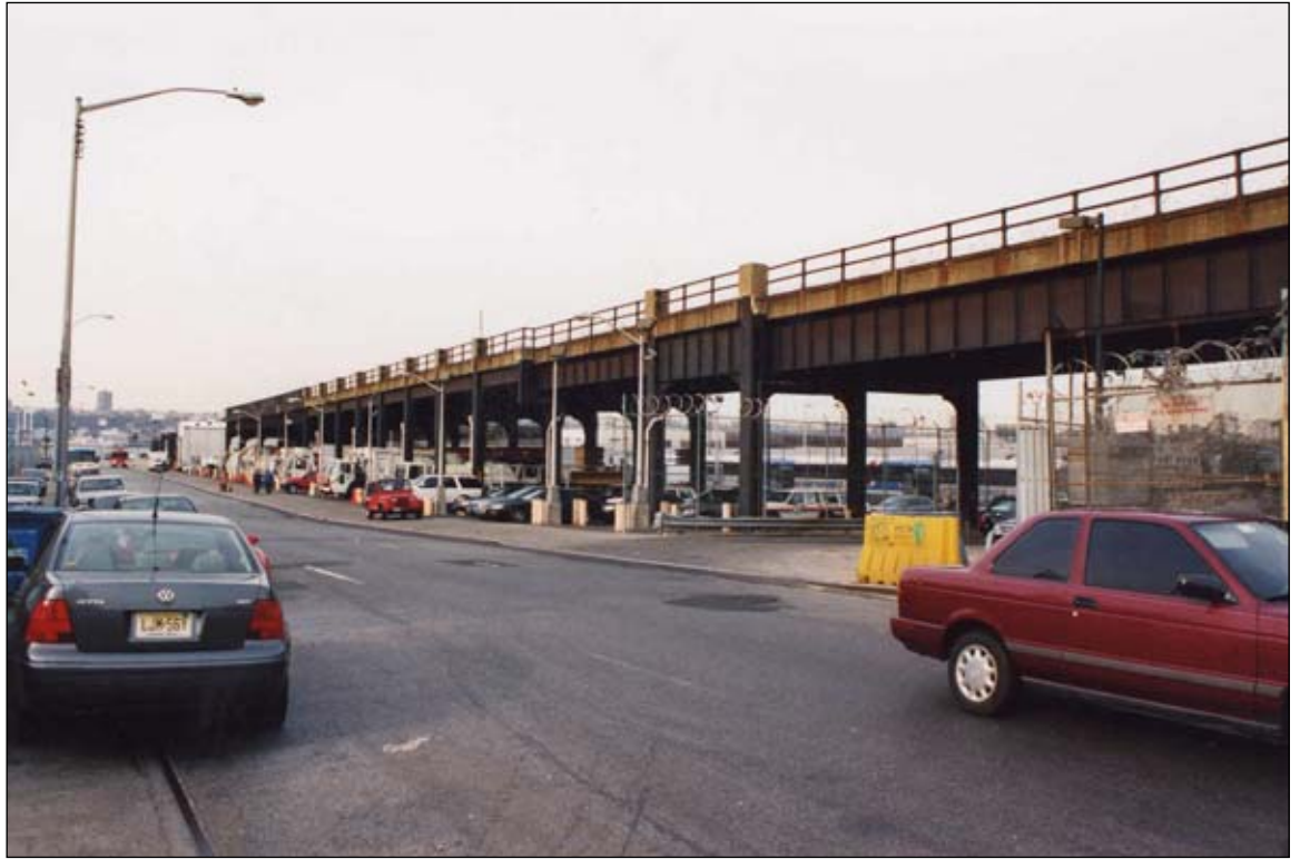
West 30th Street viaduct, View west towards Twelfth Avenue 27g