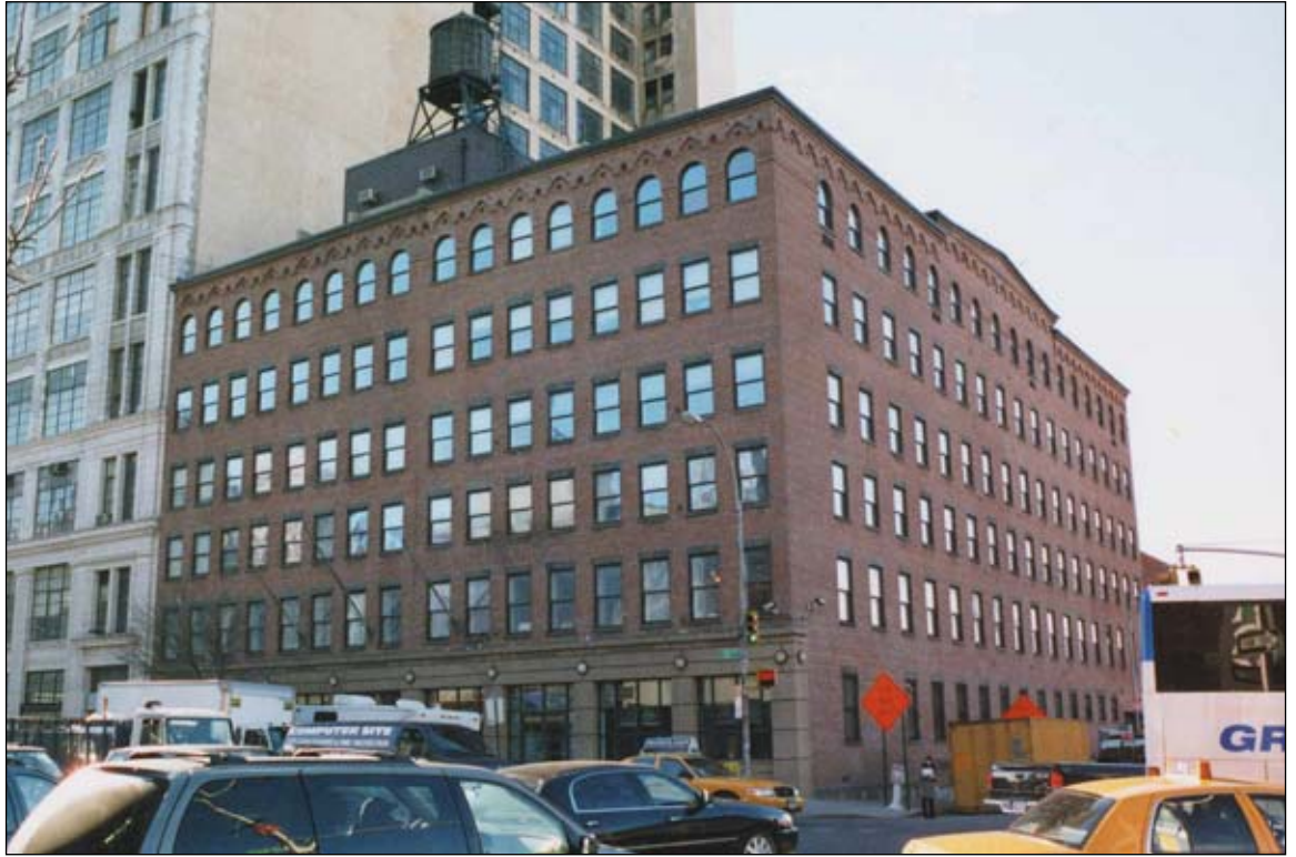
500 West 37th Street. View southwest from Tenth Avenue 93