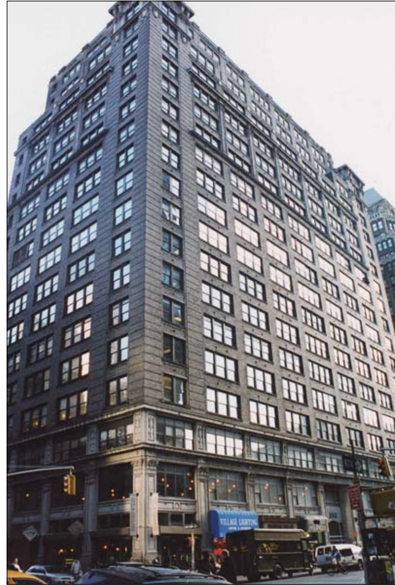
Seventh Avenue Building, 323-335 Seventh Avenue. View southeast 29