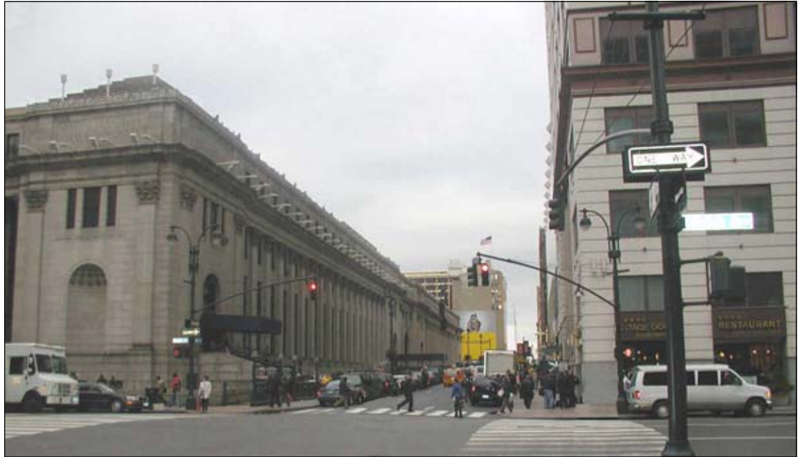
Farley Building (12). Existing view west on 33rd Street 111