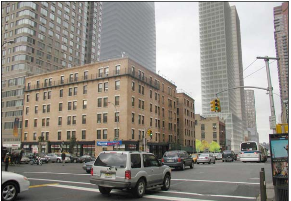
Model Tenements (72). Proposed view west on 42nd Street 116