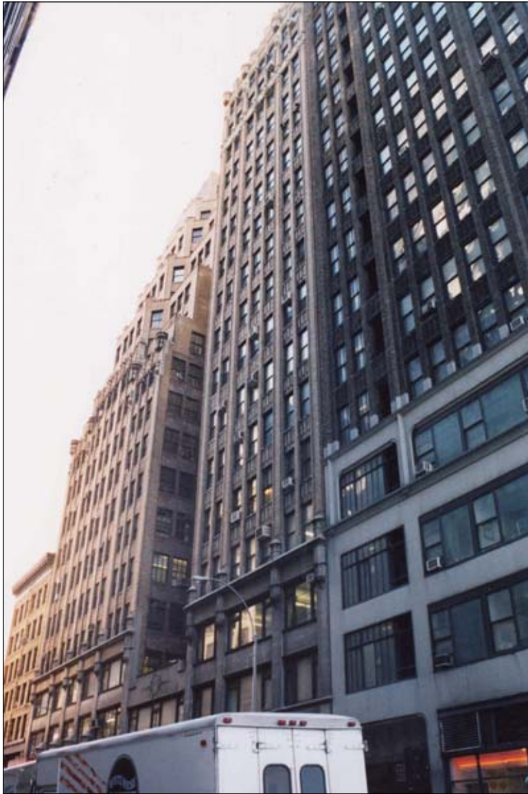
Fur Towers, 156-160 West 28th Street. View southeast 52