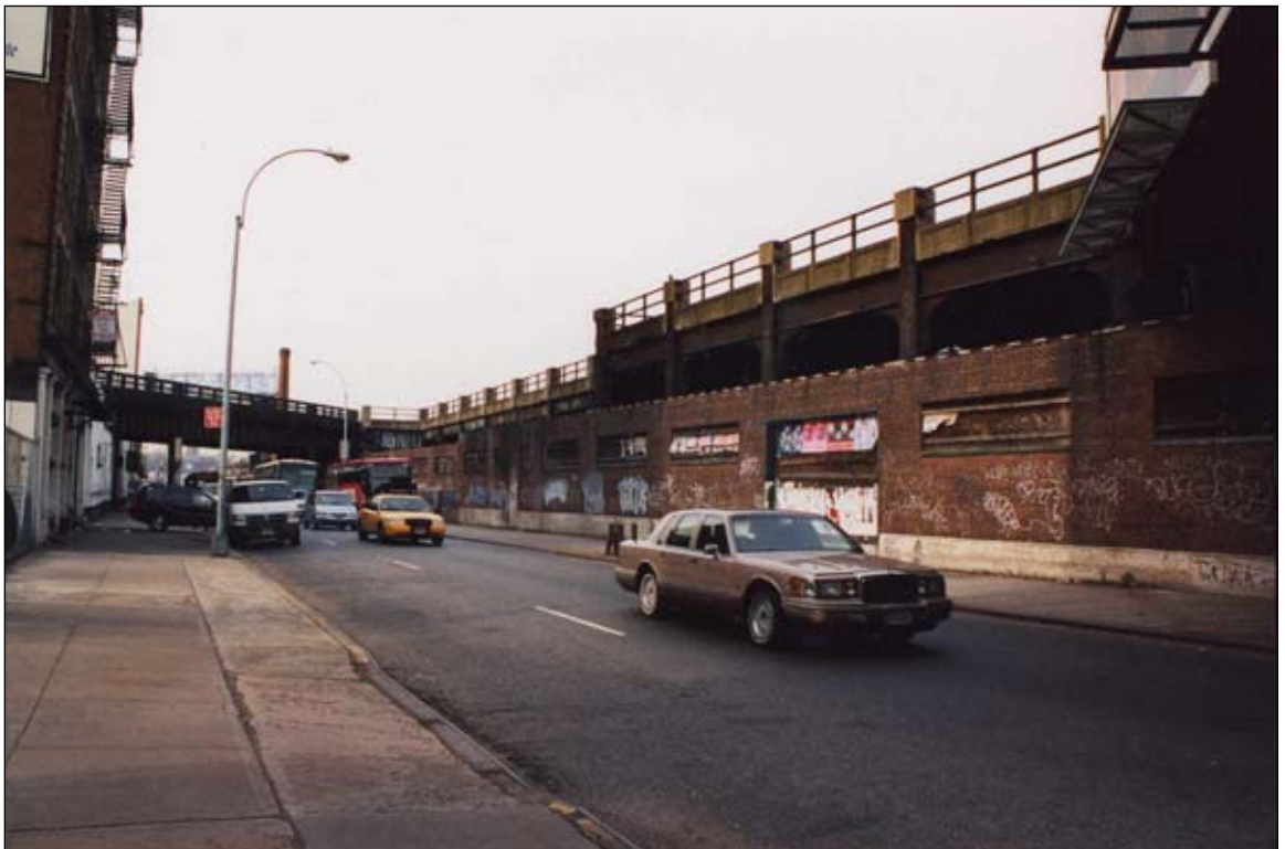
Rail spur along West 30th Street and trestle over West 30th Street. View west 27d