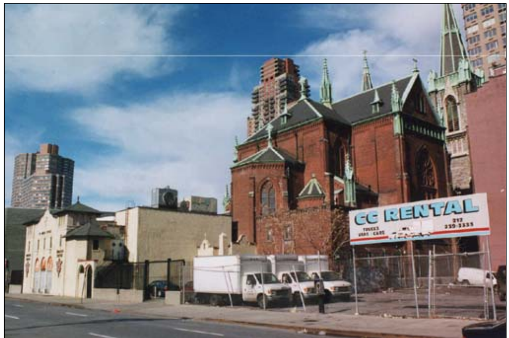
St. Raphael Roman Catholic Church and Rectory, 502-504 West 41st Street. View north from West 40th Street 82b