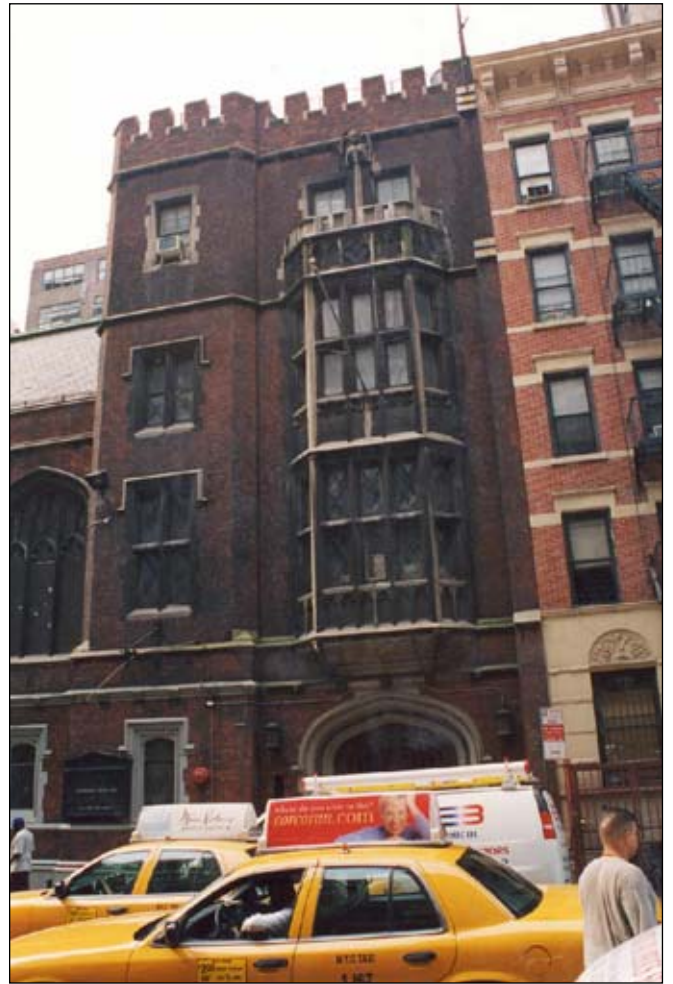
Christ Church Memorial, 334-344 West 36th Street. View south 83b