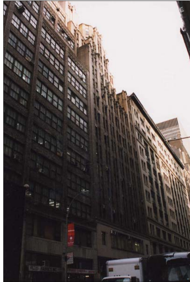
251-255 West 39th Street. View northeast 39