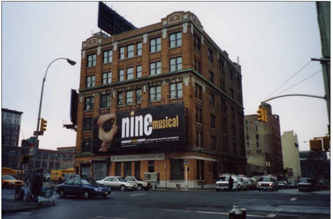
Former Pinehill Crystal Spring Water Company, 500-504 West 36th Street. View west from Tenth Avenue 94