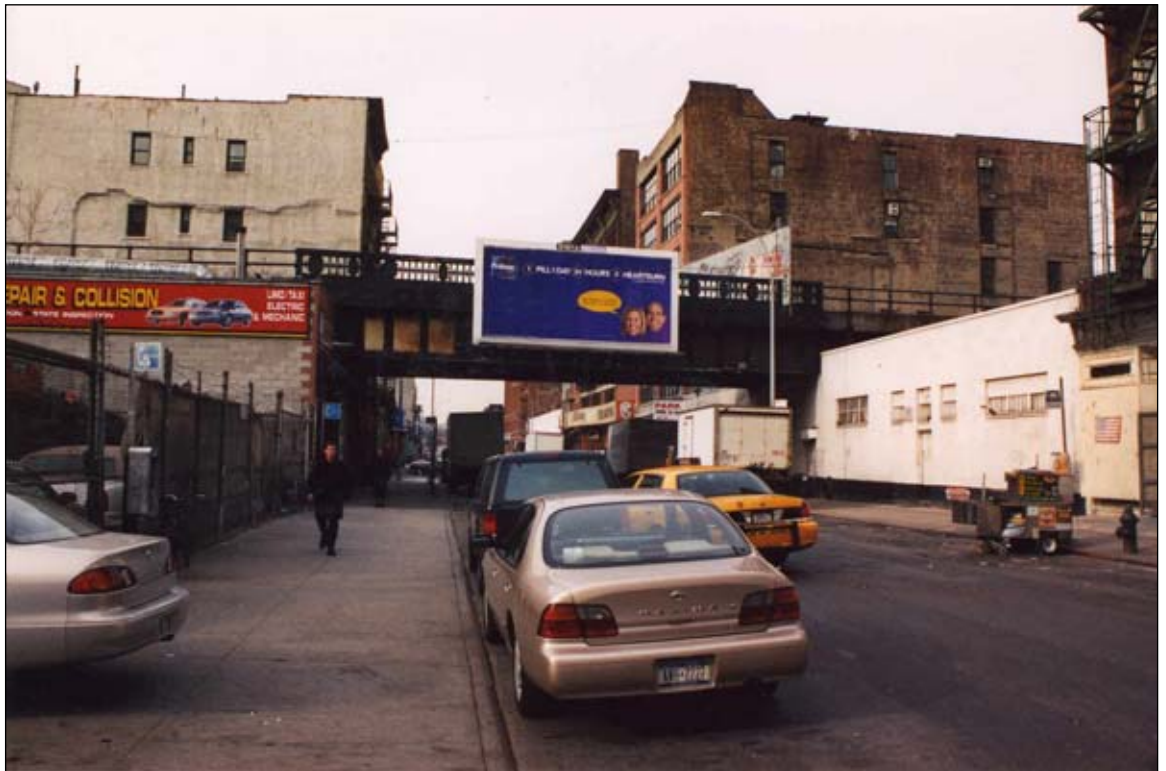
West 29th Street trestle. View west 27a