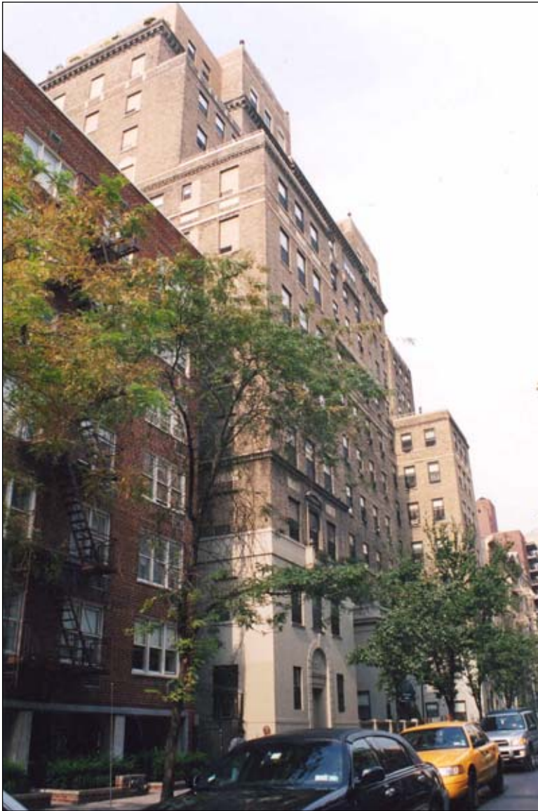
Former French Hospital, 326-330 West 30th Street. View southwest 13