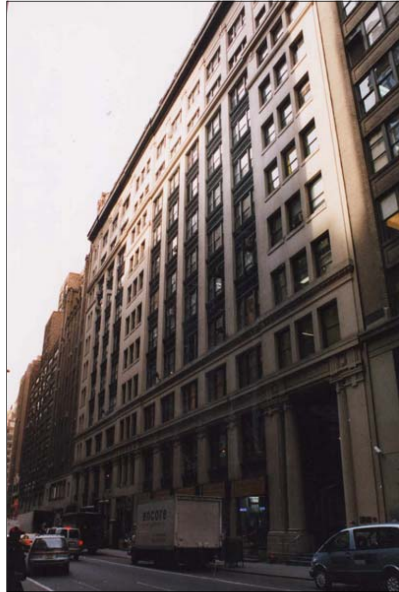
United Publishers Building, 231-249 West 39th Street. View northwest 59