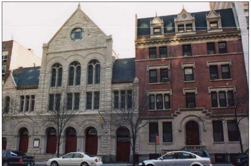
St. Michael's Roman Catholic Church Complex, 414-424 West 34th Street. View south of church and rectory 85a