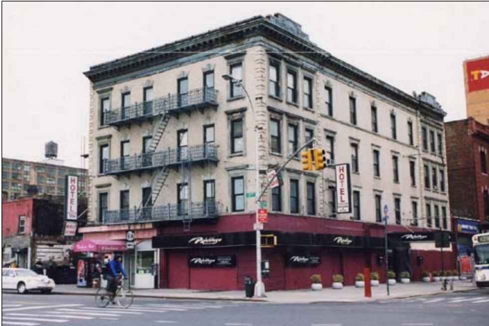
Terminal Hotel. 563-565 West 23rd Street. View east 26