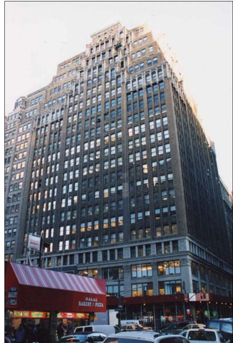
Thirty-Six Thirty-Seventh Street Arcade, 520-528 Eighth Avenue. 33 View east