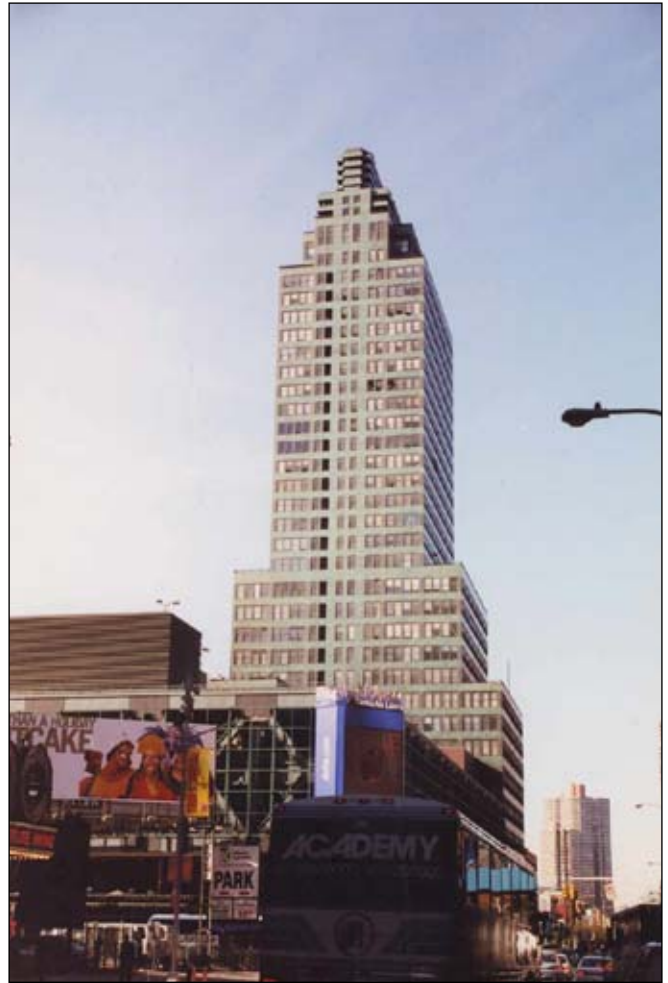
McGraw-Hill Building, 330 West 42nd Street. View west on West 42nd Street 10