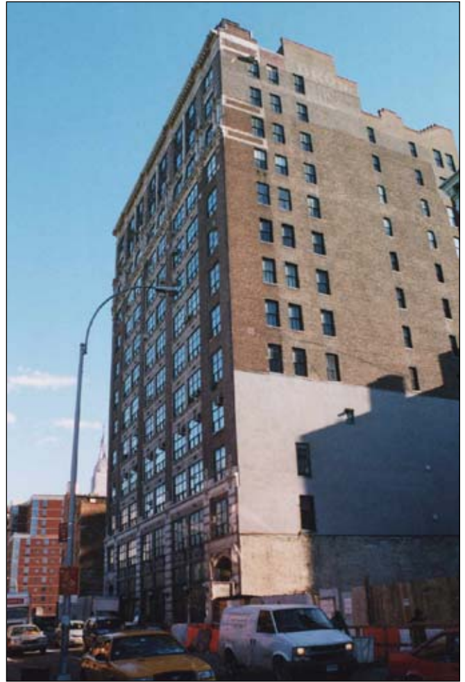
Underhill Building, 438-448 West 37th Street. View southeast 62a