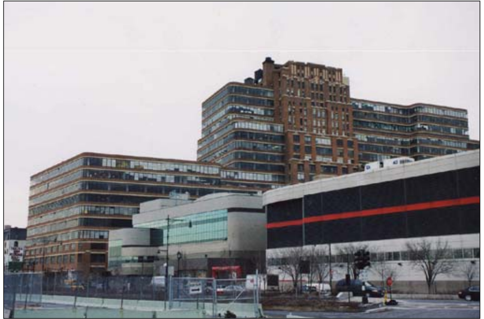
Starrett-Lehigh Building. View northeast from West 24th Street and Twelfth Avenue 24a