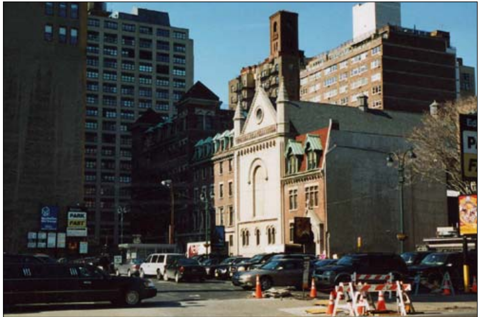
St. Michael's Roman Catholic Church Complex, 409-429 West 33rd Street. View west of vestry, church, convent, and school 85b