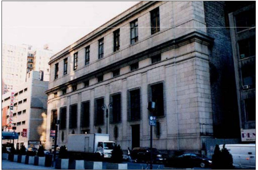
Penn Station Service Building, 236-248 West 31st Street. View southeast 7