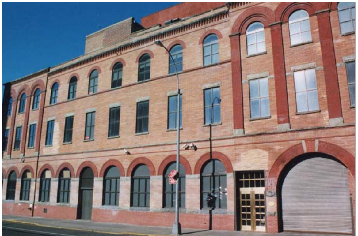
Former Franco-American Baking Company, 509-517 West 38th Street. View north 92