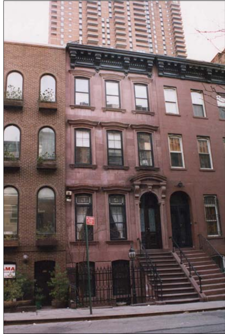
454 West 44th Street. View south 68