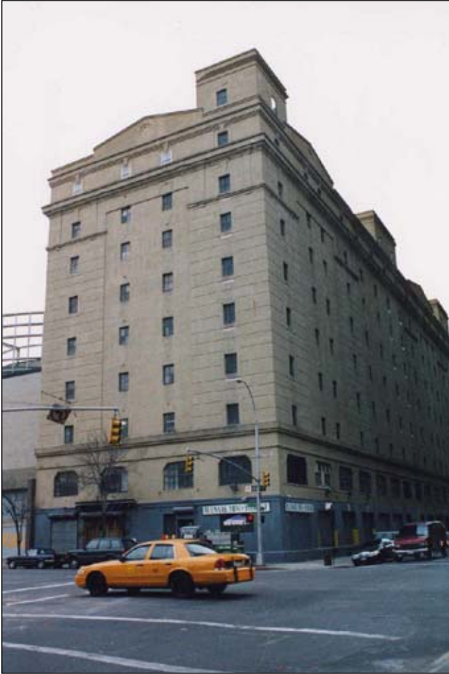
B & O Railroad Warehouse. View west from Eleventh Avenue 25