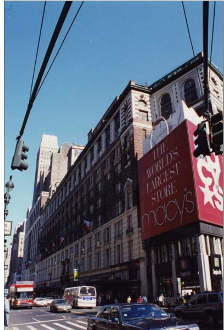
Macy's view west from Broadway and West 34th Street 2b