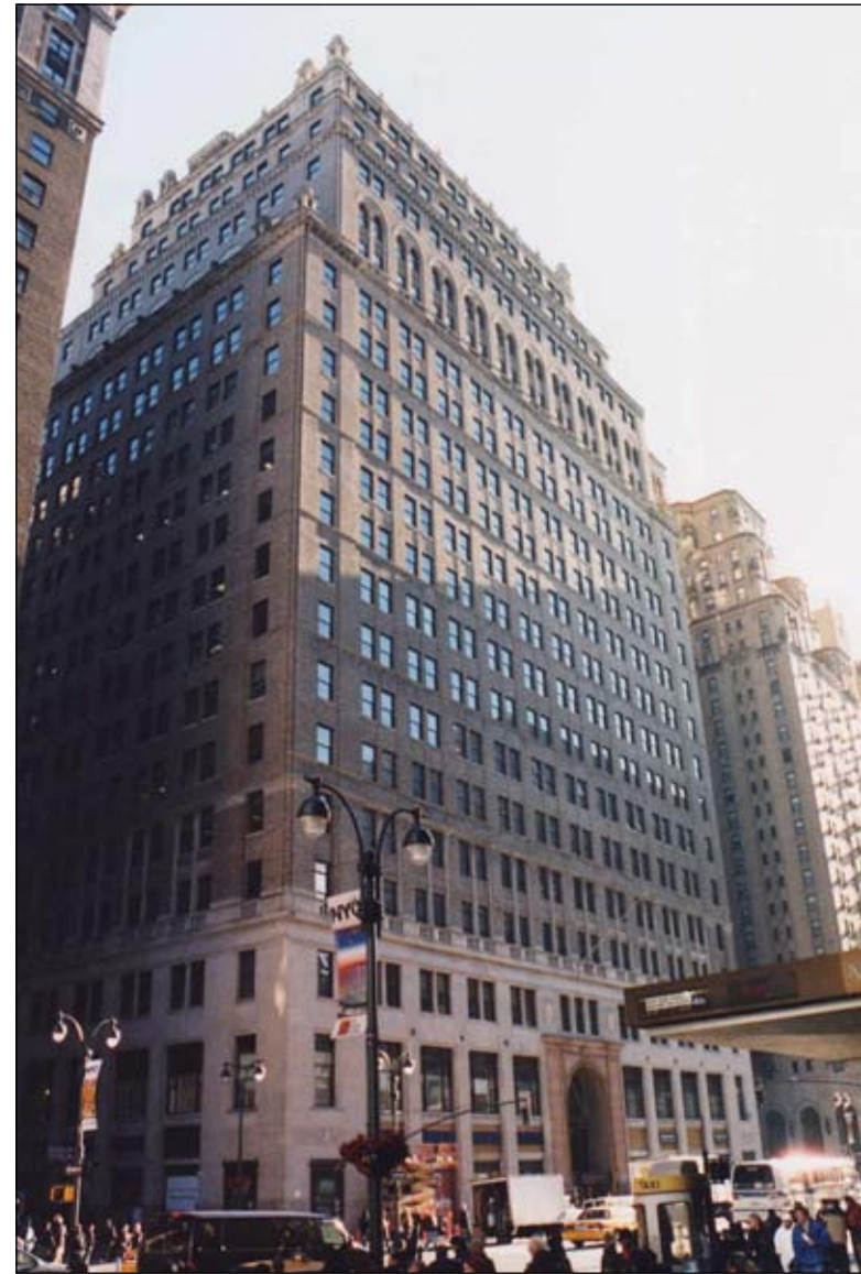
Former Equitable Life Assurance Company, 383-399 Seventh Avenue. View southeast 106