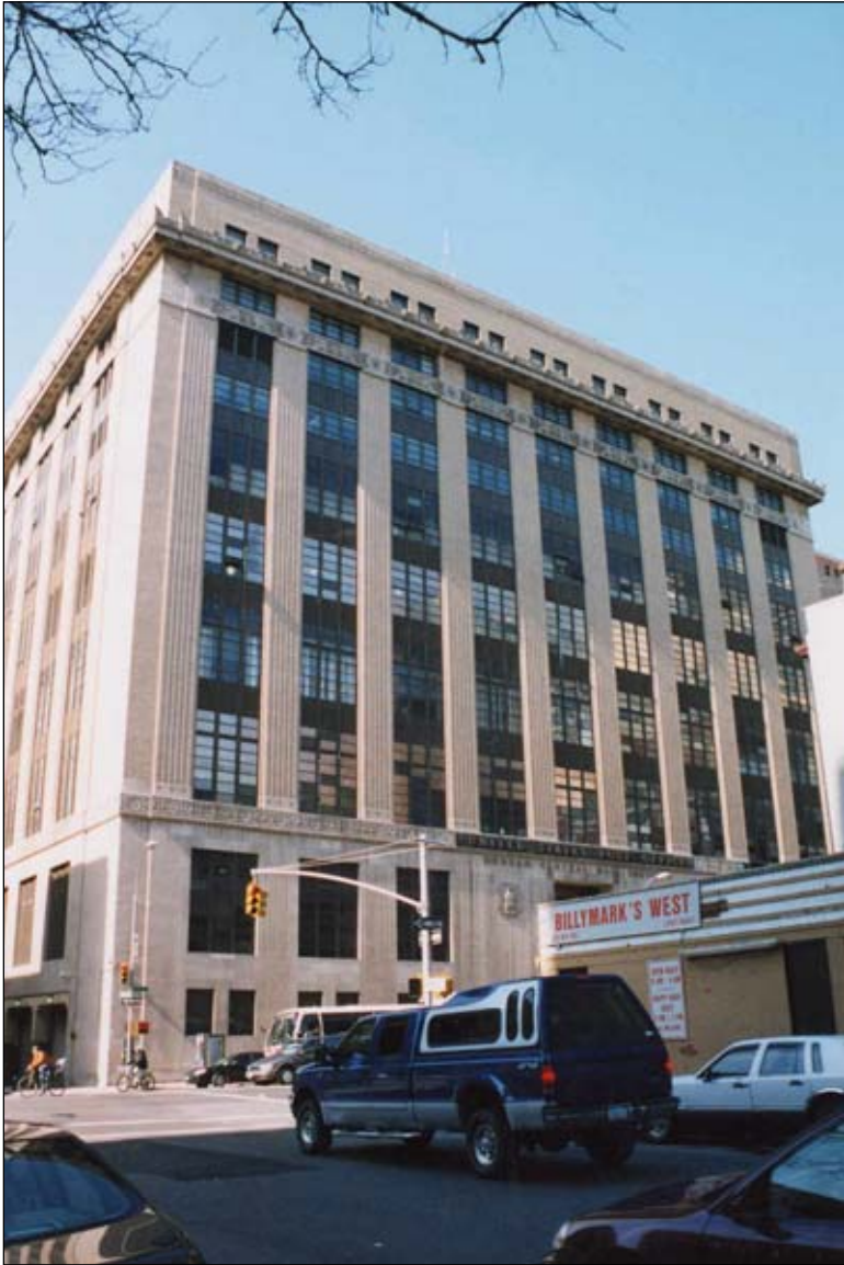
Morgan General Mail Facility. Ninth Avenue facade, view west 17