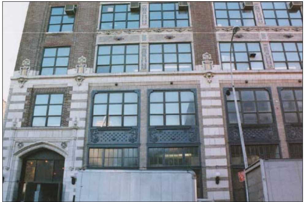
Detail of Underhill Building, 438-448 West 37th Street 62b