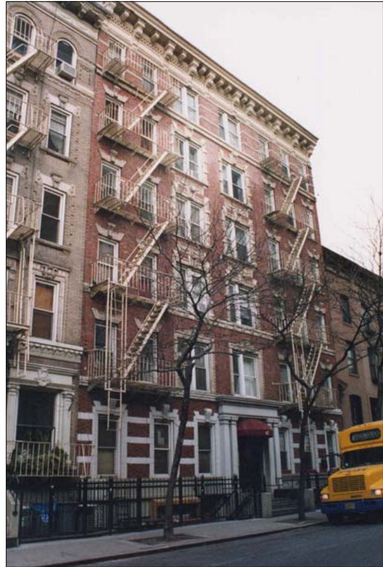
417-419 West 43rd Street. View northeast 70