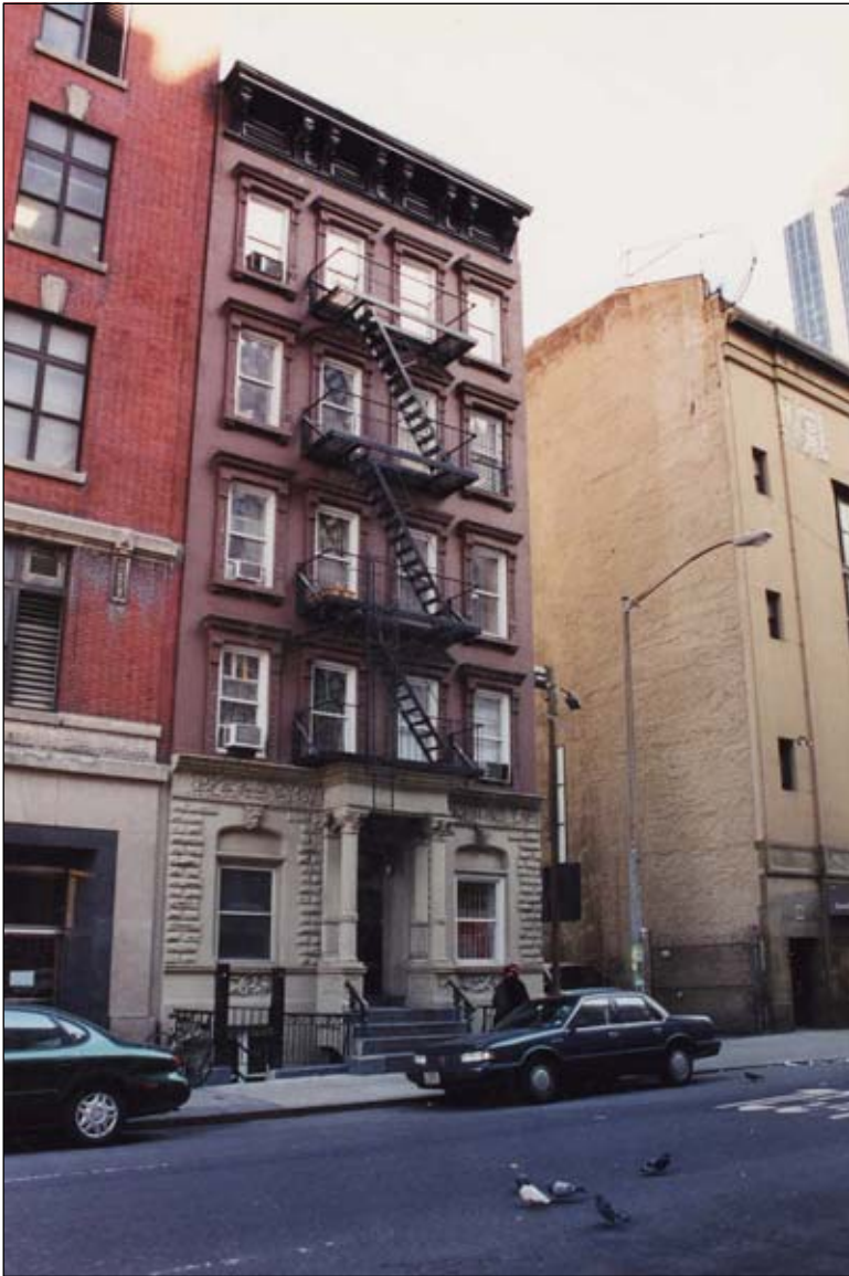
309 West 43rd Street. View north 69