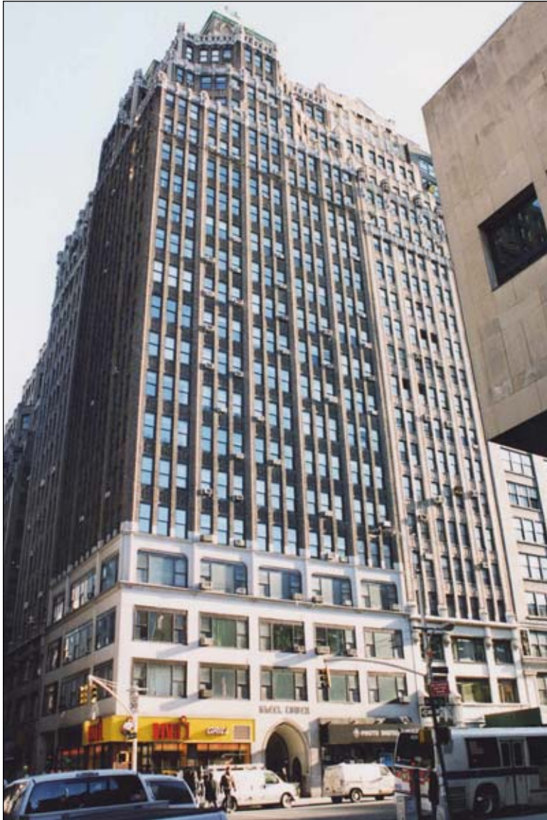
Kheel Tower, 311-315 Seventh Avenue. View southeast 30