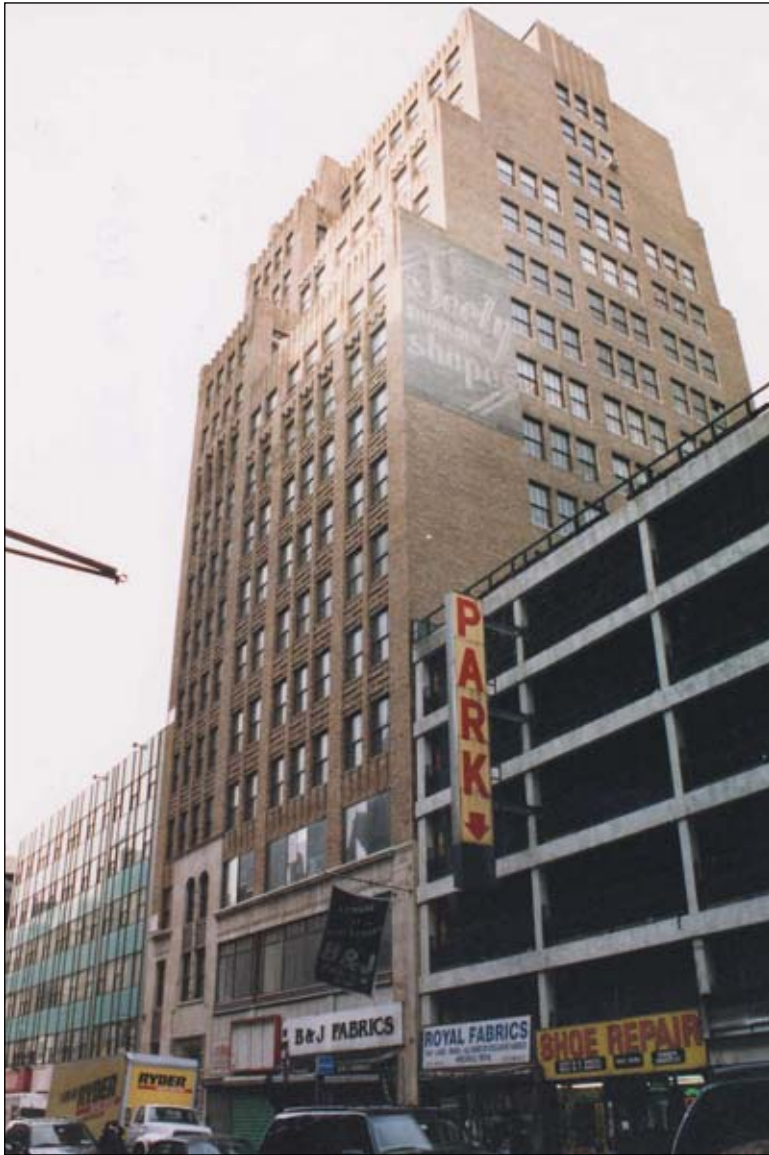
263-267 West 40th Street. View northwest 38