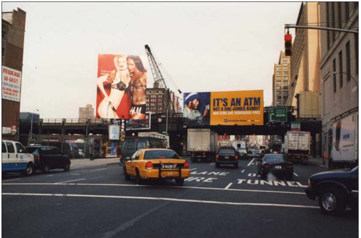
Rail spur over Tenth Avenue and West 30th Street. View north on Tenth Avenue from West 29th Street 27b