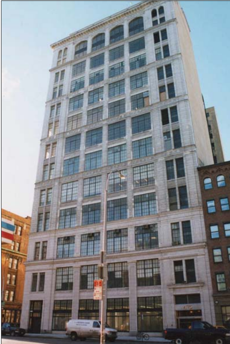
Hill Building, 469-475 Tenth Avenue. View west 56