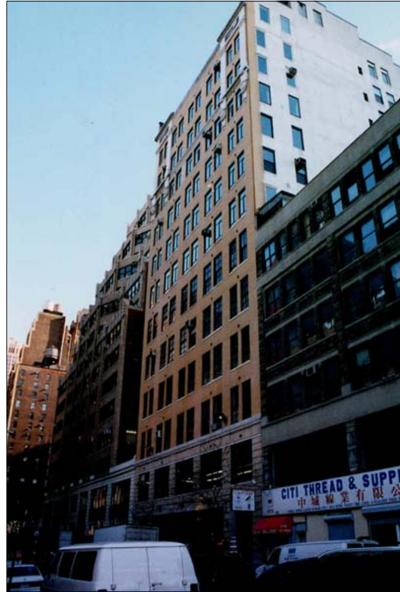
344-348 West 38th Street. View south. 61