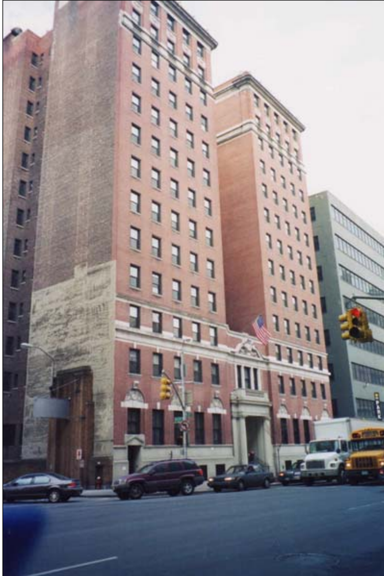
Webster Apartments, 419 West 34th Street. View northeast 80