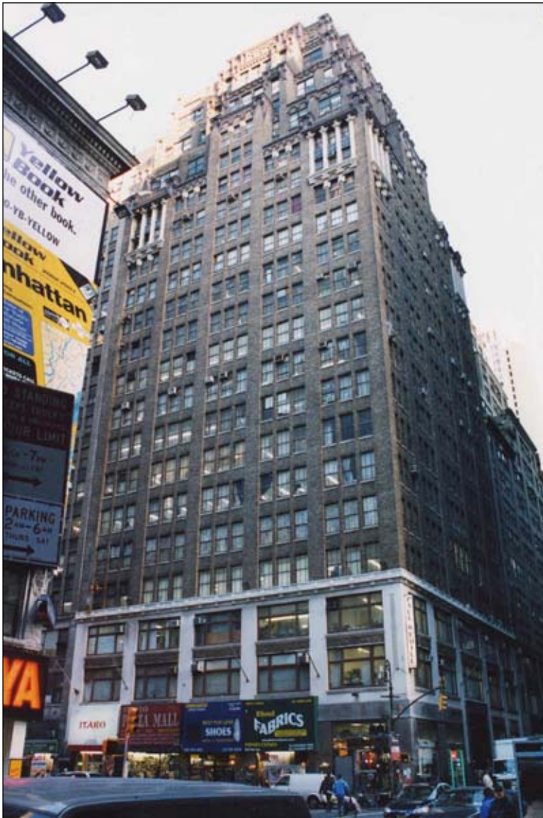
Former American Union Bank Building, 540-552 Eighth Avenue. 32 View east