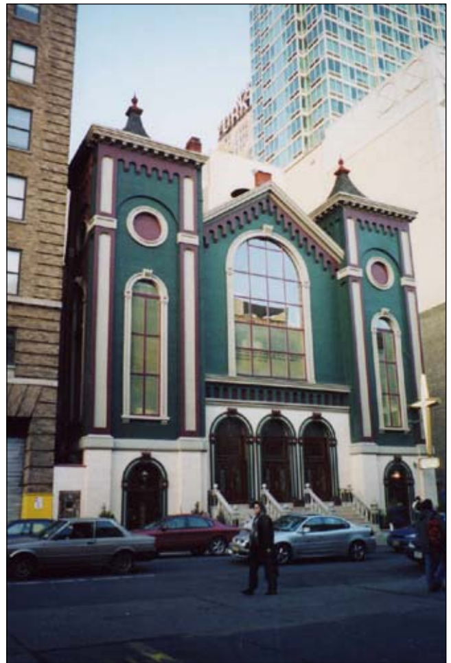
Glad Tidings Tabernacle, 325-329 West 33rd Street. View north 86