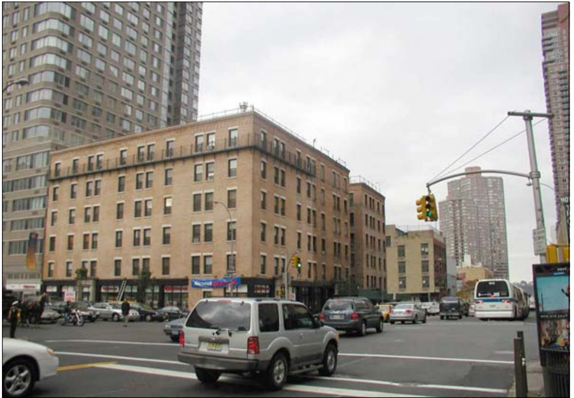
Model Tenements (72). Existing view west on 42nd Street 115