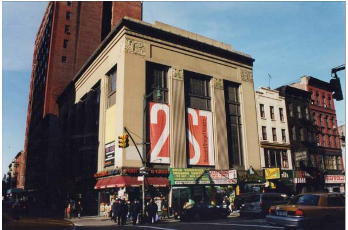
State Bank and Trust Company, 681-685 Eighth Avenue. View west 15