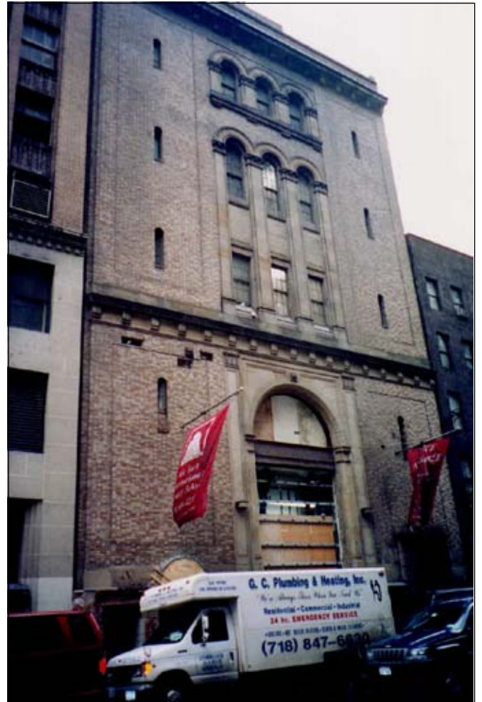
Former New York Edison Company, 308-312 West 36th Street 90