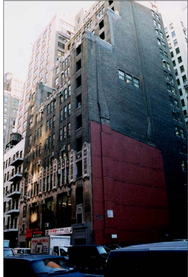
Garment Wear Arcade, 306 West 37th Street. View southeast 43