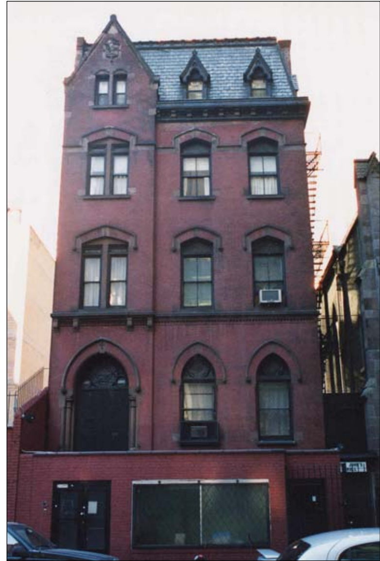
St. John the Baptist Roman Catholic Church, 207-215 West 30th Street. View north 6b