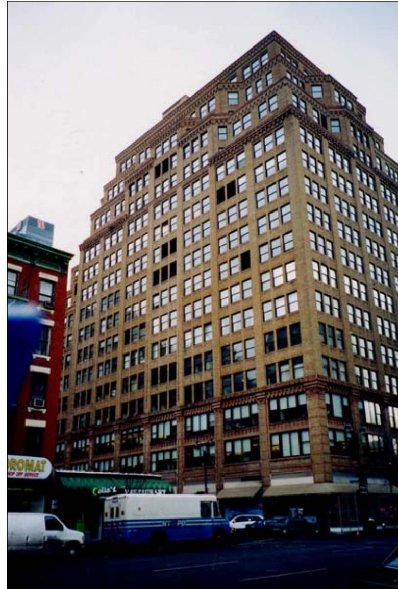
Harding Building, 440-448 Ninth Avenue. View southeast 37