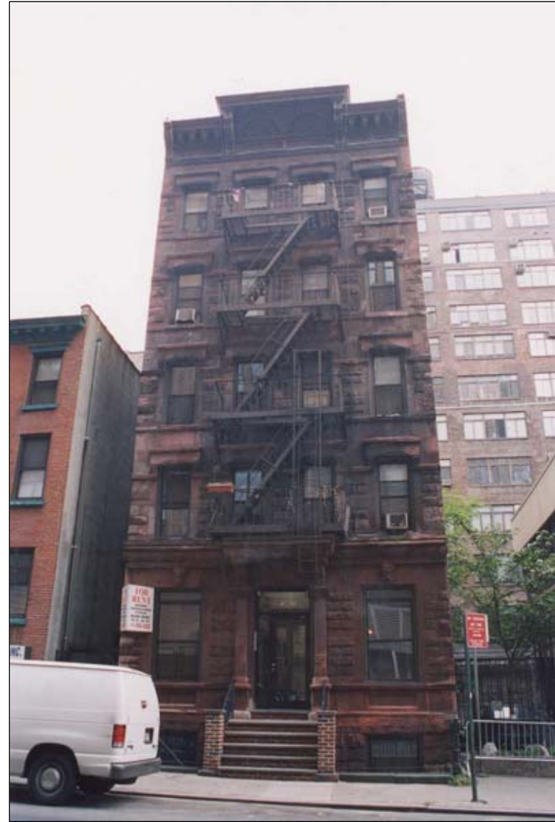
367 West 35th Street. View north 77