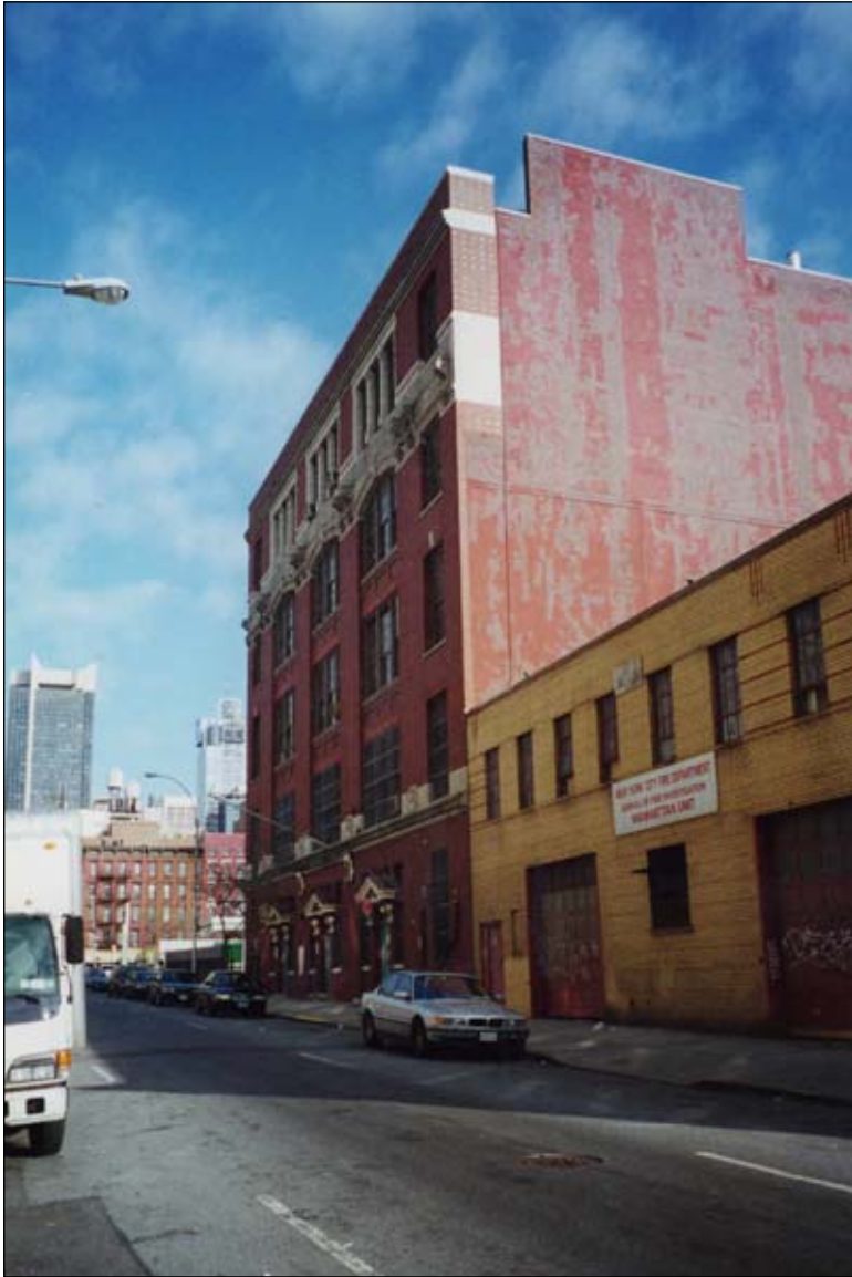
Public School 51, 520 West 45th Street. 18 View east on West 45th Street