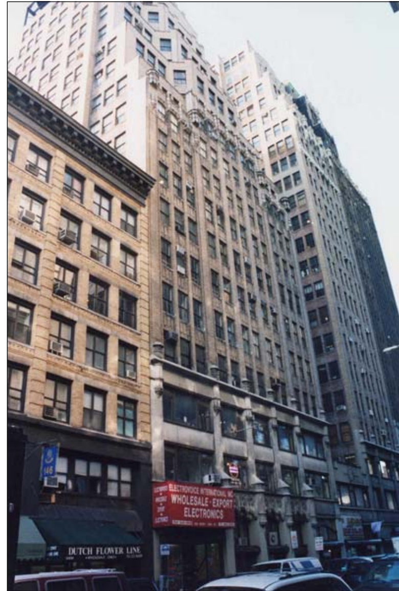
Industrial Building, 150-154 West 28th Street. View southwest 51