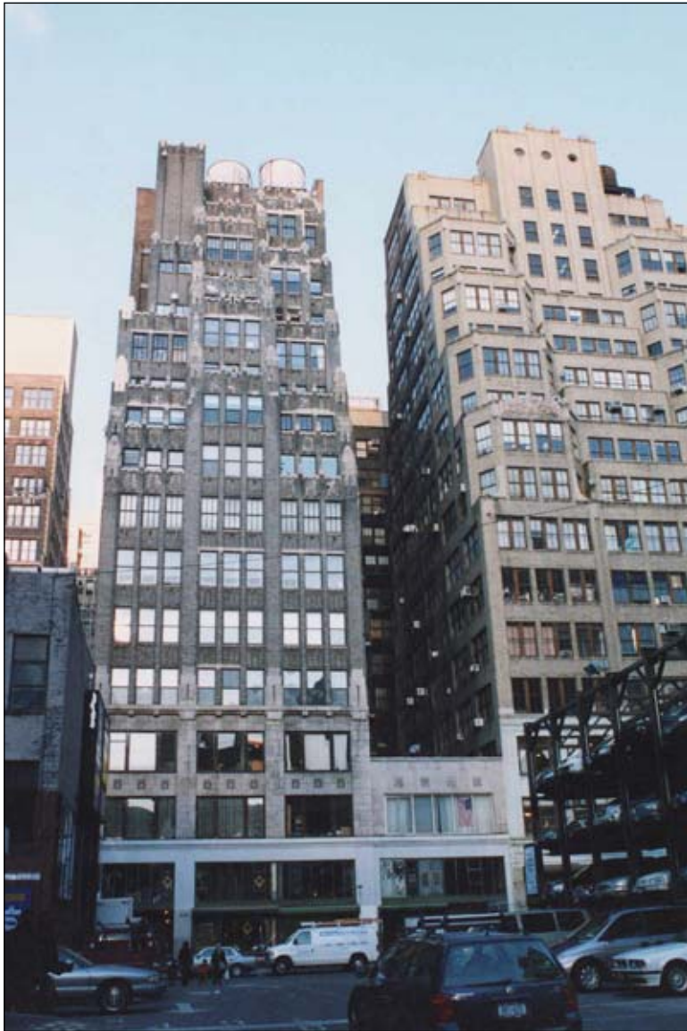
249-251 West 29th Street. View north 50