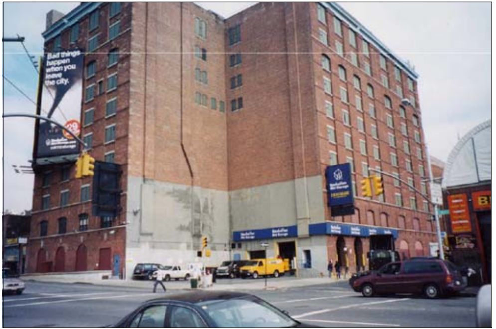
Former W&J Sloane Warehouse, 541-561 West 29th Street. View northeast from Eleventh Avenue 99