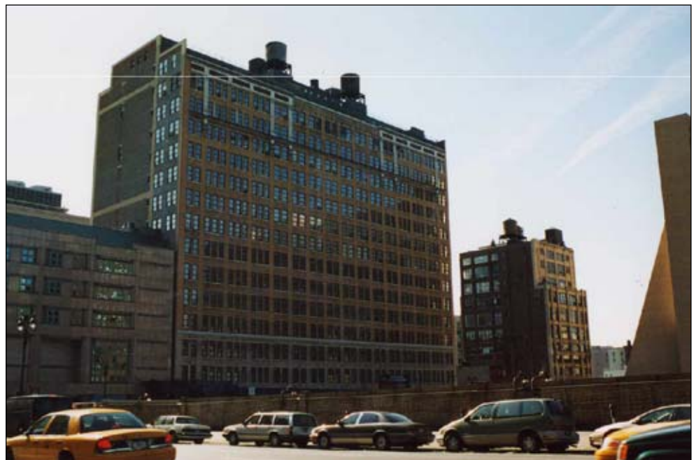
406-426 West 31st Street. View southwest 64