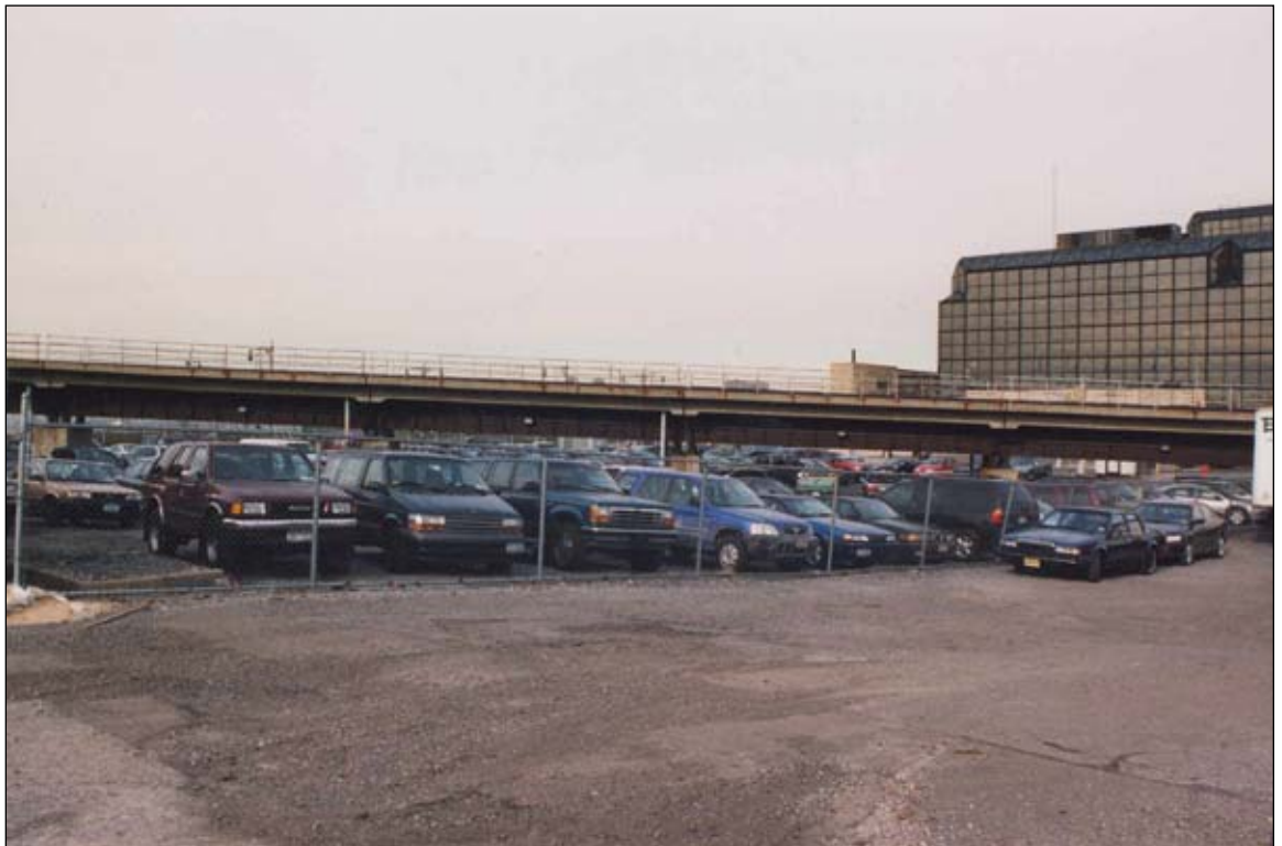
Curve in the viaduct as it moves from Twelfth Avenue to parallel West 34th Street 27j View northwest from West 33rd Street