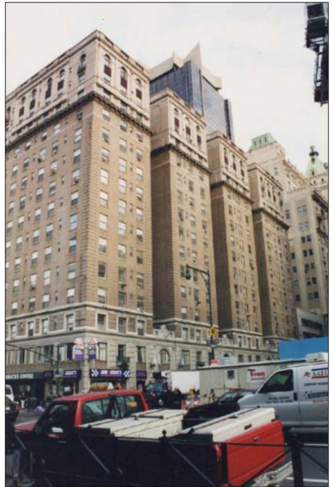
Times Square Hotel. View northeast from Eighth Avenue and West 43rd Street 8