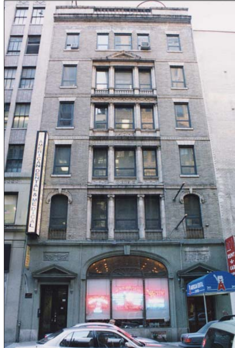
Fairmont Building, 239-241 West 30th Street. View north 55