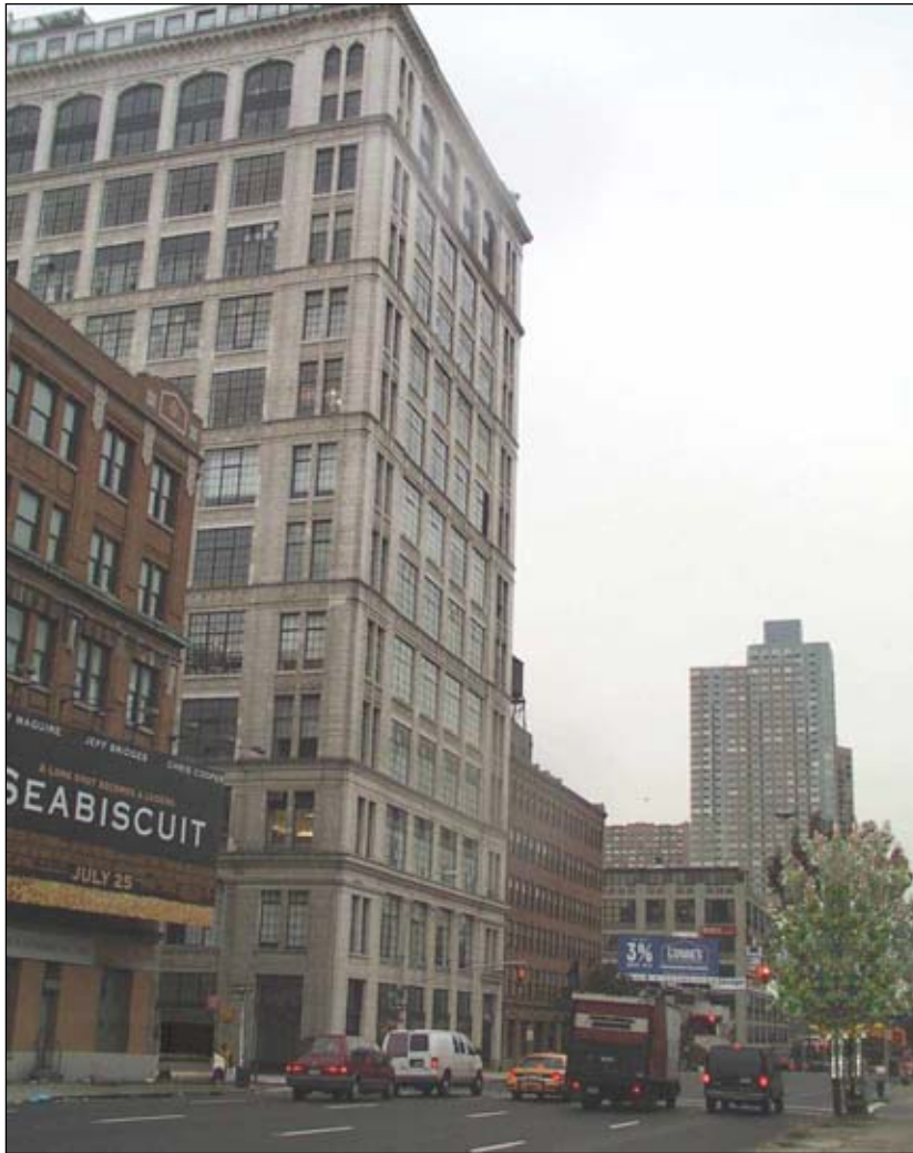
Hill Building (56). Existing view northwest on Tenth Avenue 113