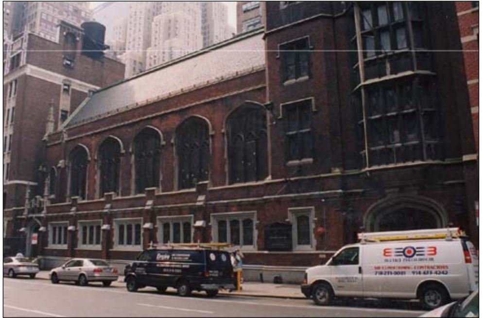
Christ Church Memorial, 334-344 West 36th Street, View southwest 83a