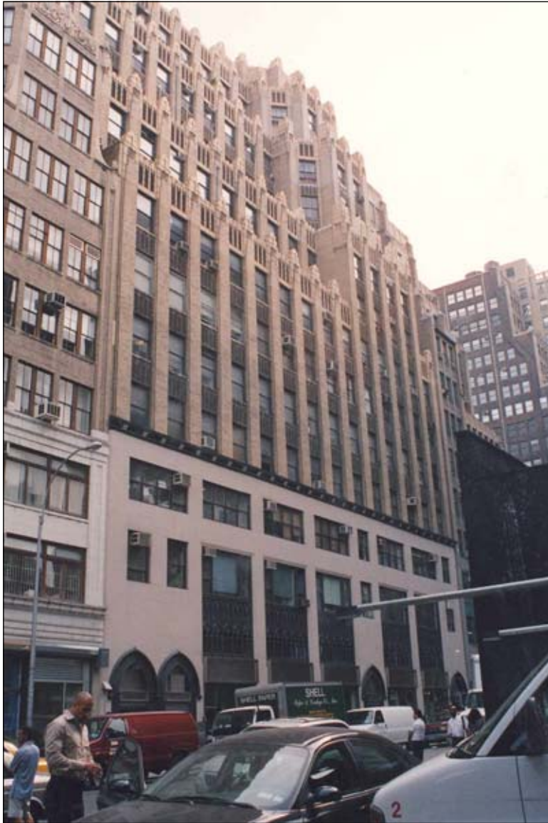
231-239 West 29th Street. View northeast 48