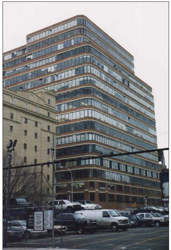
Starrett-Lehigh Building. Eleventh Avenue facade, view north 24b