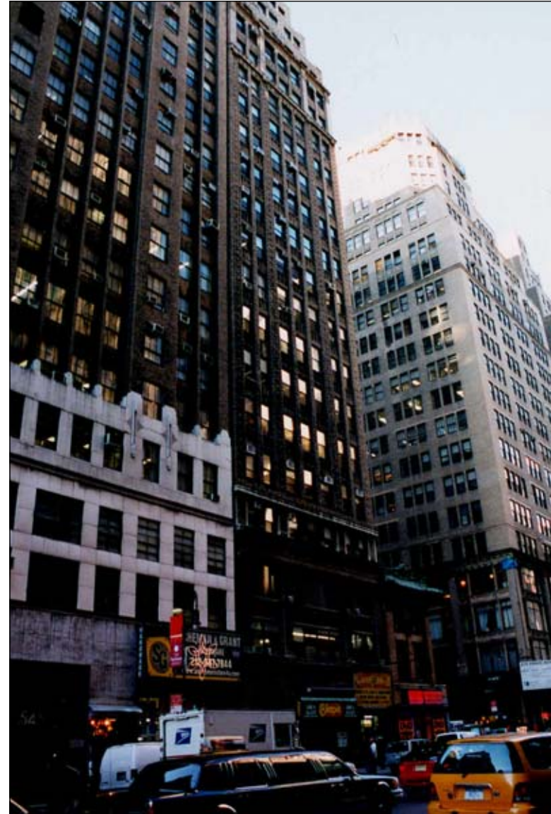
Shampán 8th Avenue Building, 553-555 Eighth Avenue. View northwest 31