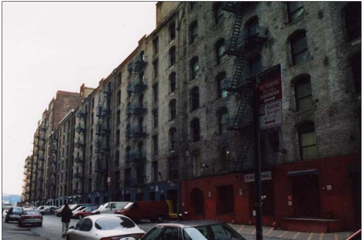
New York Terminal Warehouse Company. View west on West 27th Street 23b