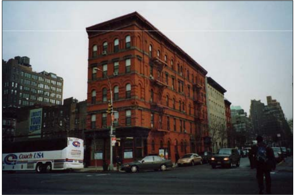
463 west 35th Street. View east from Tenth Avenue 78