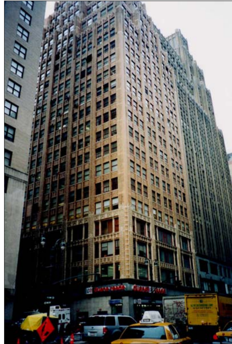
Hoover Building, 501-507 Eighth Avenue. View northwest 35