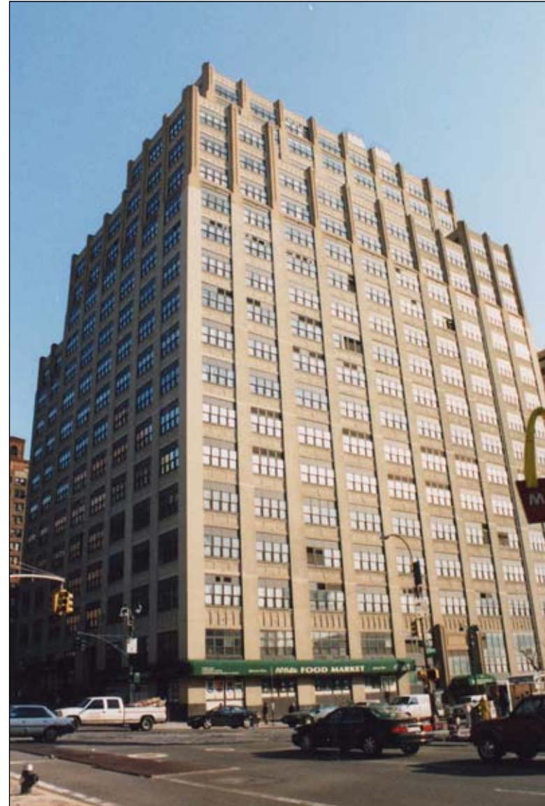
Master Printers Building, 406-416 Tenth Avenue. View southeast 57