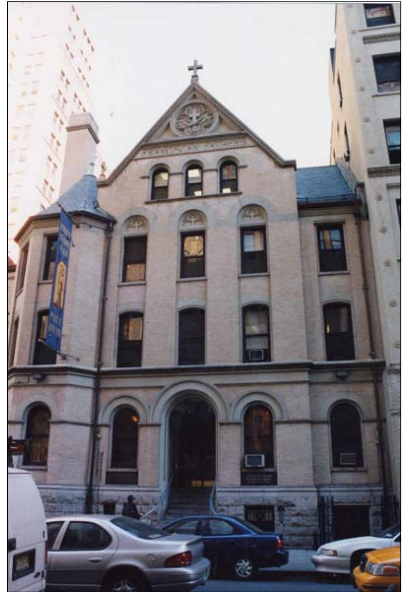
St. Francis Roman Catholic Church Complex, 129-143 West 31st Street. View north 3b