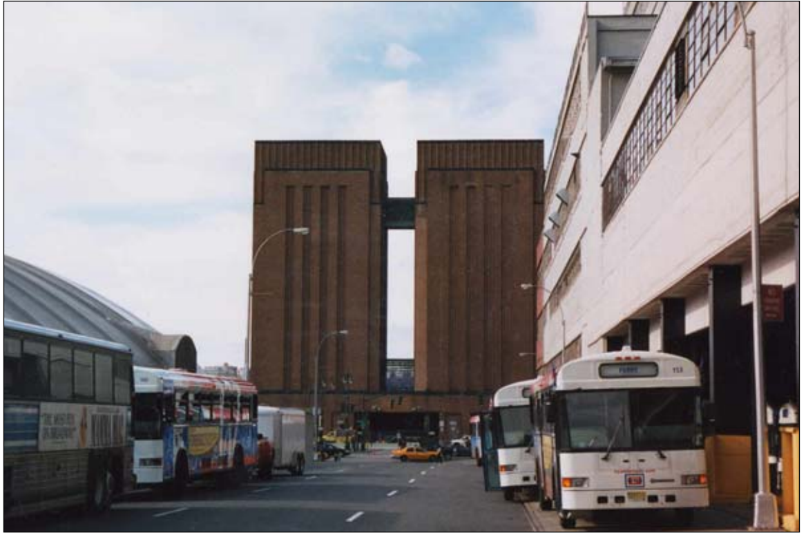
Lincoln Tunnel North Ventilator (19D). View west on West 39th Street 19e