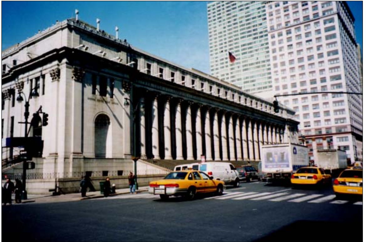
United States General Post Office. View northwest from Eighth Avenue and West 31st Street 12a