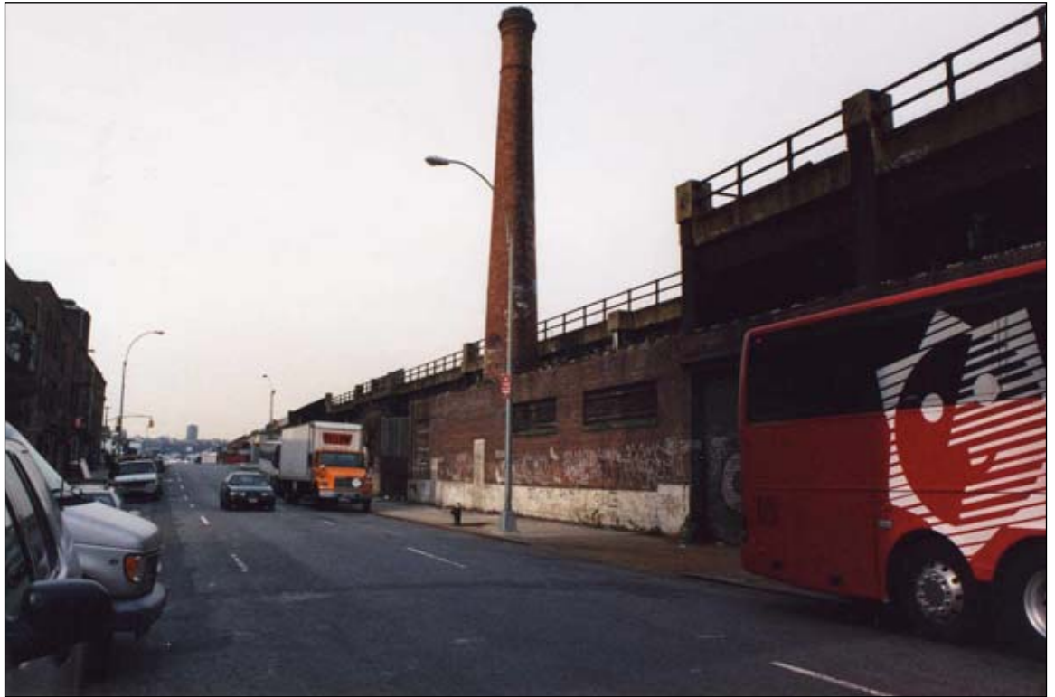
West 30th Street viaduct. View west toward Eleventh Avenue from West 30th Street trestle 27e