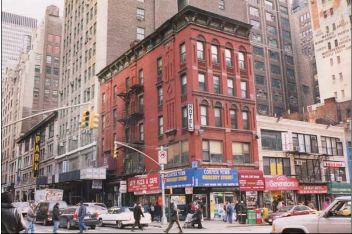
274 West 40th Street. View southeast 73