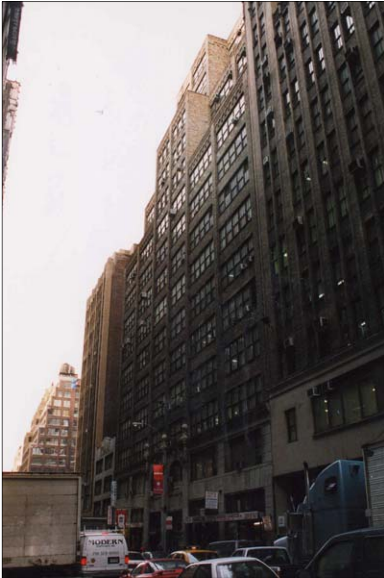
Former Kermacoe Building, 257-267 West 39th Street. View northwest 40