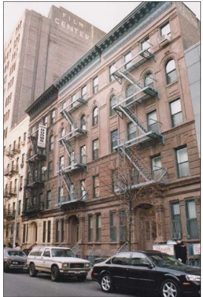
347-353 West 44th Street. View north 66