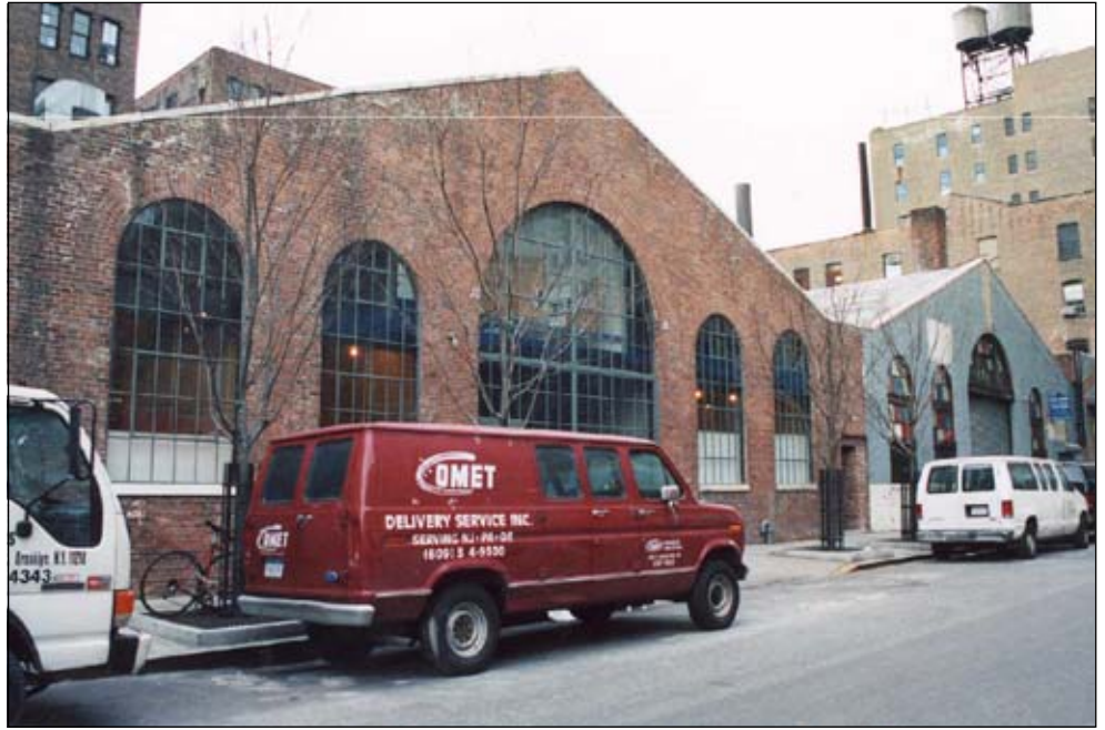
537-547 West 26th Street. View north 103