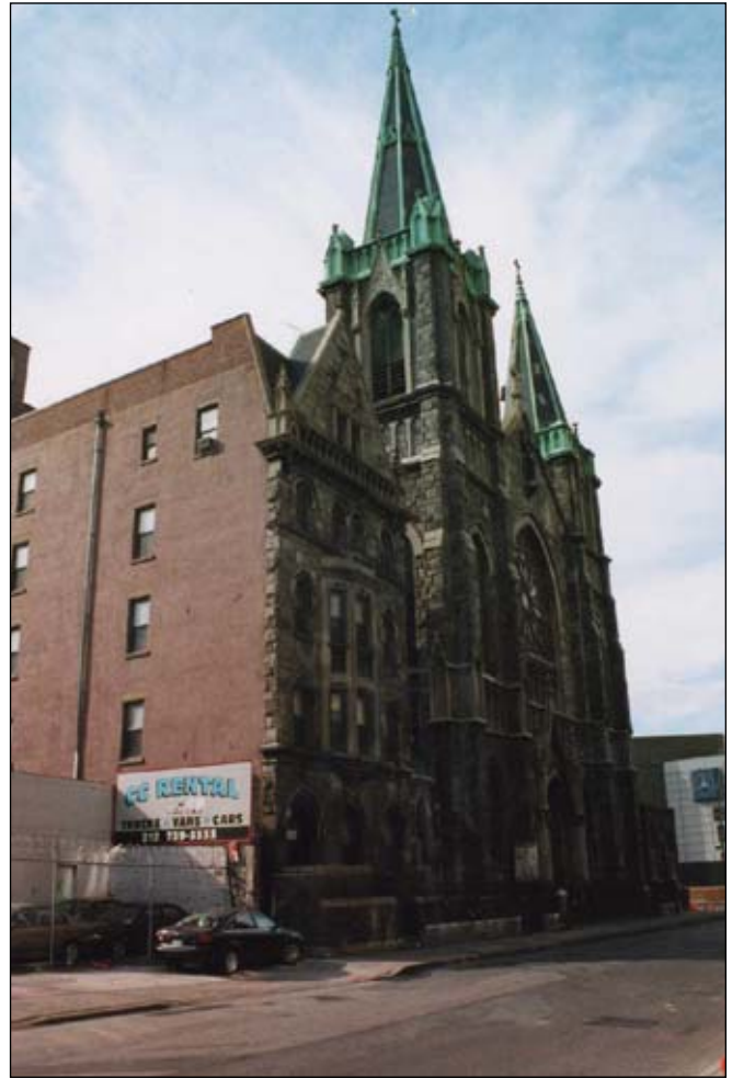
St. Raphael Roman Catholic Church and Rectory, 502-504 West 41st Street. View west 82a