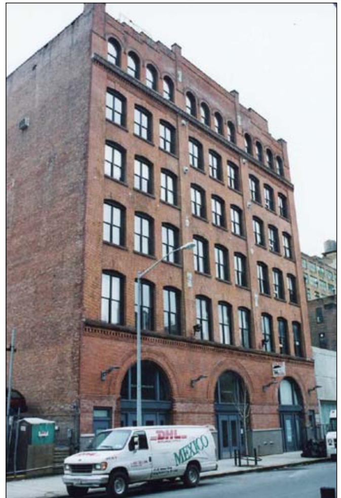
Standard Oil Offices, 551-555 West 25th Street. View north 104