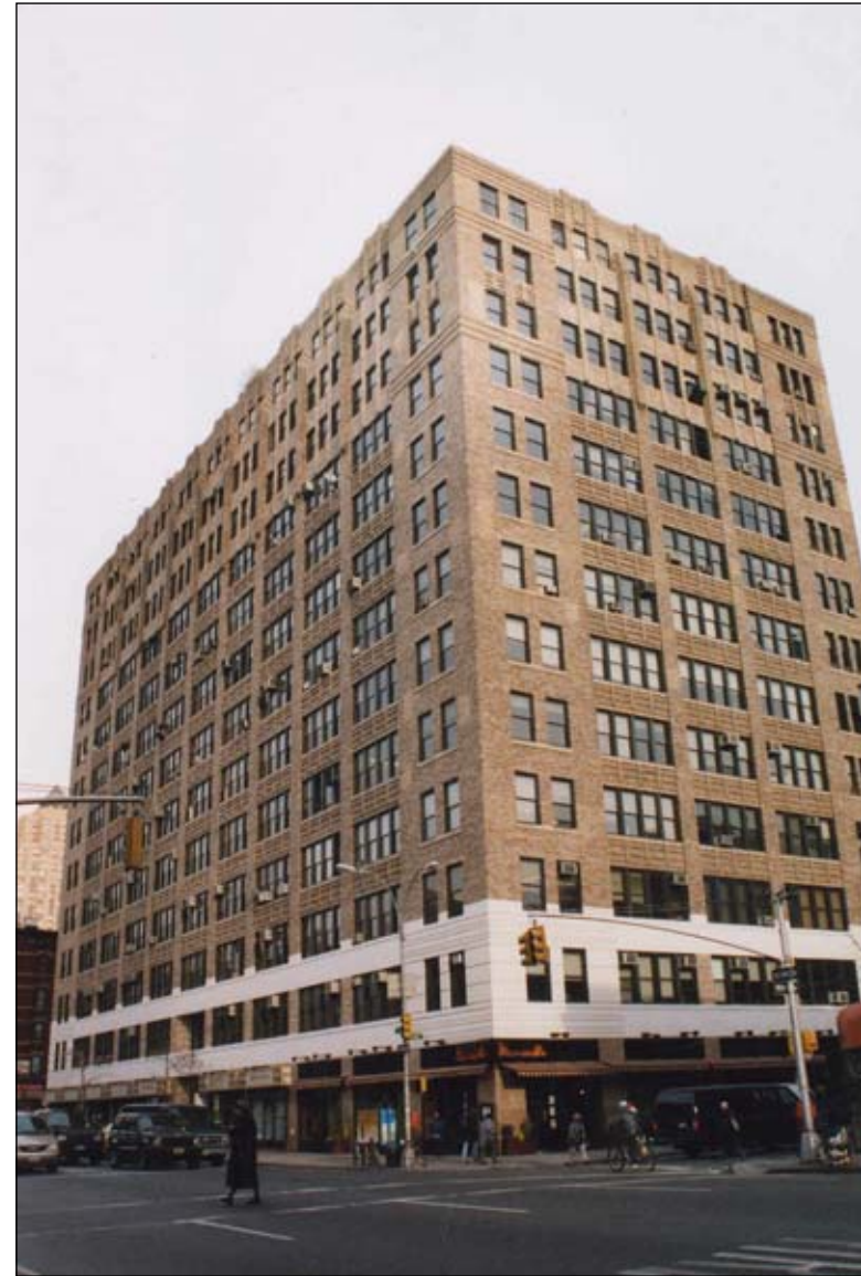
Film Center Building, 630 Ninth Avenue. 14 View northeast from Ninth Avenue and West 44th Street