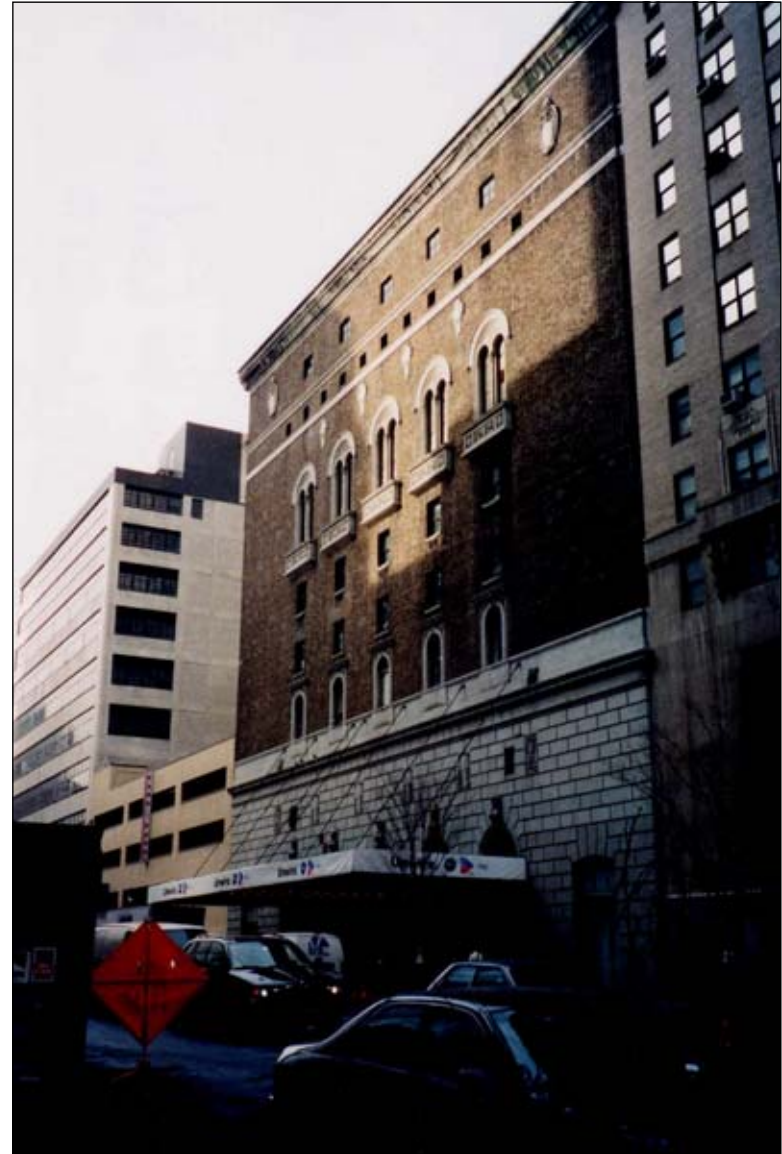
Former Manhattan Opera House, 311 West 34th Street. View northwest 88