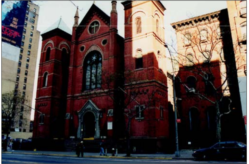
Holy Cross Roman Catholic Church and Rectory, 329-333 West 42nd Street 9a