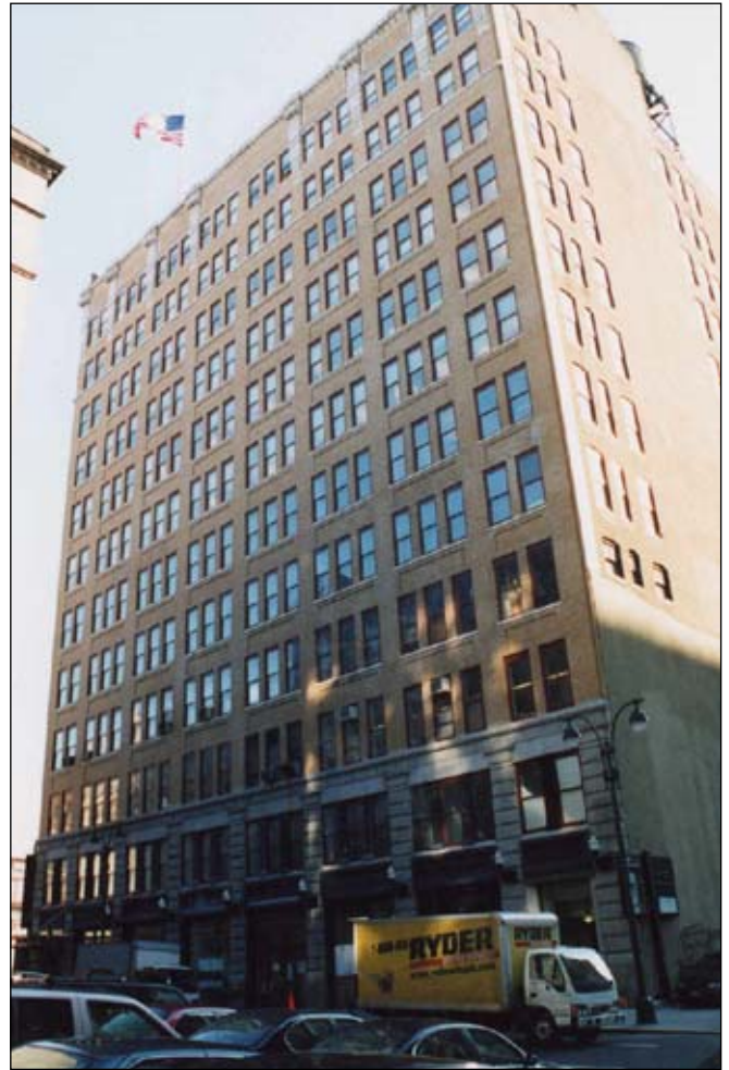
424 West 33rd Street, View south 63