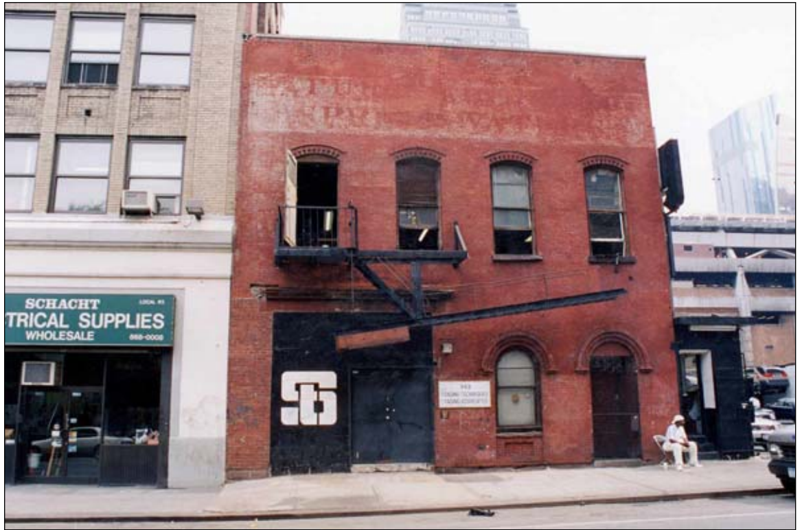
343-345 West 39th Street. View north 91