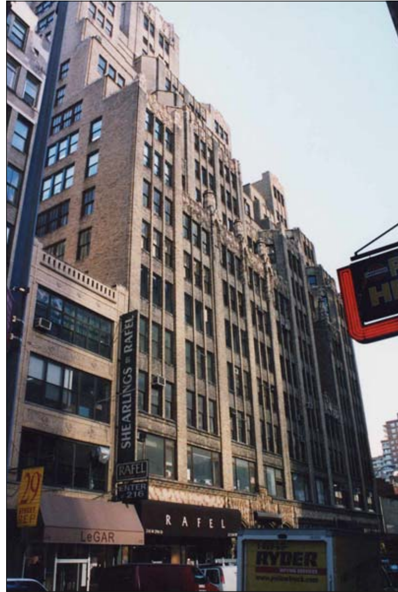
214-222 West 29th Street. View southwest 47