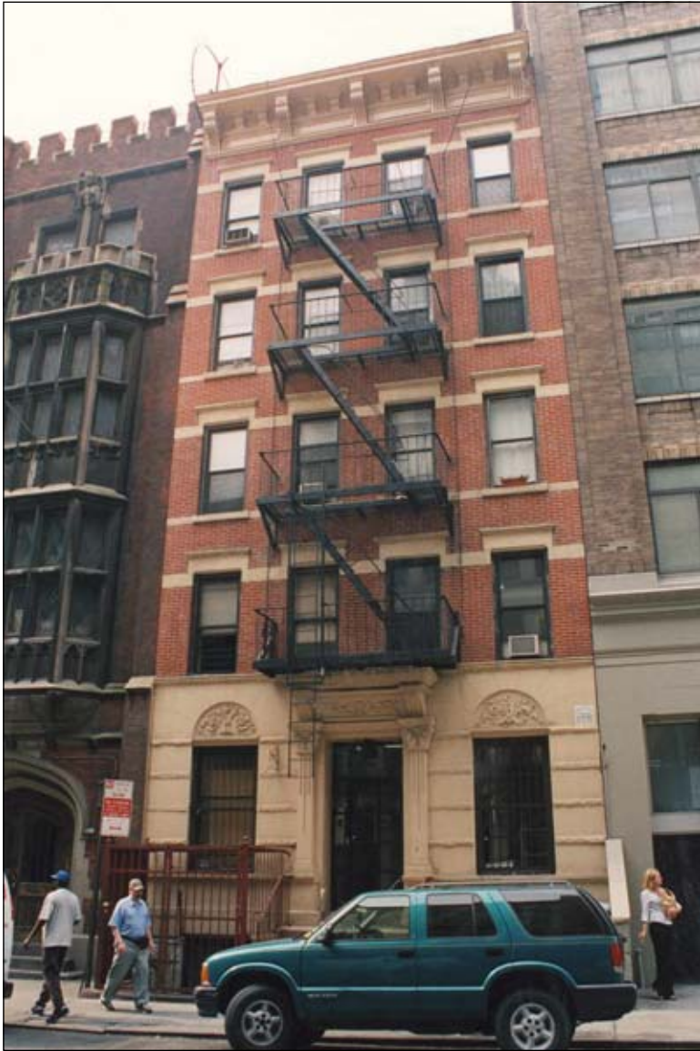
346 West 36th Street. View south 76