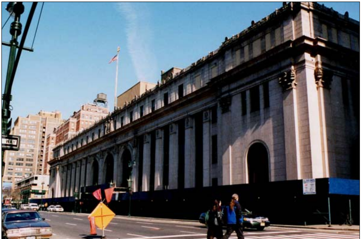
United States General Post Office. View northeast from Ninth Avenue and West 31st Street 12b