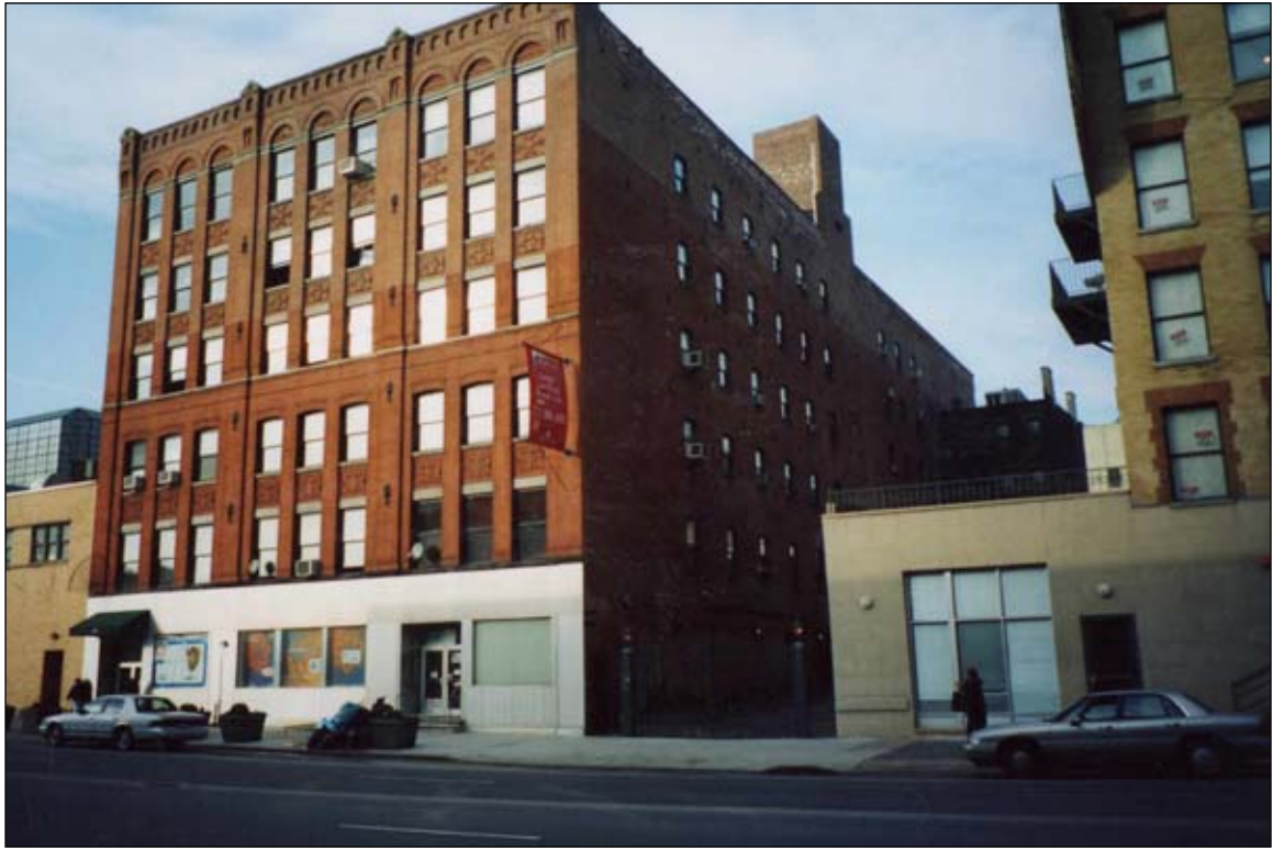
Former Gledhill Wall Paper Company. 541-545 West 34th Street. View north 95