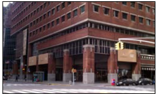
7 Hanover Square (view from Water Street)

Due to the design and variation of the arcades along and nearby Water Street, the arcades do not function well as pedestrian areas and, instead, diminish vitality from this important pedestrian corridor. The proposal would help Water Street become a lively pedestrian corridor connecting visitors from the South Street Seaport area down to the Staten Island Ferry Terminal, with outdoor cafes and new signs of life. The text amendment builds on the success of City Planning's many initiatives to improve the pedestrian realm, and furthers Mayor Bloomberg's commitment to revitalizing Lower Manhattan.