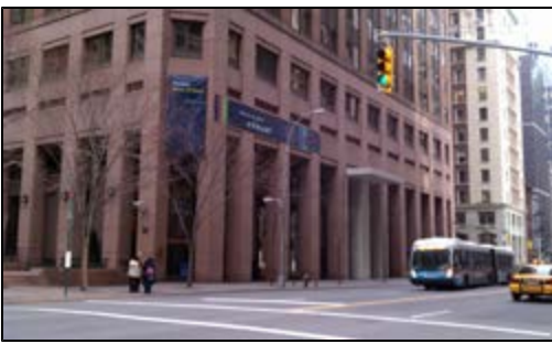
75 Wall Street (view from Water Street)