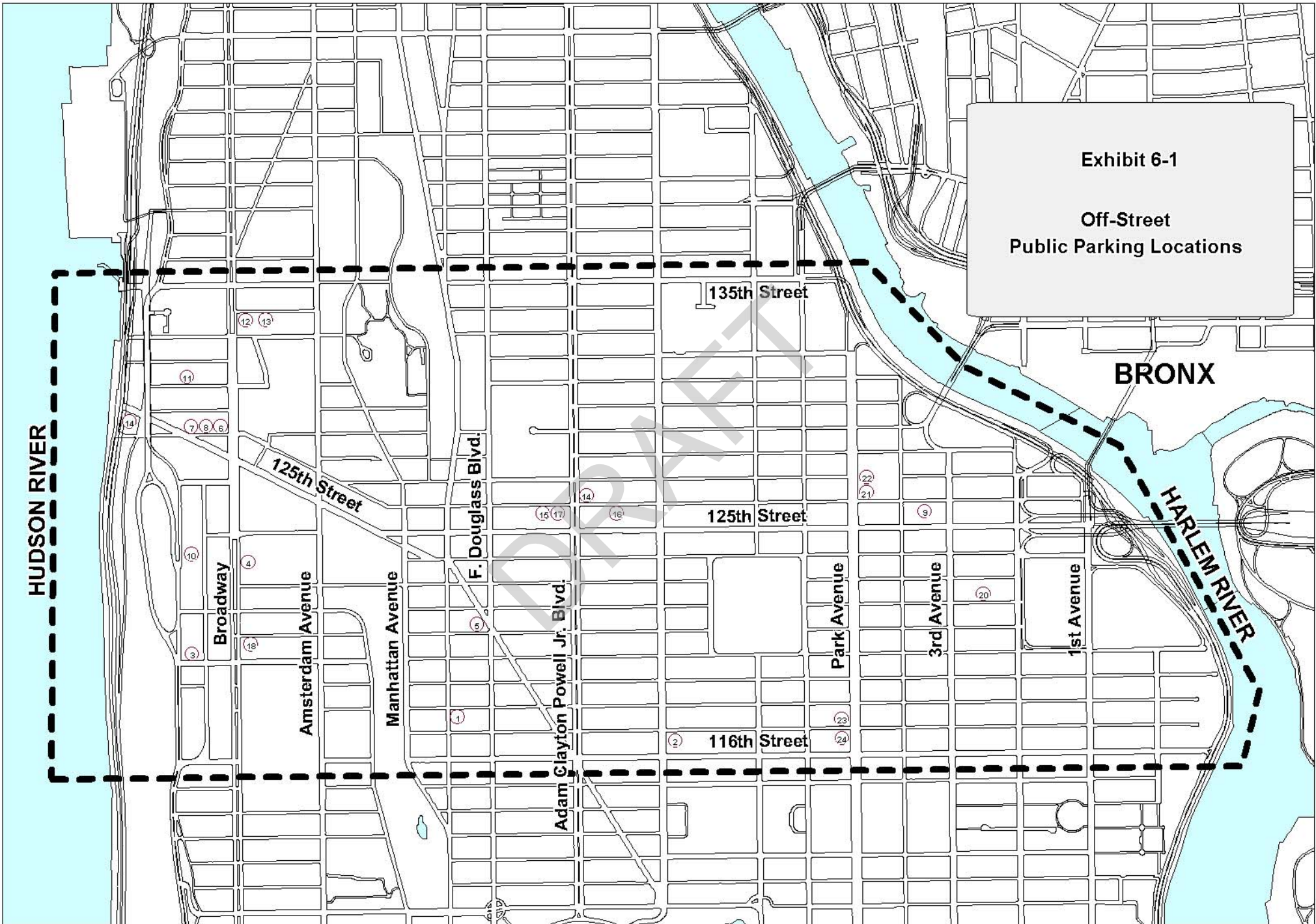
Exhibit 6-1 Off-Street Public Parking Locations