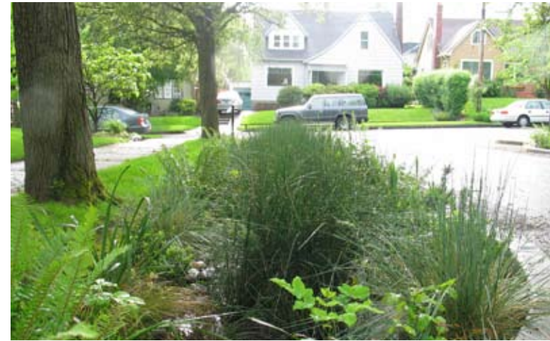
Portland's planted curb extensions enhance the aesthetics of the streetscape while reducing water run-off and flooding and calming traffic.

The primary objective of a vegetated swale is the short term retention of large volumes of stormwater. In suburban or rural areas, a vegetated swale is often an existing ditch or depression that has been modified into a chain of small ponds and planted with native species. In vegetated swale designs, rain run-off is allowed to accumulate in large volumes. In the days following a storm, water is slowly removed through the combination of infiltration into the ground, plant uptake, and evaporation. Swales can retain large volumes of stormwater and provide excellent pollution removal.