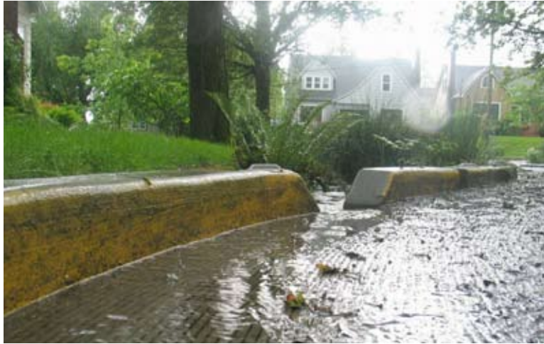
Simple design features like cut-outs allow water to flow off the pavement and into porous areas thus reducing flooding.

In Seattle and Portland, planners have removed or altered existing curbs to reduce water run-off after storms. Typically, curbs tend to channelize water resulting in high velocities and high content of sediment and pollution. Removing short sections of the existing curb allows water to be strategically distributed over large vegetated areas or directed into natural infiltration and retention systems.