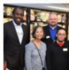
2023 Chefs of the Year: The Leadership Team Stop & Shop