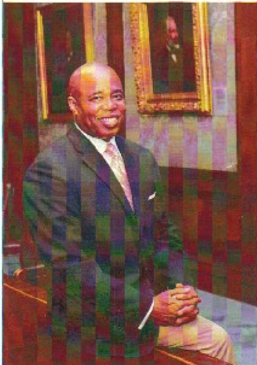
ERIC L. ADAMS Brooklyn Borough President