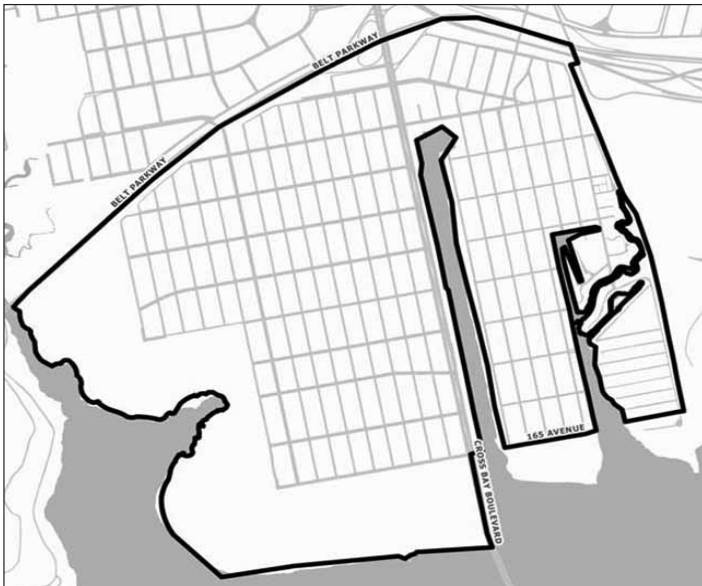
Map 4 Neighborhood Recovery Area in Queens Community District 10