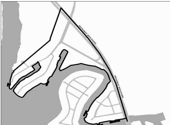
Map 5 Neighborhood Recovery Area in Queens Community District 13