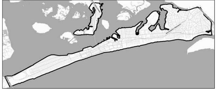
Map 6 Neighborhood Recovery Area in Queens Community District 14