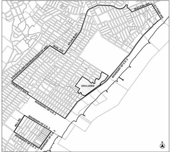
Map 7 Neighborhood Recovery Areas in Staten Island Community District 2

Areas designated by New York State as part of the NYS Enhanced Buyout Area Program are excluded from the neighborhood recovery areas and are designated on this map as "Excluded"