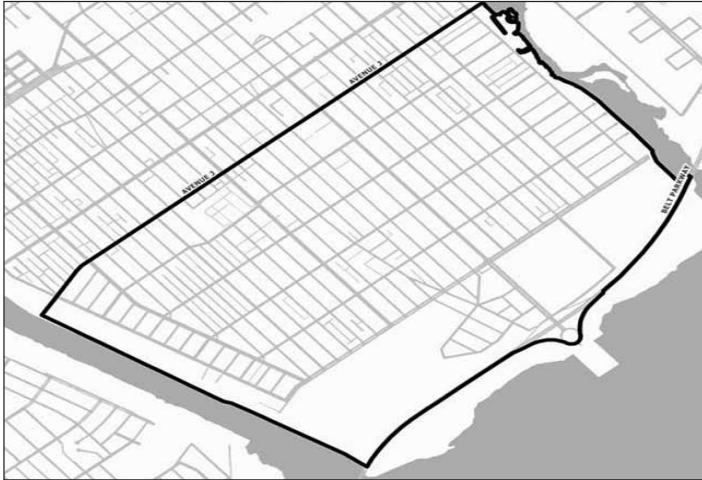
Map 3 Neighborhood Recovery Area in Brooklyn Community District 18