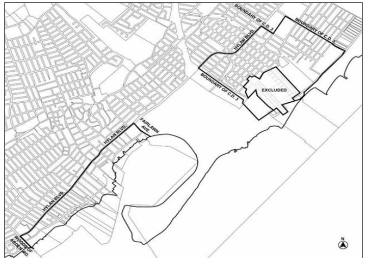
Map 8 Neighborhood Recovery Area in Staten Island Community District 3 (1 of 2)

Areas designated by New York State as part of the NYS Enhanced Buyout Area Program are excluded from the neighborhood recovery areas and are designated on this map as "Excluded"