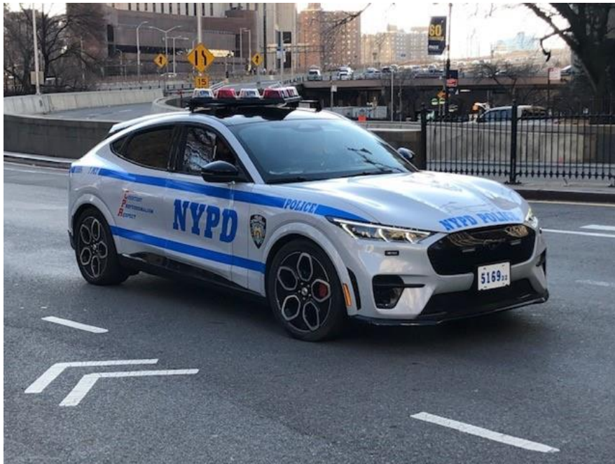
One of the New York City Police Department's Ford Mustang all-electric police units.

The City of New York has committed by Executive Order 90 to achieving an electric fleet by 2035 for light and medium-duty models. The largest part of the City's fleet are vehicles assigned to law enforcement agencies. There are currently 9,466 on-road vehicles assigned to law enforcement agencies, or 40% of the total on-road fleet. The largest is of course the New York City Police Department at 8,111 units. Other agencies with law enforcement vehicles include Correction, Sheriff, Sanitation, Environmental Protection, Parks, Investigation, Emergency Management, Probation, Taxi, the Business Integrity Commission, and DCAS.