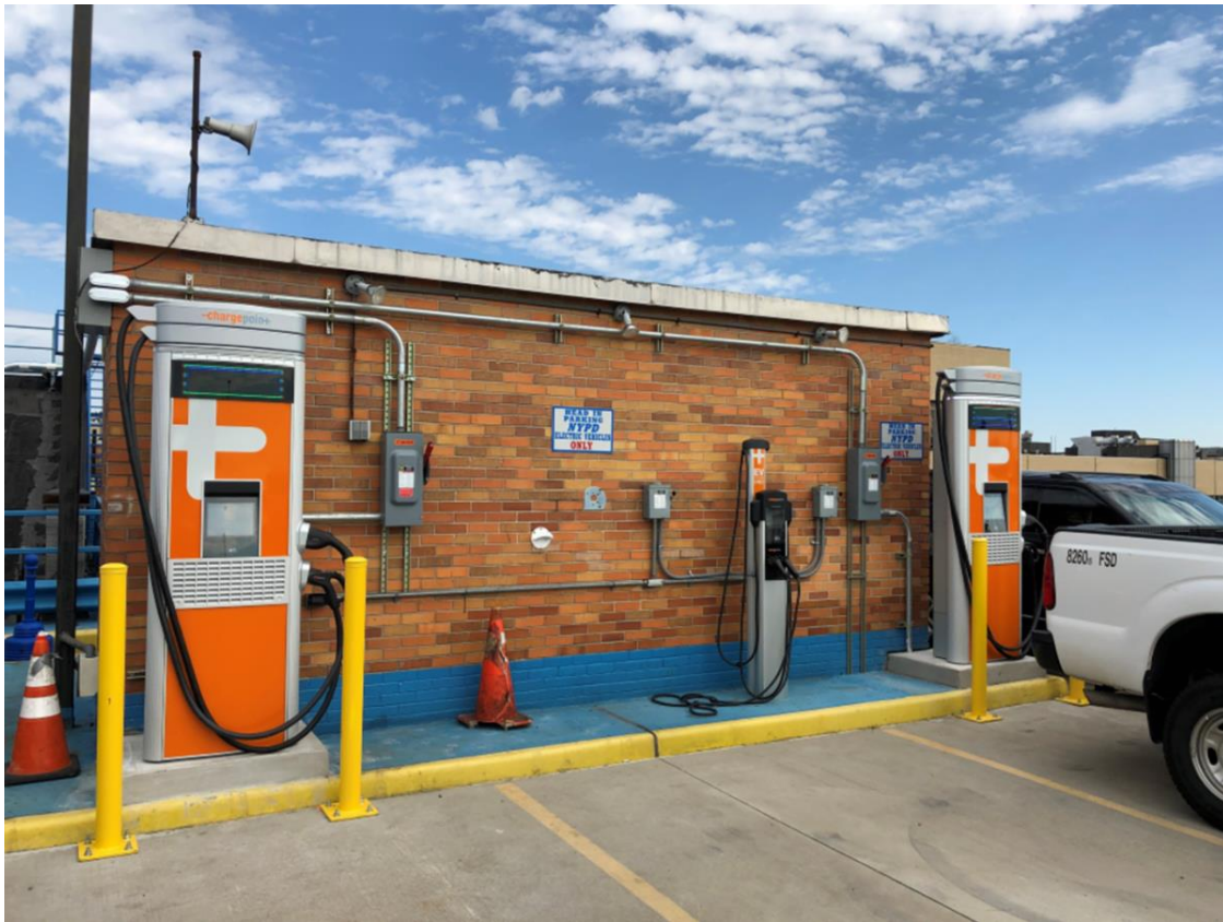
Electric vehicle chargers available for NYPD electric units.

DCAS thanks NYPD and all our law enforcement partners for their support of this effort. Electrifying this aspect of fleet operations is not easy and we will face many hurdles as this process continues. That said, when law enforcement goes electric, it proves that any vehicle, anywhere, can do the same.