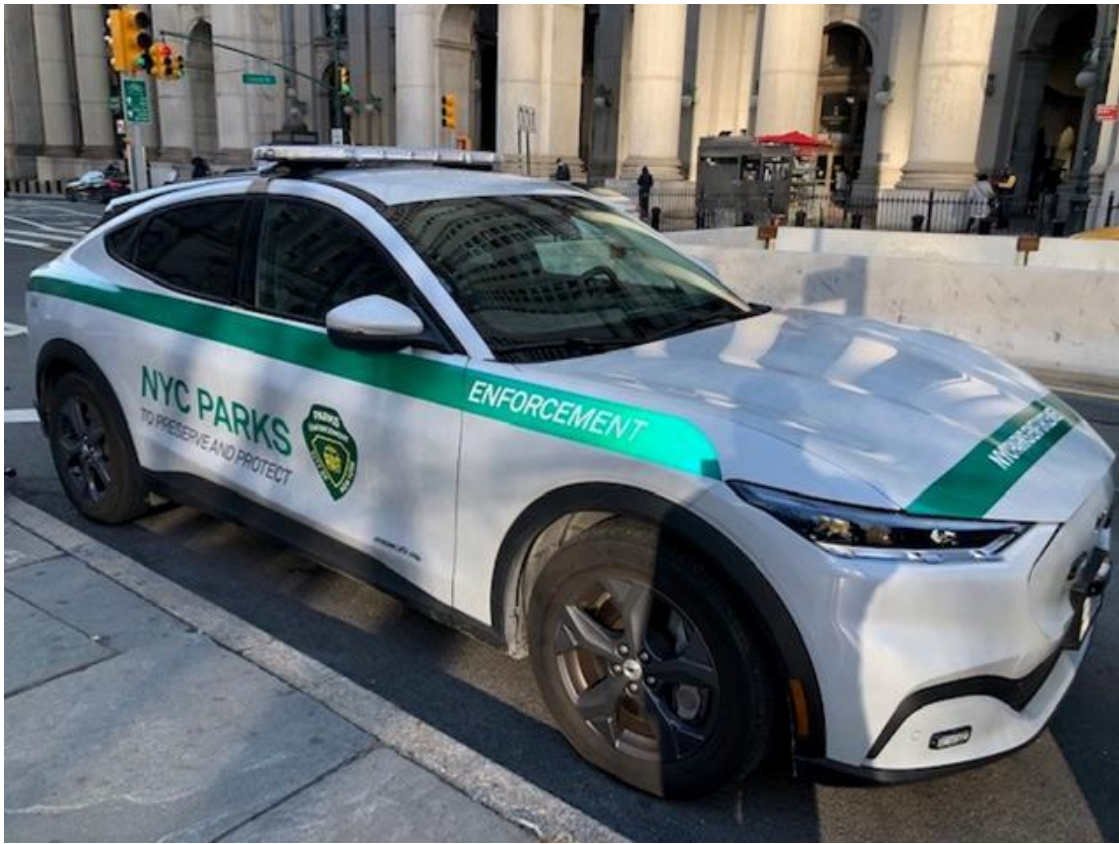
One of the New York City Parks' Ford Mustang all-electric units.

DCAS has begun the charger investment with 51 fast chargers installed at NYPD alone to date. The current DCAS fast charger is 50KW. DCAS is bidding out for 125 to 250 KW charging this spring to enable faster turn-around on police vehicles and also electric trucks. DCAS is also expanding its rollout of solar chargers and battery storage chargers, which can provide critical emergency power.