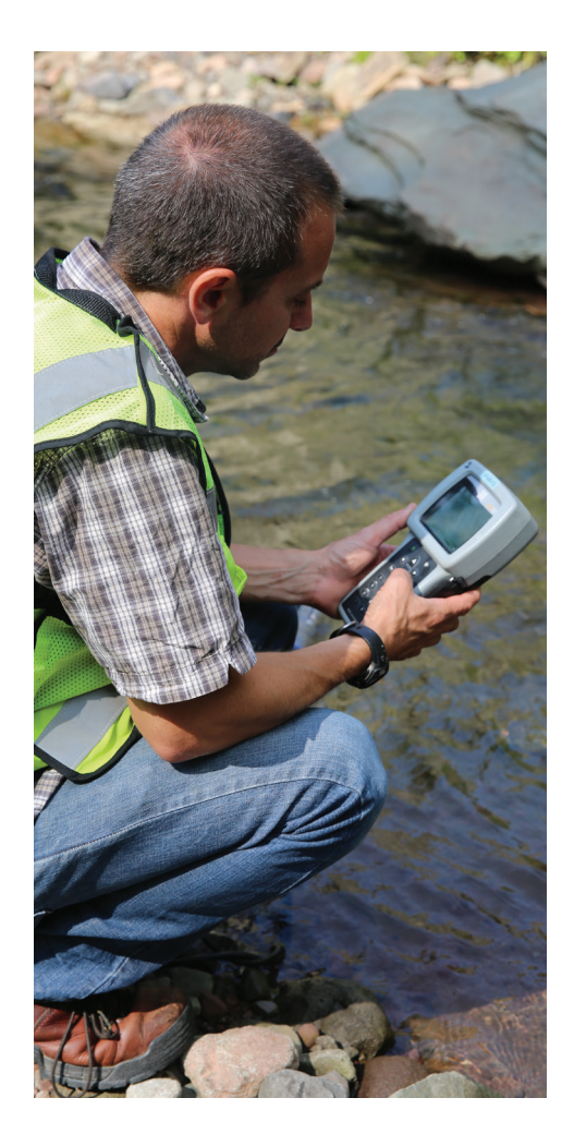
DEP's water quality monitoring program—far more extensive than required by law—demonstrates that the quality of New York City's drinking water remains high and meets all state and federal drinking water standards.