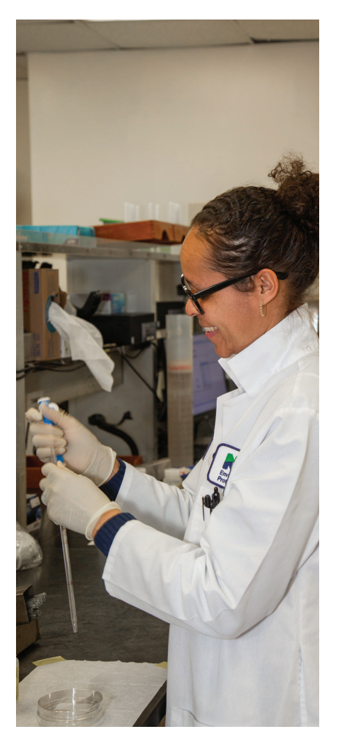
DEP's Distribution Water Quality Laboratory in Queens, NY where DEP scientists analyze thousands of water samples from across the five boroughs seven days a week, 365 days a year.