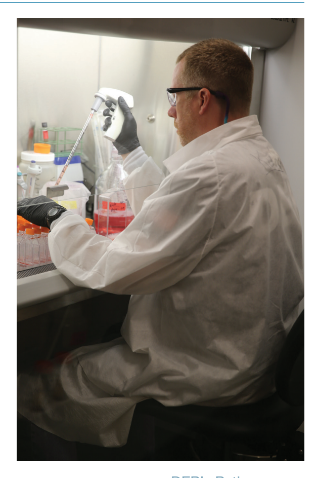
DEP's Pathogen Laboratory in Kingston, NY where DEP scientists analyze drinking water samples for Cryptosporidium and Giardia.

DEP's Waterborne Disease Risk Assessment Program conducts disease surveillance for cryptosporidiosis and giardiasis to track the disease incidence, and syndromic surveillance for gastrointestinal illness to identify potential citywide gastrointestinal outbreaks. Persons diagnosed with cryptosporidiosis are interviewed concerning potential exposures, including tap water consumption. Disease and syndromic surveillance indicates that there were no outbreaks of cryptosporidiosis or giardiasis attributed to tap water consumption in New York City in 2019.