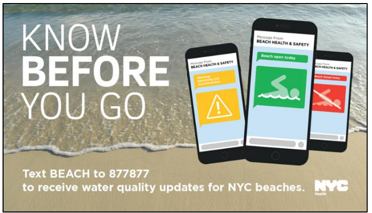
FIGURE 3: KNOW BEFORE YOU GO TEXTING PROGRAM

In 2019, the Department's outreach strategy included promotional posts on its social media platforms (Twitter, Facebook and Instagram), examples of which are shown in Figure 3. At the beginning of the season, the texting service had 12,225 English-language subscribers and 574 Spanish-language subscribers. By the close of the beach season, there were 13,086 English-language subscribers (7% increase) and 588 Spanish-language subscribers (2% increase).