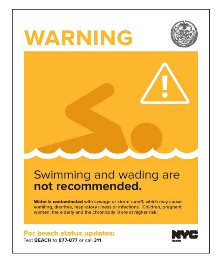
FIGURE 2: BEACH WARNING AND CLOSED SIGNS

The Department continued its effort to improve public notification and risk communication during the 2019 beach season. Easy-to-interpret signs shown in Figure 2 were used for beach closures and warnings in 2019.