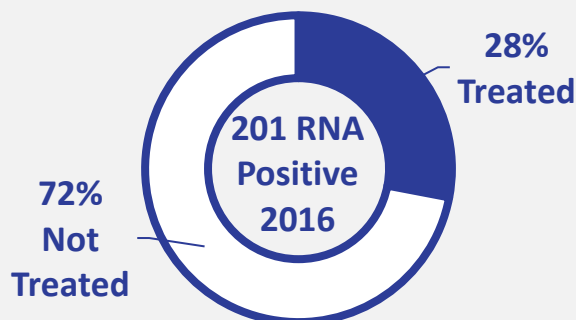
Treated by end of 2017

Number of people who tested hepatitis C RNA positive at Coney Island Hospital in 2016 and 2017, and percentage who initiated treatment by the end of 2017 and 2018.