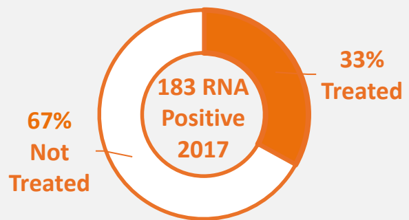
Treated by end of 2018

Data source: New York City Health Department Surveillance.