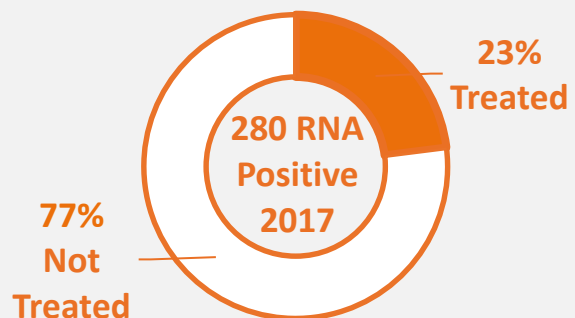
Treated by end of 2018

Data source: New York City Health Department Surveillance.