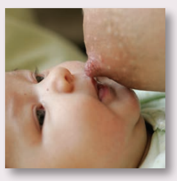
3. If your baby does not open their mouth, you can touch your nipple to their lips to get them to open up.