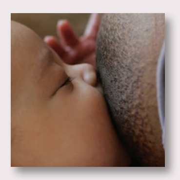
4. When your baby opens their mouth wide, move it onto the nipple by pulling them toward you. This is called "latching on."