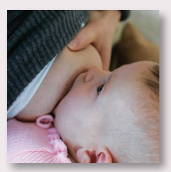
5. Get as much of your areola — the dark area around your nipple — into the baby's mouth as possible.