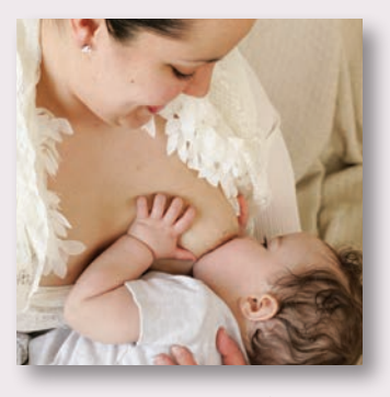
6. Watch to see if your baby is sucking and swallowing easily. Listen for the sounds of a happy, feeding baby.