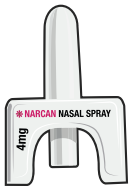
Single-step Nasal Spray