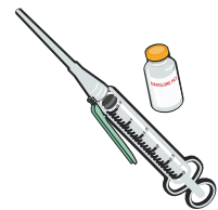
Multi-step Intramuscular Injection

*The Evzio® auto-injector is available without a prescription at CVS, Duane Reade and Walgreens. Evzio® is available at additional pharmacies with a patient-specific prescription.