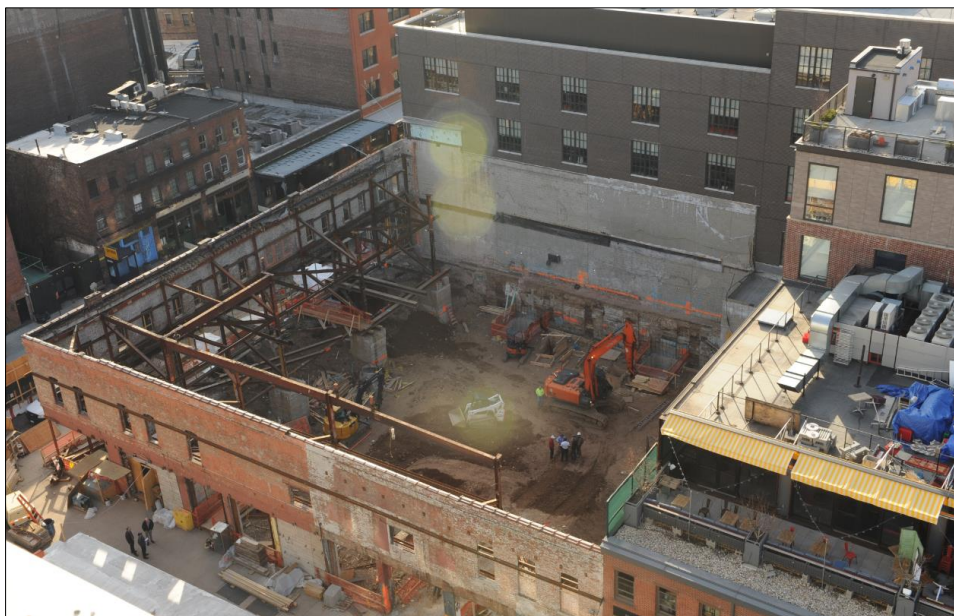
Pictured: 9-19 Ninth Avenue on the day of April 6, 2015

Defendants Accused of Failing to Heed and Address Repeated Warnings About Unsafe Work Conditions, Contributing to Worksite Cave-In and Death of Worker