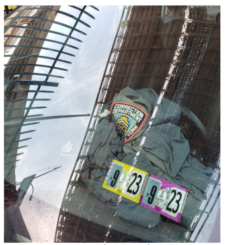
Department of Correction Uniform