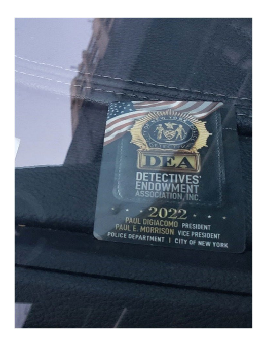
Detective's Endowment Association Sticker