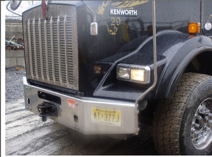
Truck/License Nos. 29/AT-377J NJ