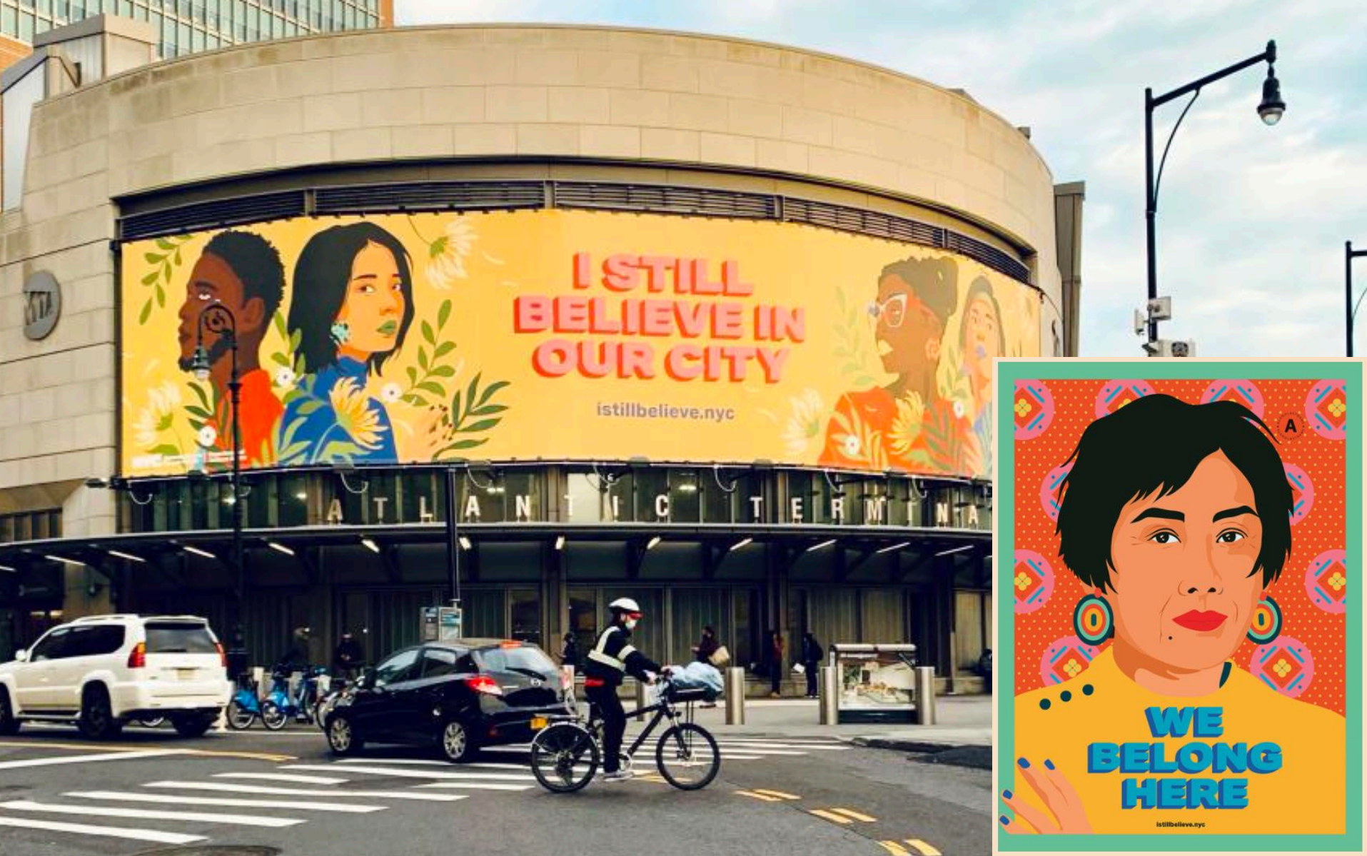
- AMANDA PHINGBODHIPAKKIYA & COMMISSION ON HUMAN RIGHTS (CCHR)