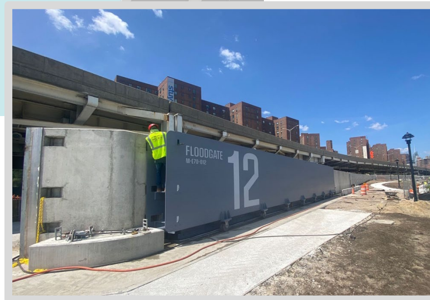
Flood Gate 12 installed at Stuyvesant Cove Park @ E. 20 th Street entrance