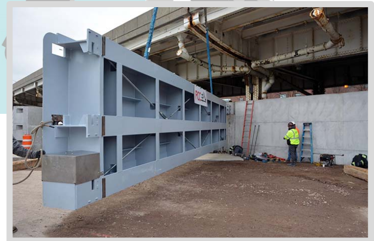
Operation 1: First floodgate installed at Stuyvesant Cove Park February 24, 2022.