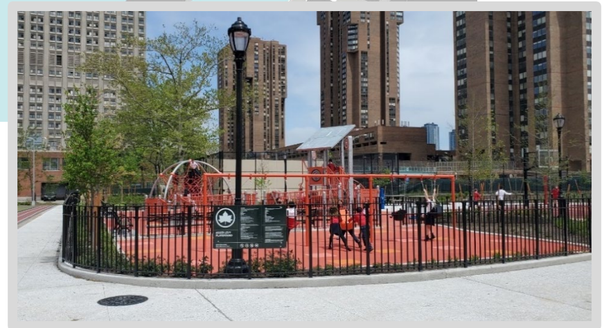
Asser Levy Playground open to the public