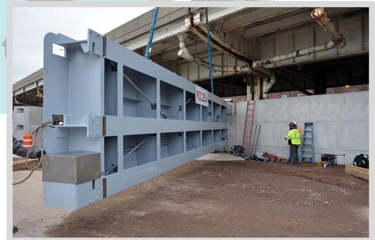
Operation 1: First floodgate installed at Stuyvesant Cove Park February 24, 2022.