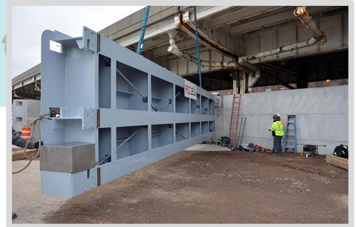
Operation 1: First floodgate installed at Stuyvesant Cove Park February 24, 2022.