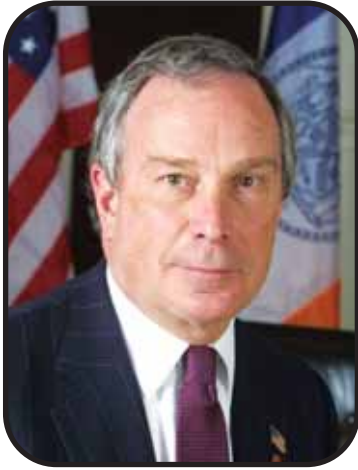
Michael R. Bloomberg Mayor

I t is an honor to welcome everyone as the world's greatest Fire Department presents its 2011 Administrative Medals and Awards.