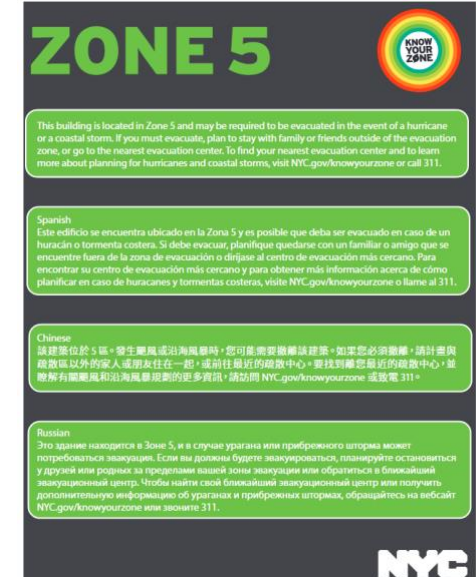
SAMPLE CHECK YOUR LOBBY FOR YOUR ZONE OR "KNOW YOUR ZONE" ON WWW.NYC.GOV

Coastal storms cause life-threatening storm surges, flooding, high wind conditions and utility disruptions. Hurricanes alone have caused more than 200 deaths in New York City over the last century.