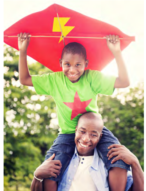
Photo for illustration purposes only. The people shown are models.

Two weeks to get two times the credit. And maybe put child support debt behind you. Forever.