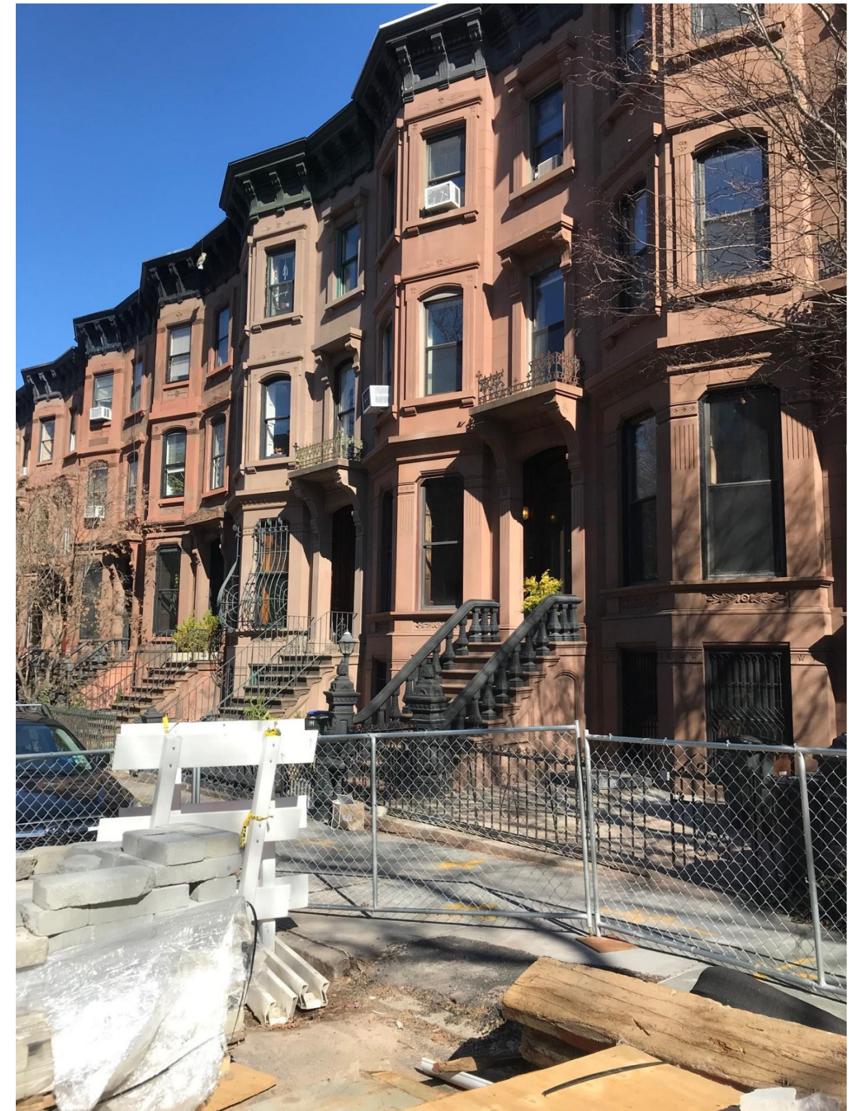
Westward View of 199 St. Johns St.