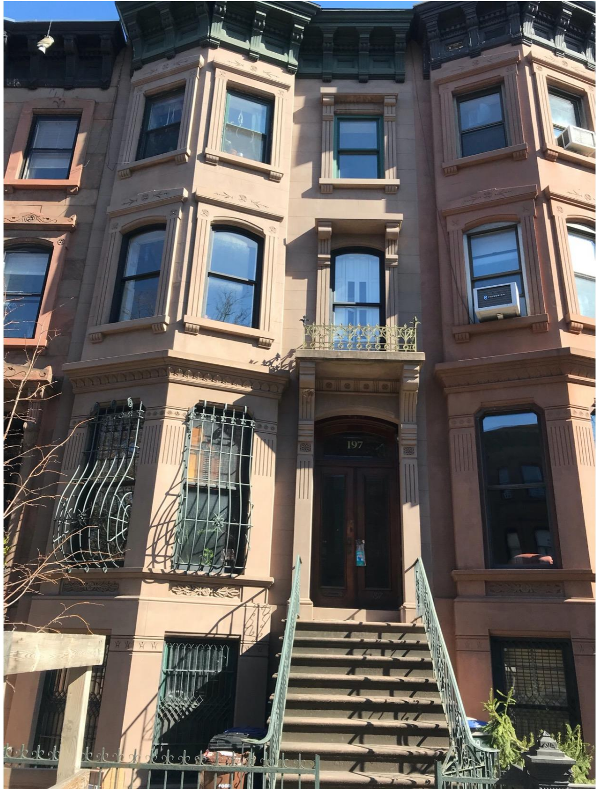
197 St. Johns Pl. Showing Original Windows Adjacent to 199 St. Johns Place