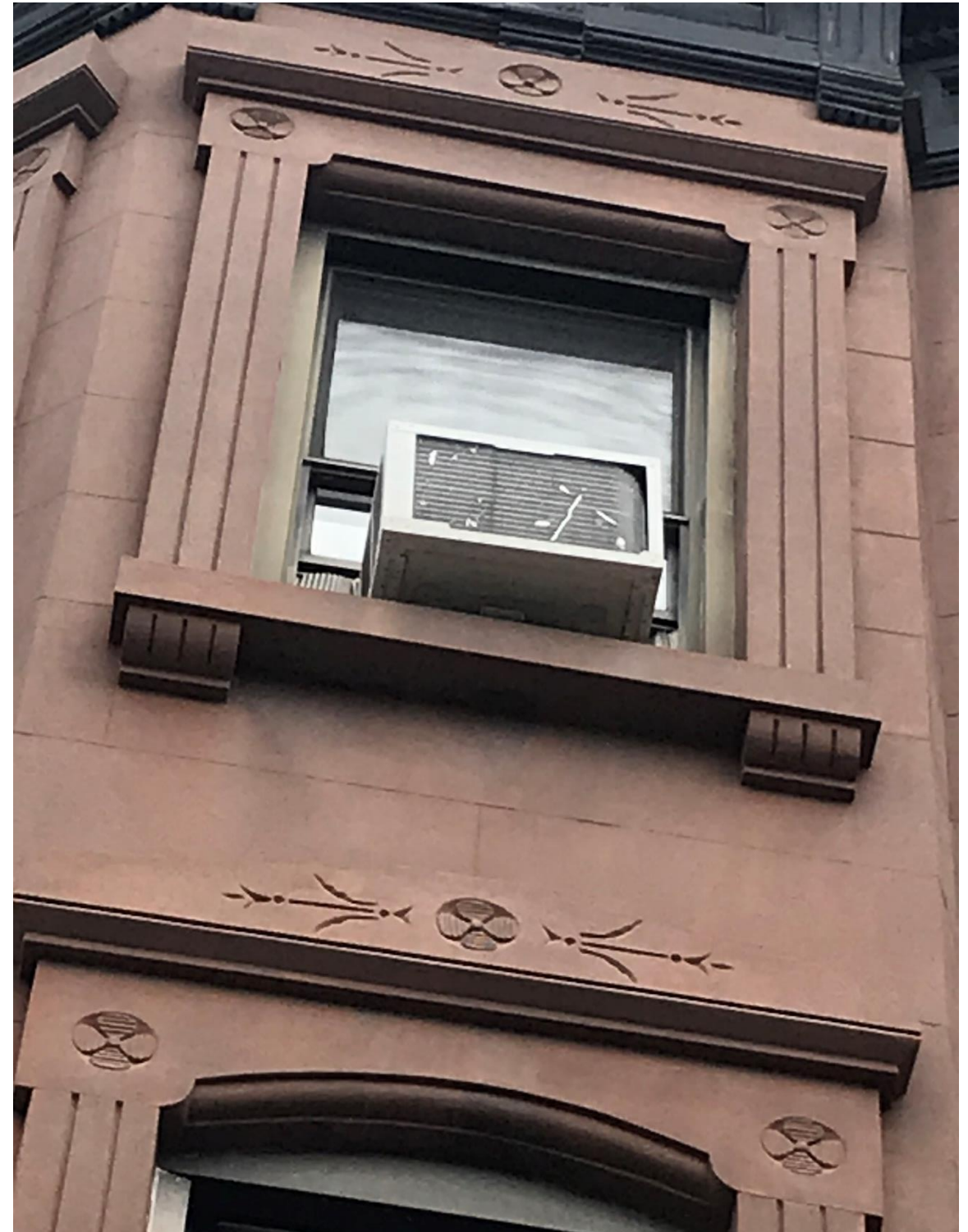
Top Floor Middle Window Close up