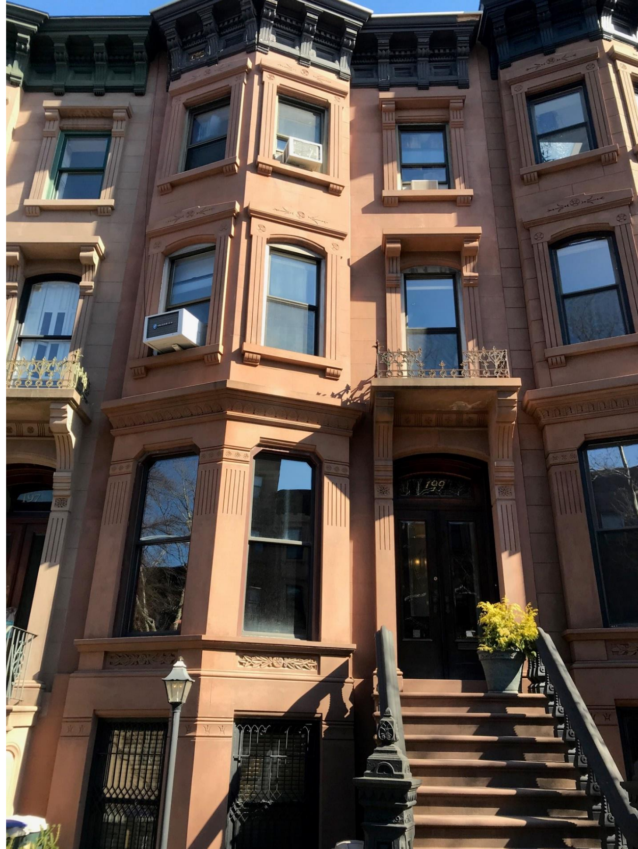
Front View of 199 St. Johns St.