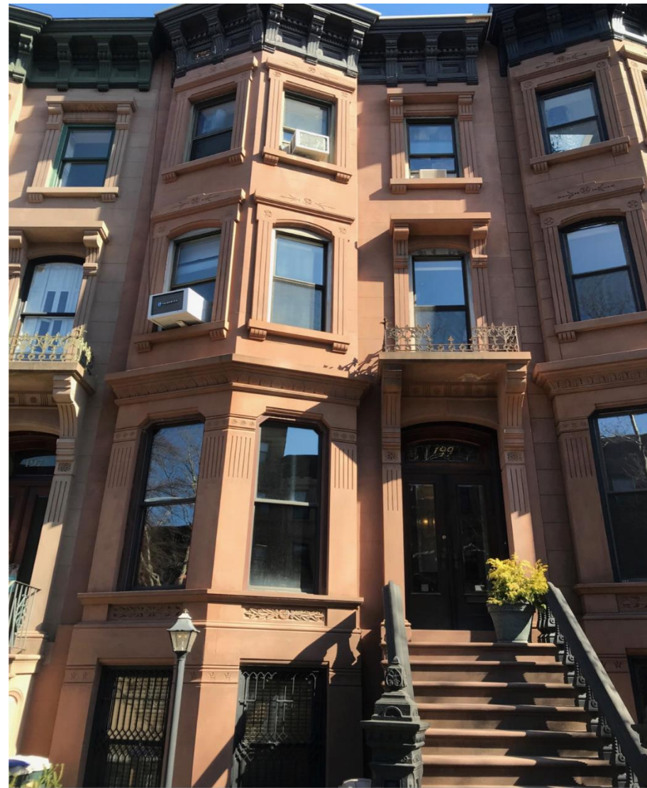
Existing Conditions of Completed work without LPC Permits

Legalize alterations to windows without LPC Permit(s)