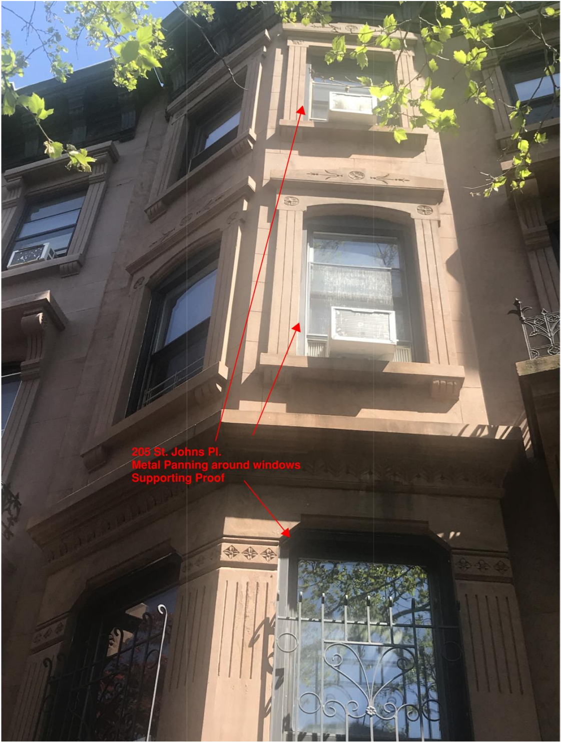
205 St. Johns Place With Metal windows and Metal Panning