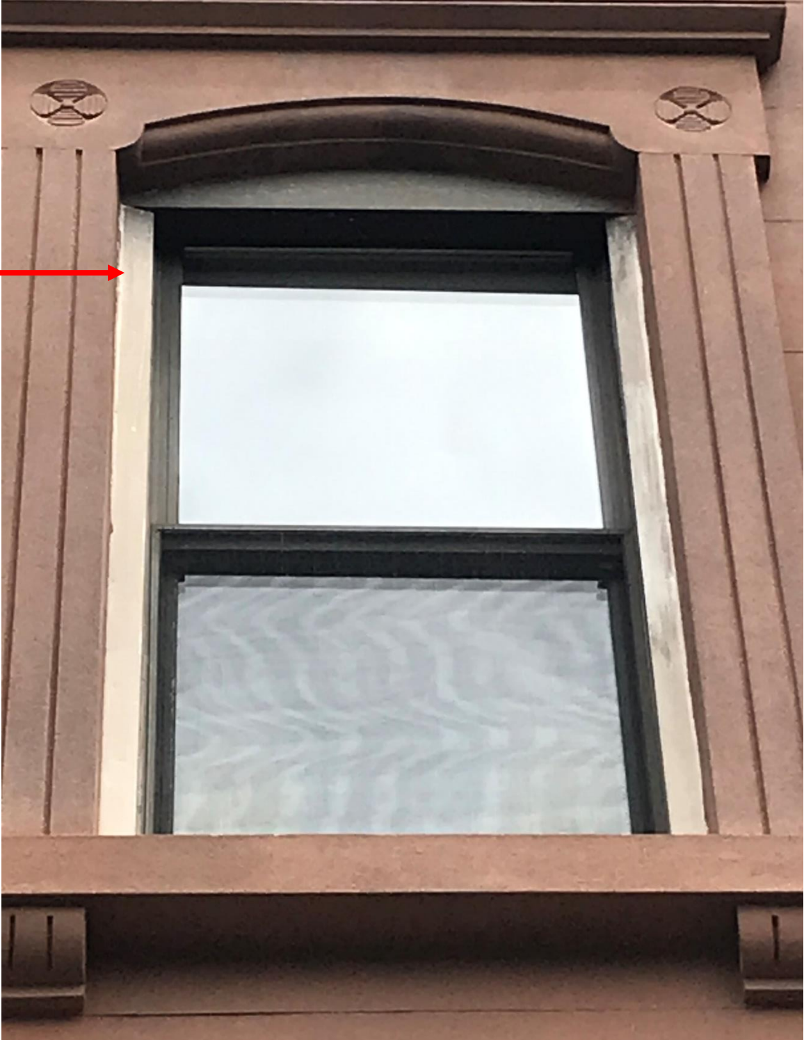
2 nd Floor Left Side Window Close up of Metal Panning