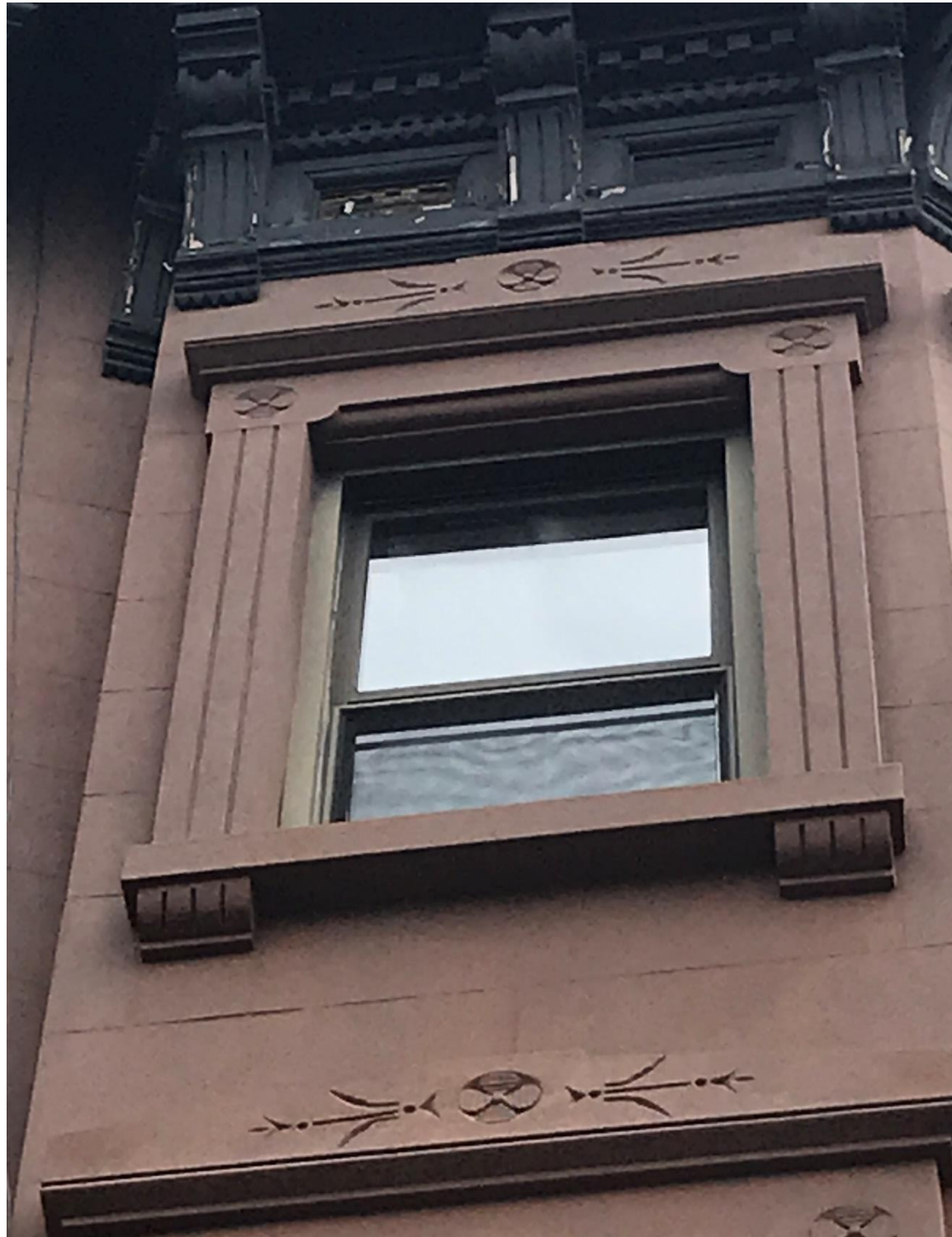
Top Floor Left Side Window Close-up