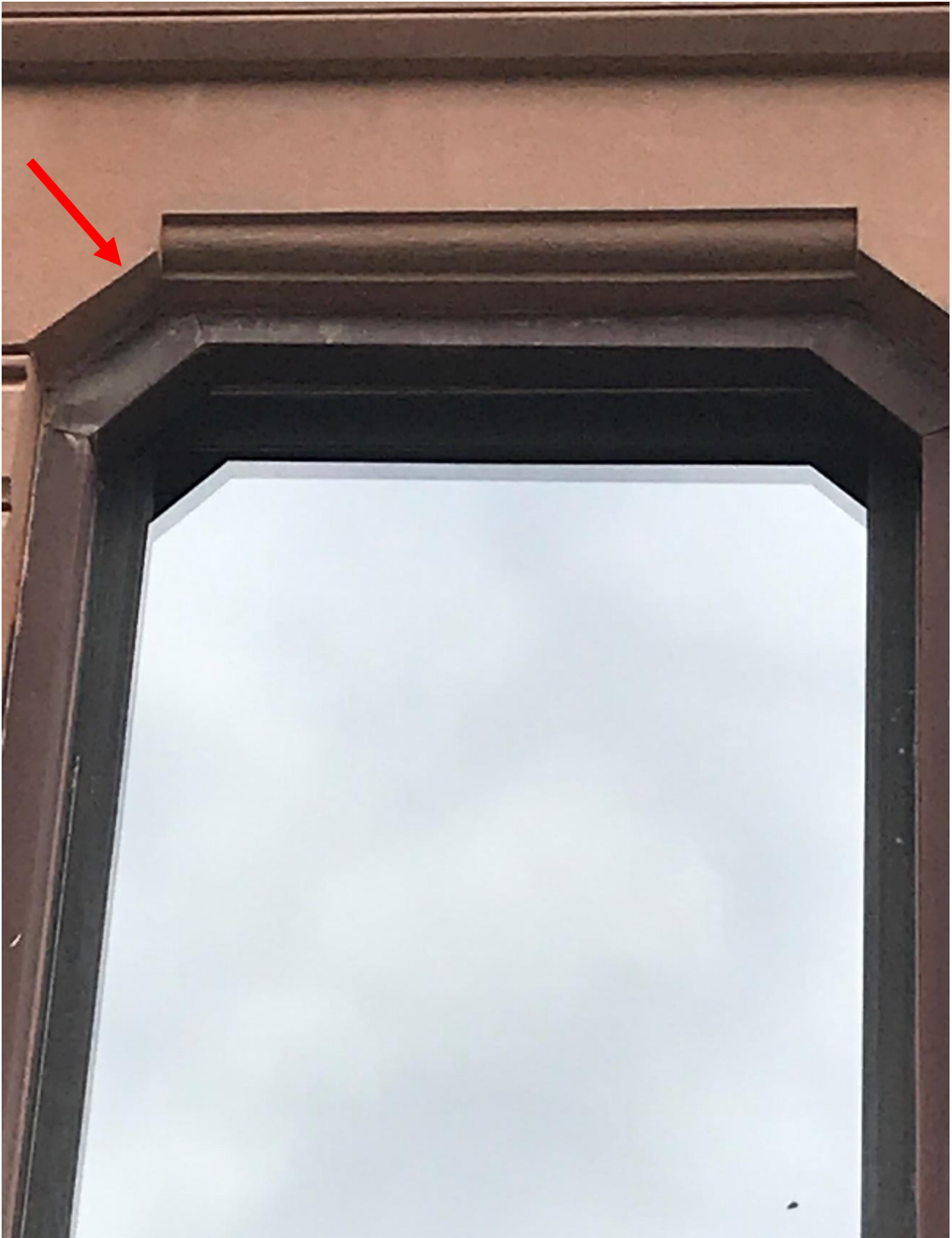
Parlor Floor Left Side Window – Top Header Profile – Showing Metal Panning Close-up