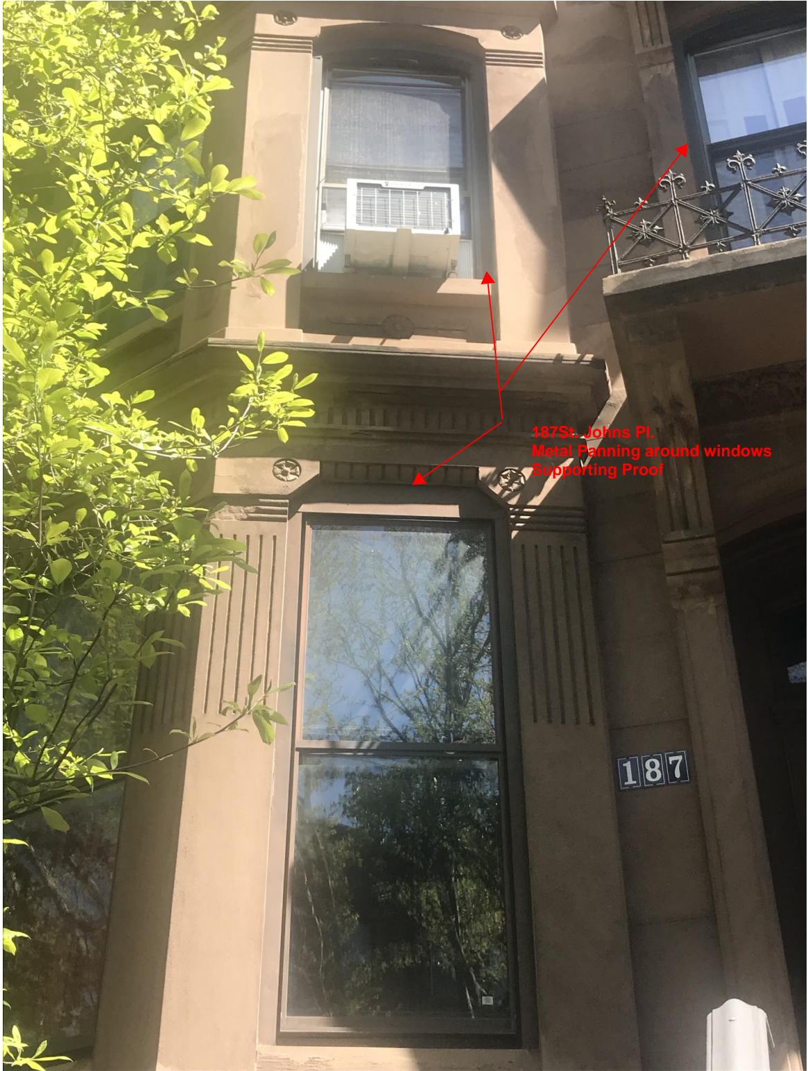
187 St. Johns Place With Metal Windows and Metal Panning