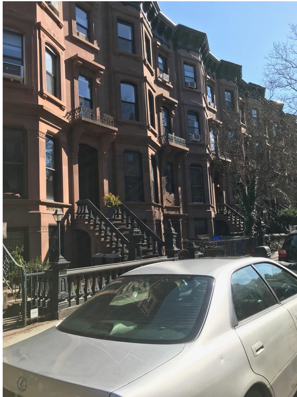
Eastward View of 199 St. Johns St.