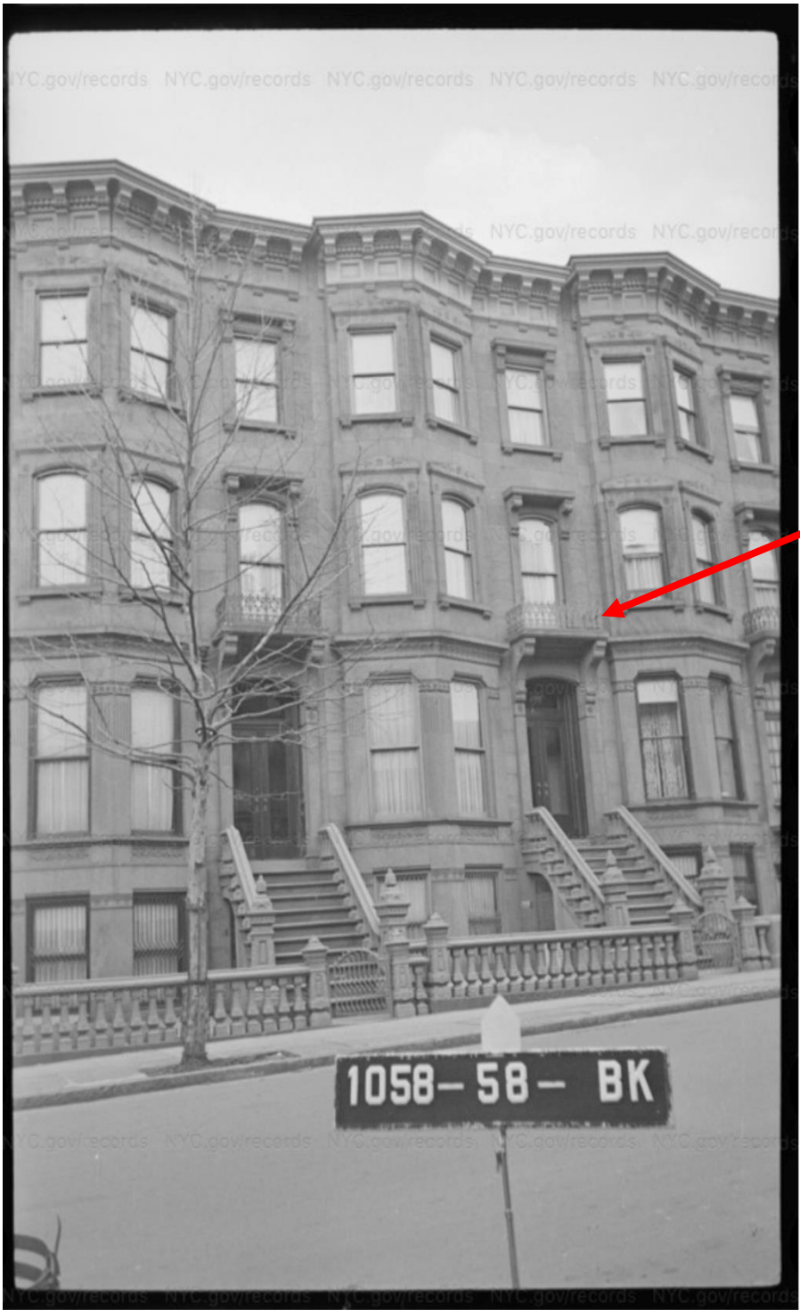
Historic Conditions Showing Original Wood Windows With Brick-molding