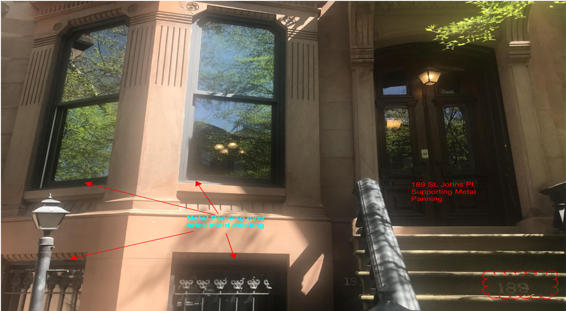
189 St. Johns Place With Metal windows and Metal Panning