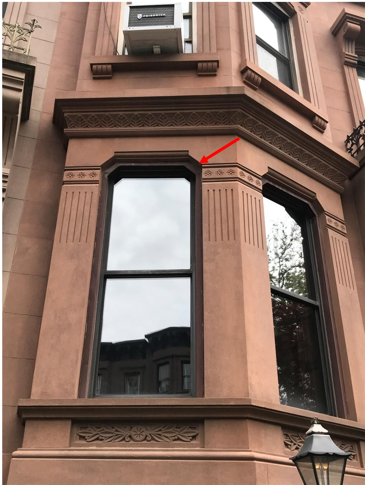
Parlor Floor Left Side Window