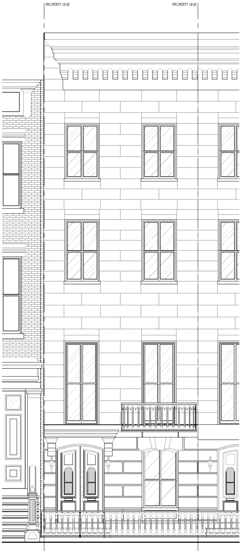
EXISTING FRONT FACADE

15 WATTS STREET 4TH FLOOR NEW YORK NY 10013