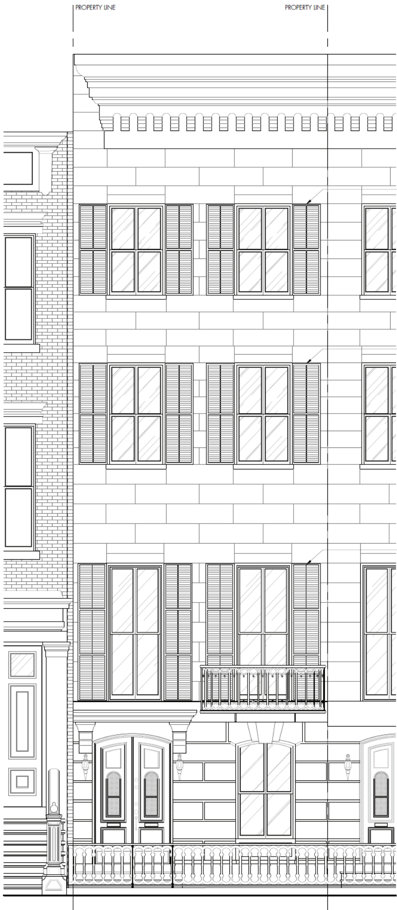
PROPOSED FRONT FACADE

PAINTED WOOD SHUTTERS INSTALLED AT EXISTING PINTLES W/ NEW SHUTTER STAYS