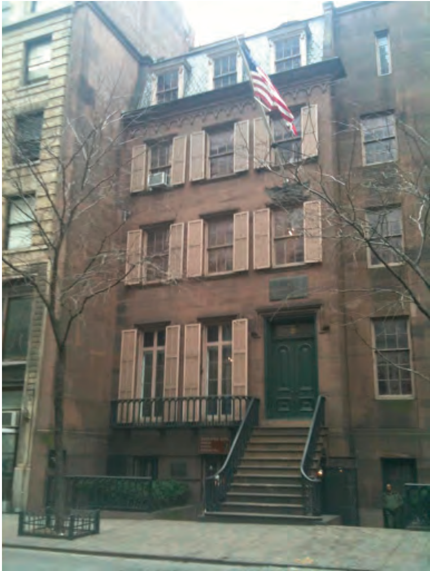
28 EAST 20TH STREET, AT DESIGNATION

15 WATTS STREET 4TH FLOOR NEW YORK NY 10013