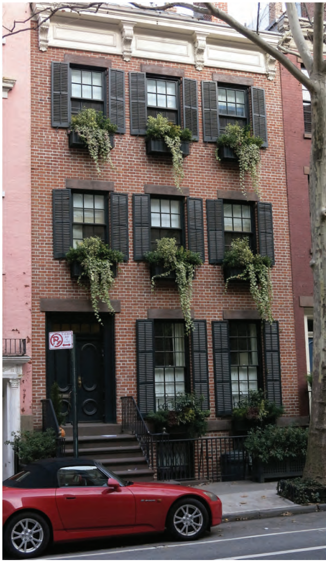
35 WEST 10TH STREET, AT DESIGNATION