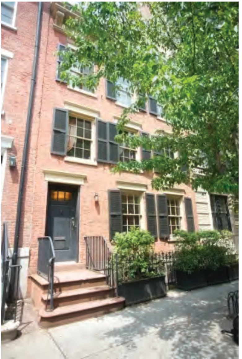
273 WEST 12TH STREET, AT DESIGNATION