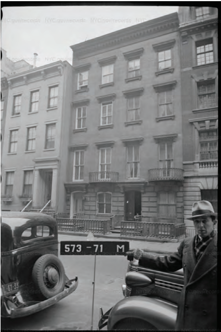
53 WEST 9TH STREET BUILT: 1854 for GOERGE BRODHEAD STYLE: ANGLO-ITALIANATE