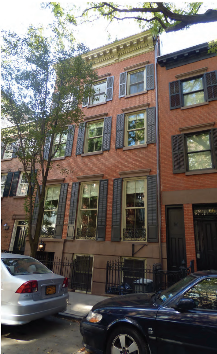
64 BANK STREET, LPC-APPROVED Under Certificate of Appropriateness 13-1400 (LPC 12-7164), issued May 1, 2012