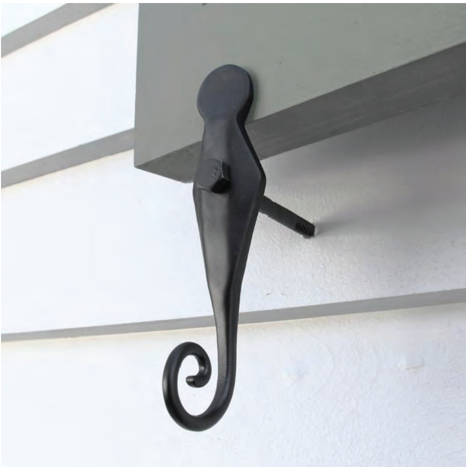
MORTISED PINTELS & RAT TAIL SHUTTER DOGS