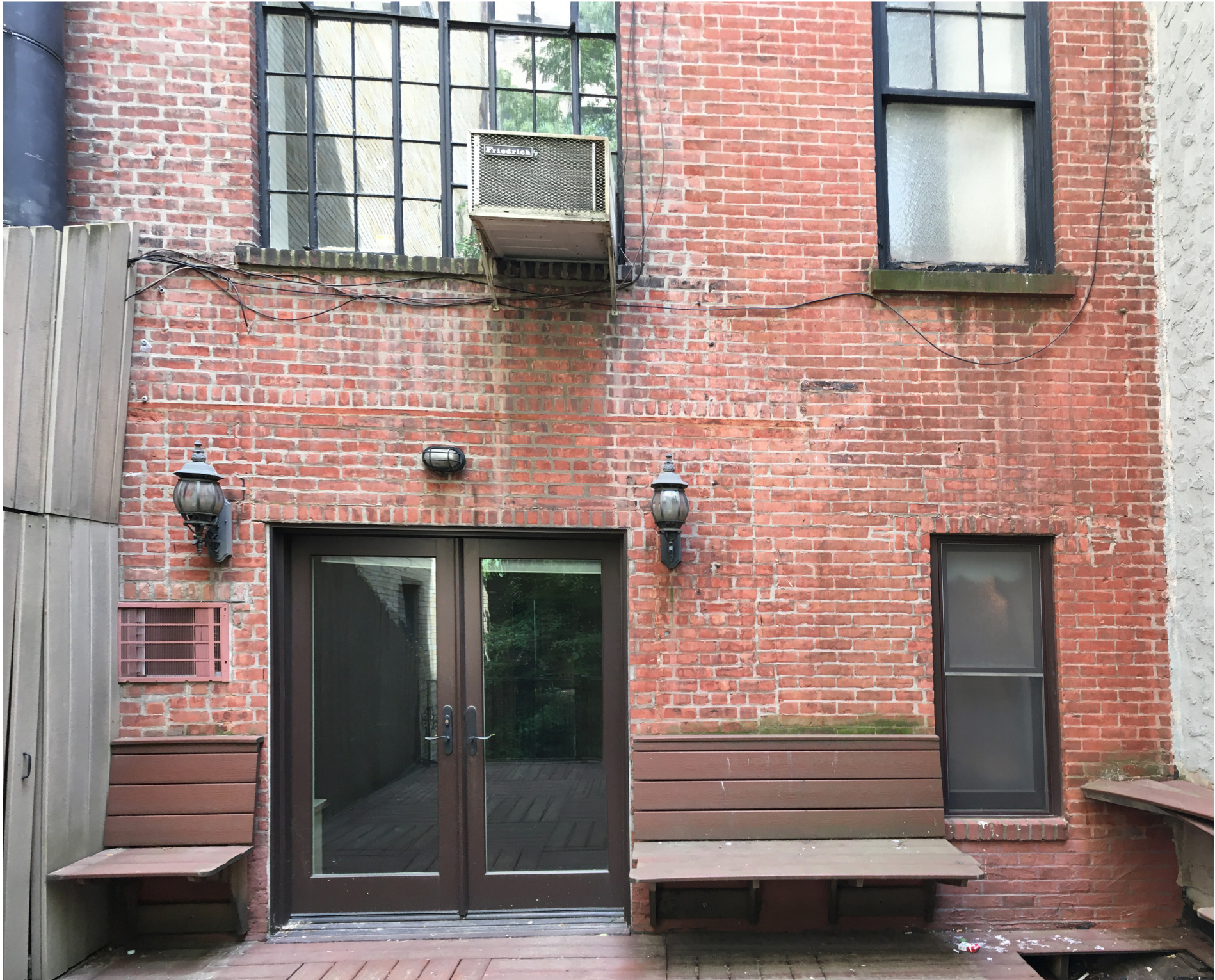
Existing Rear Terrace - Second Floor