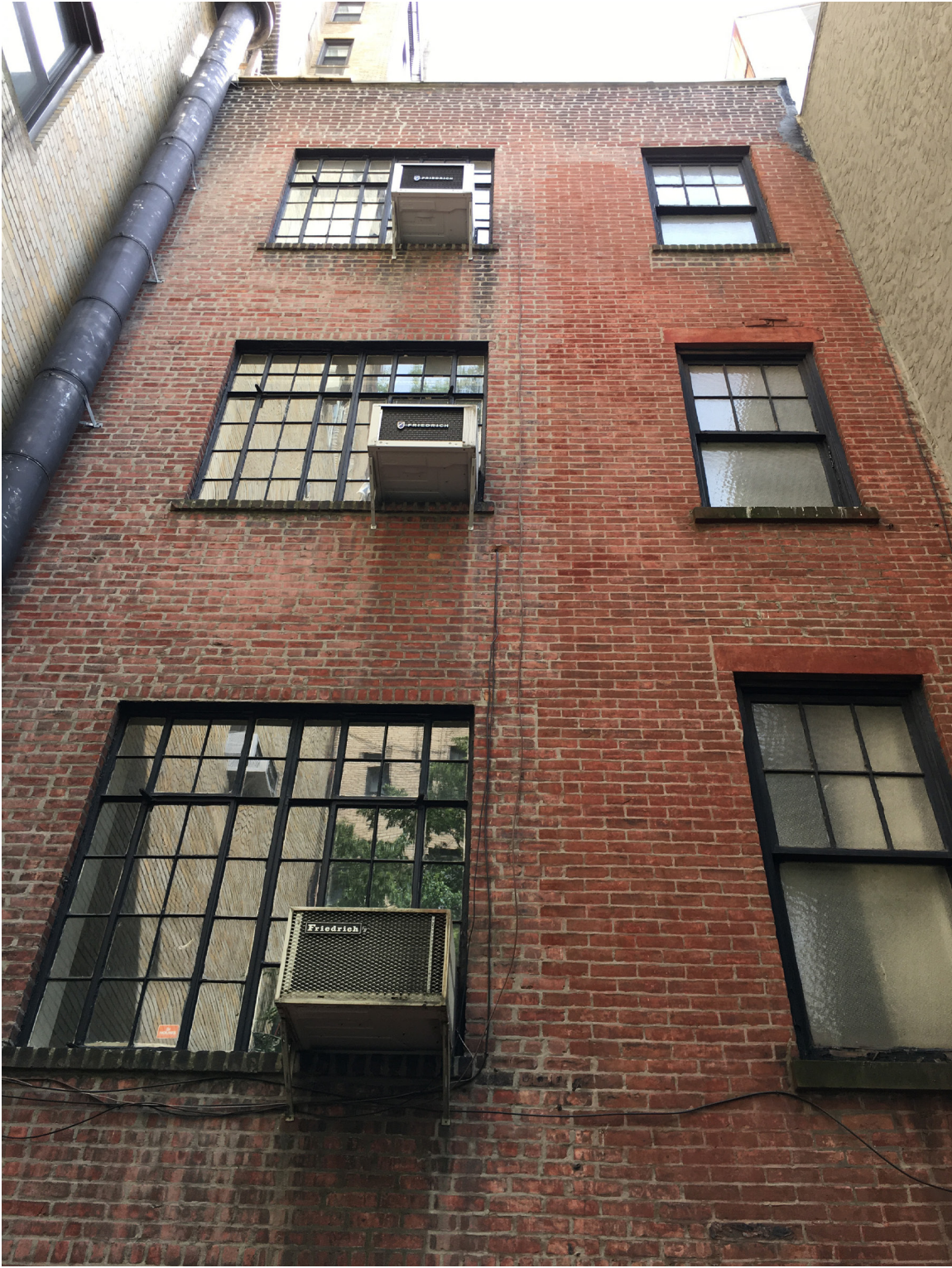
Existing Rear Facade - Third, Fourth, and Fifth Floors