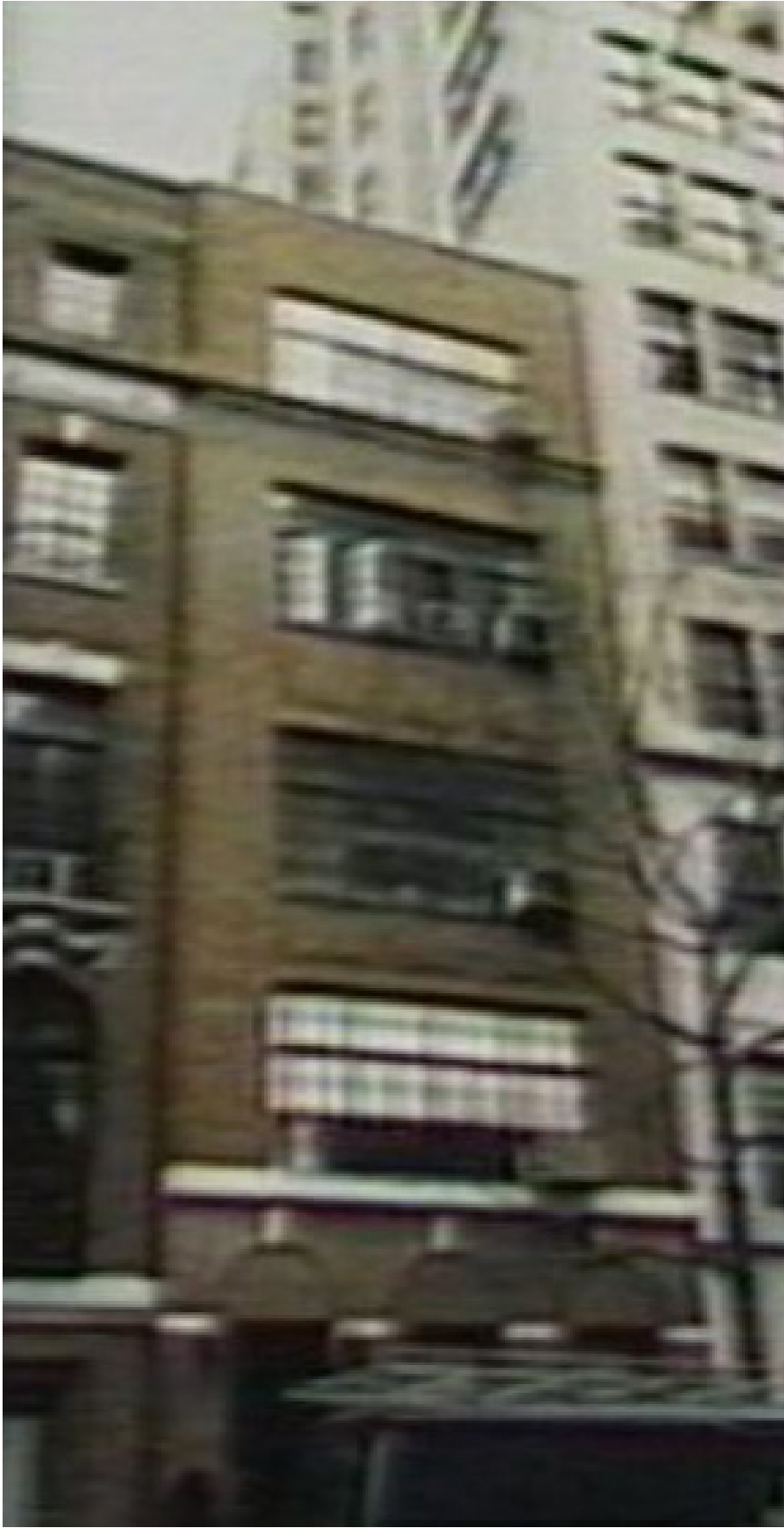
1980 Tax Photo