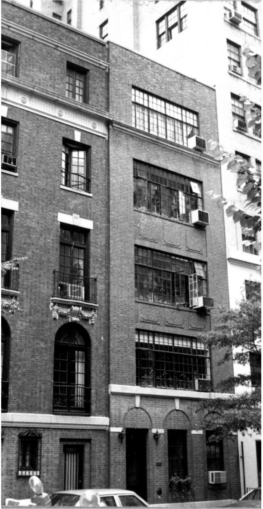
1981 Designation Photo