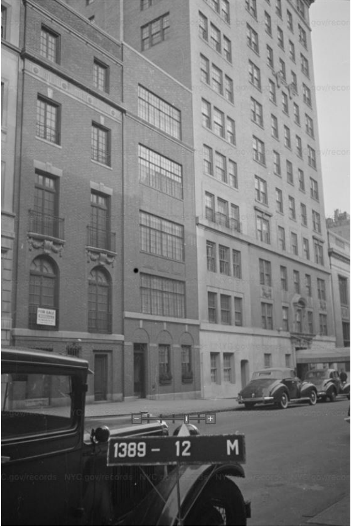
1940 Tax Photo