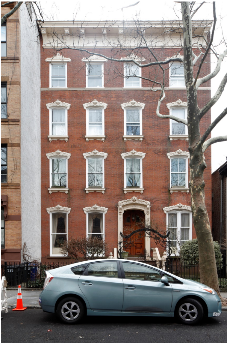
238 President Street House, LPC, 2018

Proposed Action: Proposed for Calendaring April 10, 2018