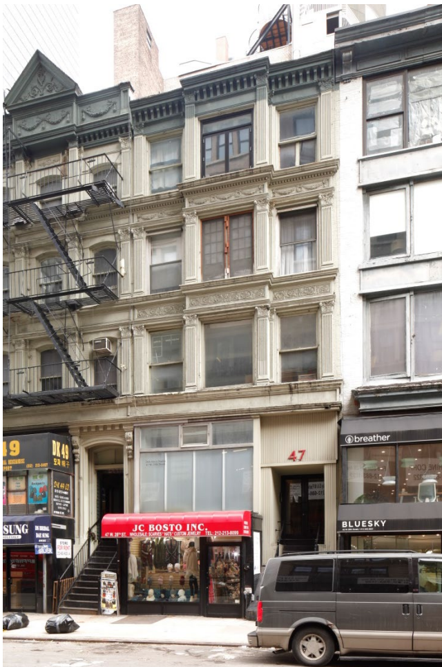
47 West 28th Street, Landmarks Preservation Commission, 2019

47 West 28th Street was built c.1852 as an Italianate row house, intact elements of which include its bracketed cornice, fenestration pattern, and projecting stone lintels and sills. Like other structures on the block, it underwent a conversion to accommodate a retail storefront prior to the Tin Pan Alley era. Above its storefront, it retains much of its historic detail and its form and character reflect its appearance when numerous Tin Pan Alley sheet music publishers made their offices there in the 1890s-1900s. Along with the adjacent row at 49, 51, 53, and 55 West 28th Street, 47 West 28th Street represents Tin Pan Alley's significant contributions to American culture and popular music.