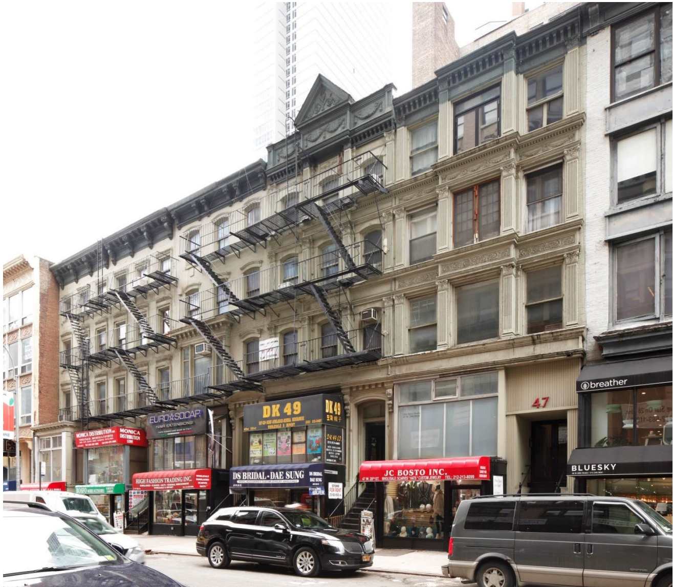
47-55 West 28th Street, Landmarks Preservation Commission, 2019

Action: Proposed for Commission's Calendar, March 12, 2019; Public Hearing, April 30, 2019; Proposed for Designation, December 10, 2019