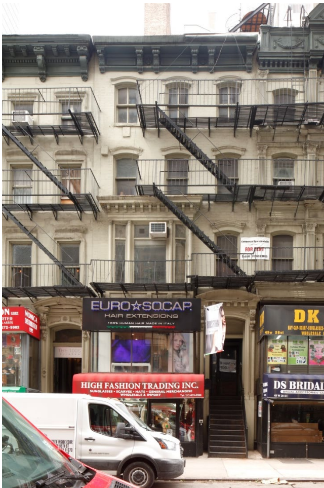
51 West 28th Street, Landmarks Preservation Commission, 2019

51 West 28th Street was built c.1852 as an Italianate row house, intact elements of which include its bracketed cornice, fenestration pattern, and projecting stone lintels and sills. Like other structures on the block, it underwent a conversion to accommodate a retail storefront prior to the Tin Pan Alley era. Above its storefront, it retains much of its historic detail and its form and character reflect its appearance when numerous Tin Pan Alley sheet music publishers made their offices there in the 1890s-1900s. Along with the adjacent row at 47, 49, 53, and 55 West 28th Street, 51 West 28th Street represents Tin Pan Alley's significant contributions to American culture and popular music.