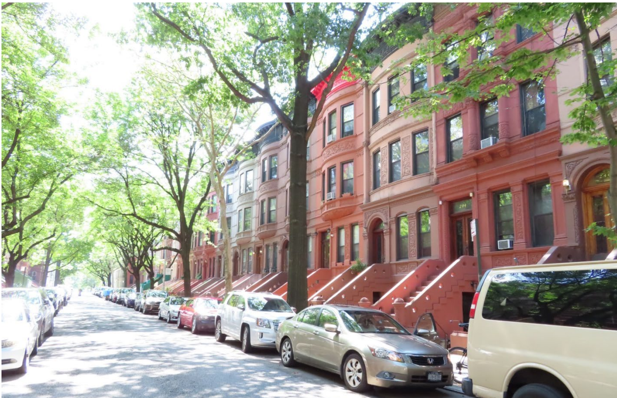
West 137th Street between Adam Clayton Powell, Jr., Boulevard and Frederick Douglass Boulevard, Landmarks Preservation Commission

Proposed Action: Propose for Calendar, February 2, 2021