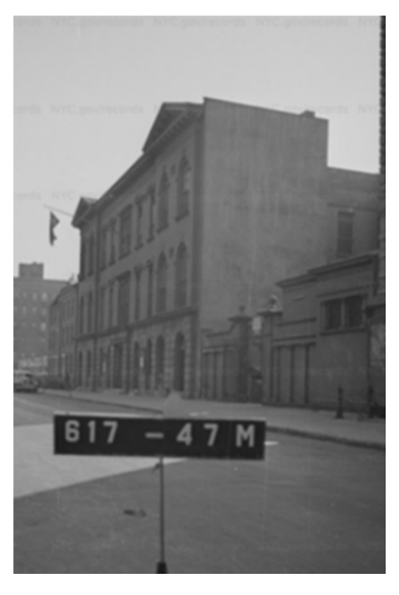
208 West 13th Street ca. 1940, NYC Tax Photograph

Facade restoration and interior renovations have been carried out by the Center during its more than three decades in the building, including a major renovation in 2001 by Francoise Bollack Architects. This work has furthered the Center's mission in the community and upgraded the building to meet safety and code requirements. Since its inception the Center continues to provide services and act as a gathering place, empowering and building a stronger LGBT community in NYC. Today it is home to an archival collection, arts and cultural programing, young adult programs, and career services dedicated to the LGBT community.