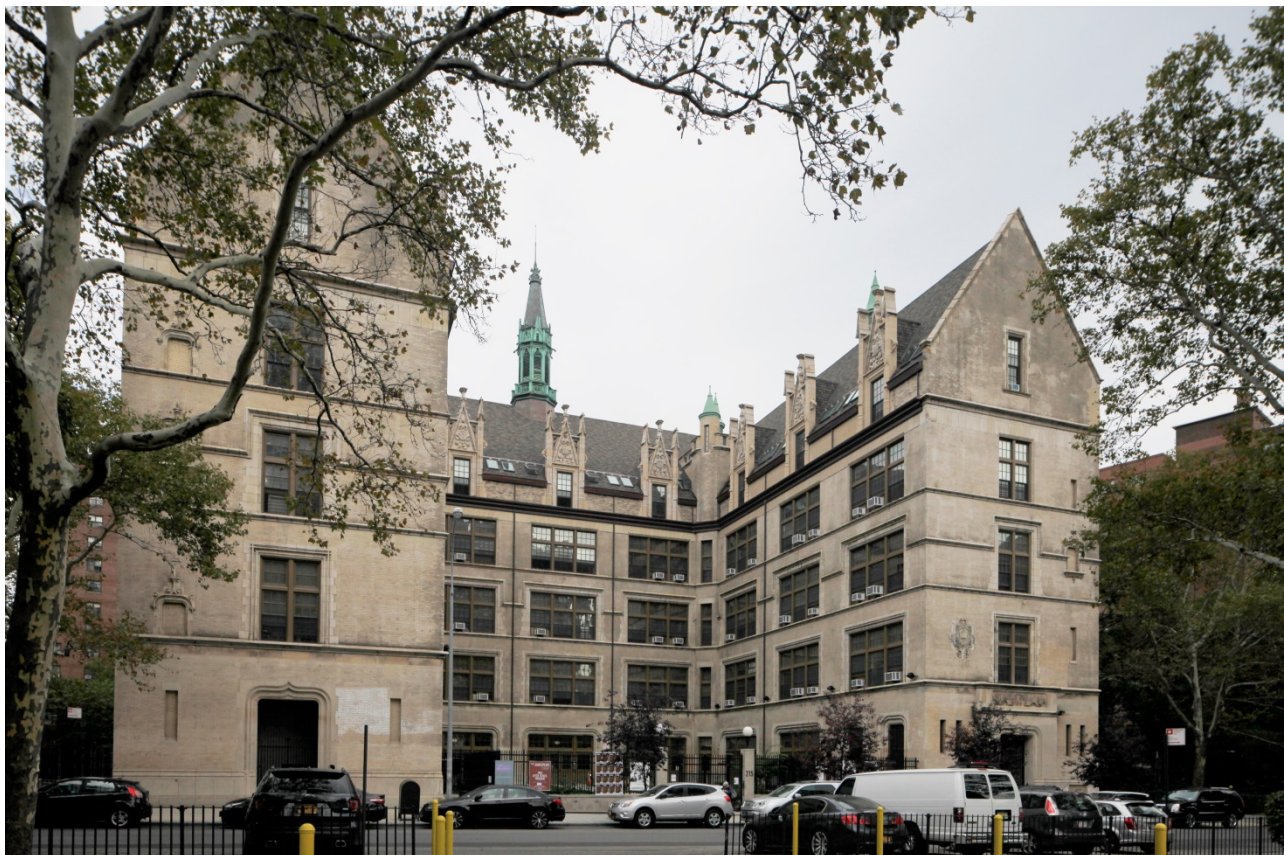
El Barrio's Artspace, previously PS 109, October 2017

Proposed Action: Calendared November 14, 2017; Public Hearing February 13, 2018