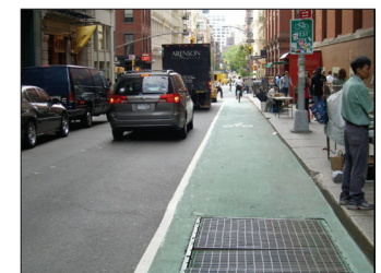
Example of Proposed Reconfiguration: Prince Street