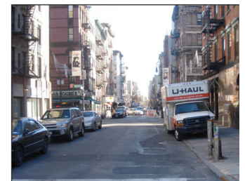
Existing Conditions: Rivington Street

The project proposal updates parking regulations and installs a 6-foot wide green-painted curbside bicycle lane providing a parallel cycling route to the heavily-trafficked Delancey Street. This project adds 1.4 lane miles to the bicycle network and completes a safe, convenient cycling route connecting the Williamsburg Bridge and the Hudson River Greenway.