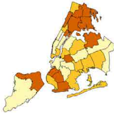
Percent of Population 8.0-19.1% 19.4-23.3% 24.2-30.5%