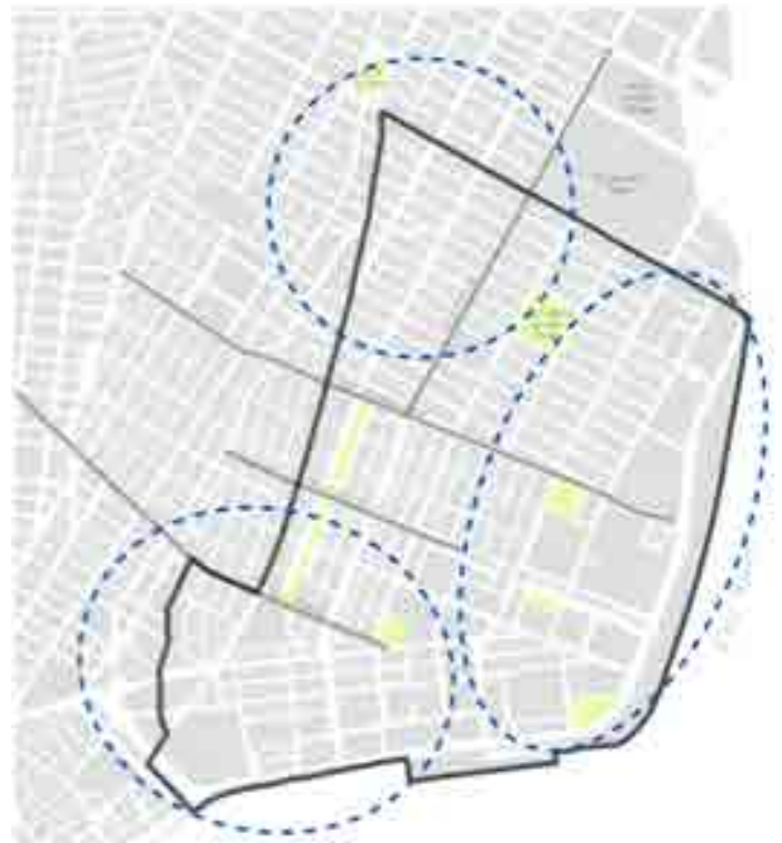
Map 1. Three focus areas from Preliminary Assessment Report

As concluded in a previous report, "A Preliminary Inventory and Assessment of Health Care Facilities in Manhattan Community Board 3," the demographics of the district can be broken down geographically, depicted in Map 1. In the northwest corner, the