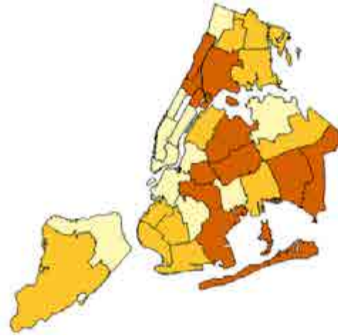
Percent of Population 20.7-33.2% 33.6-35.6% 35.6-45.5%