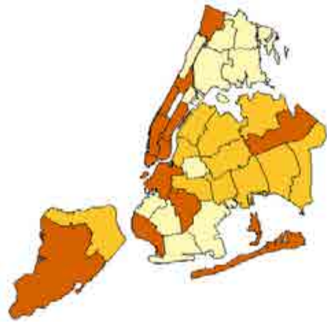
Percent of Population 11.5-22.1% 22.7-28.1% 28.3-45.0%